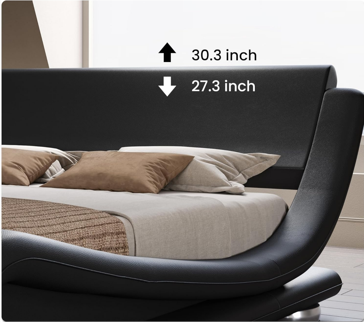
Image Description: This image demonstrates the adjustable headboard feature. It shows the headboard can be set to two different heights, 27.3 inches or 30.3 inches, to accommodate various mattress thicknesses from 8-14 inches.