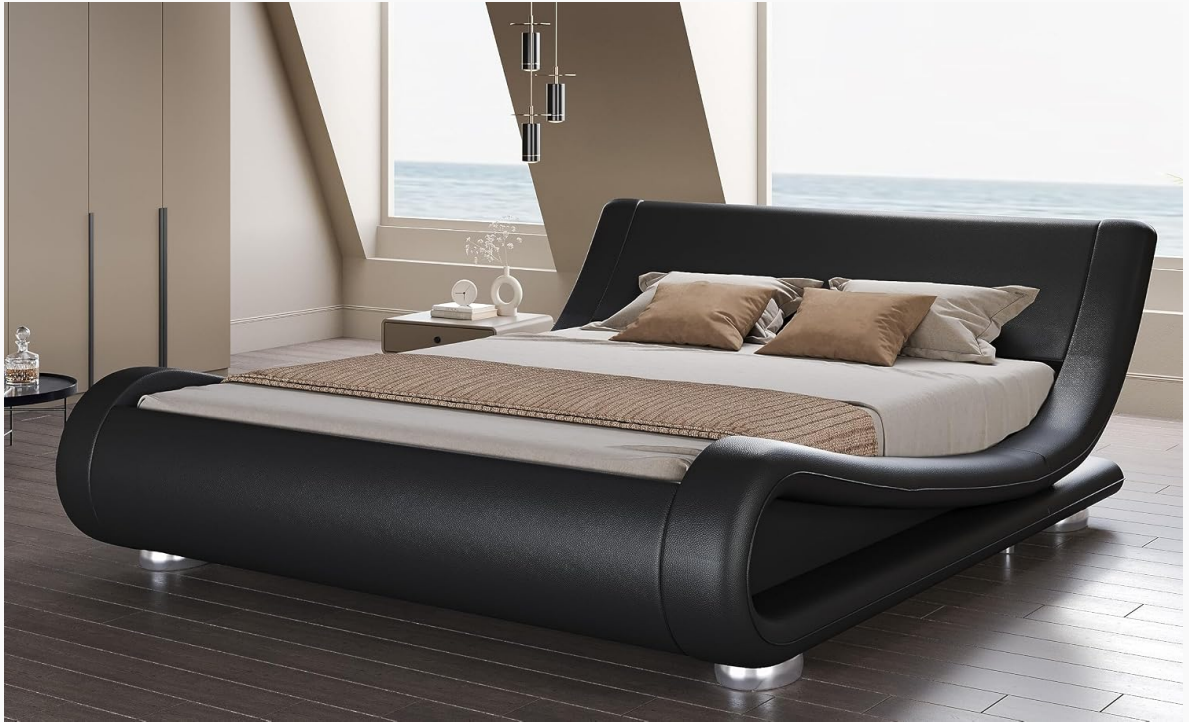
Image Description: This image shows the SHA CERLIN Full Size Upholstered Bed Frame in a black faux leather finish, positioned in a modern bedroom with large windows. The bed features a low-profile sleigh design with a curved headboard and footboard.