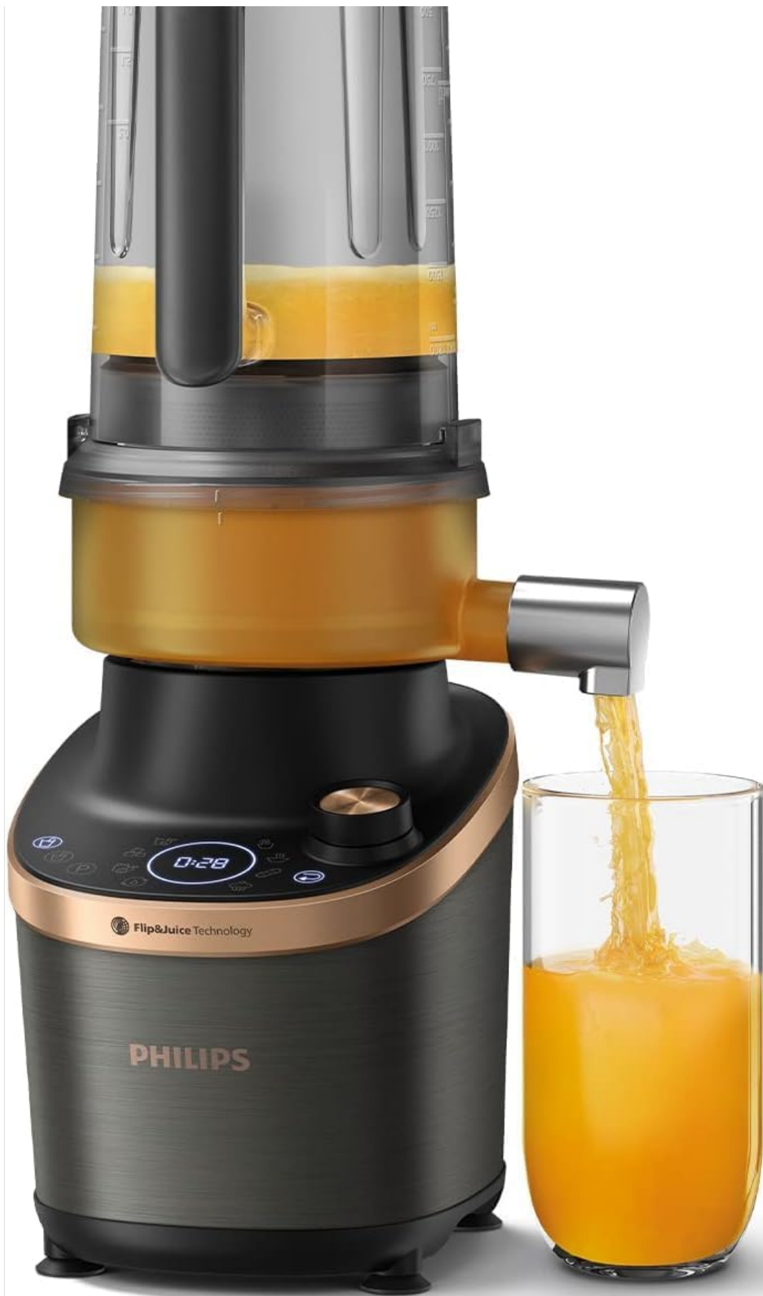
Image 4.2: The Philips Flip&Juice High-Speed Mixer is shown in operation, with the blender jug inverted and attached to the juicer component, actively dispensing fresh orange juice into a glass.