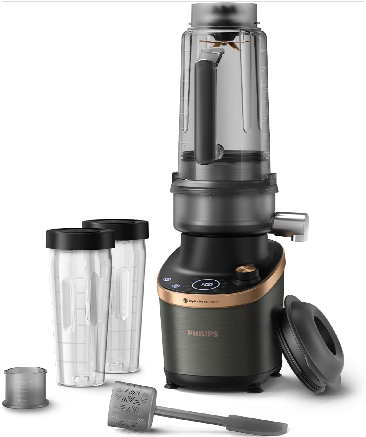
Image 3.1: The Philips Flip&Juice High-Speed Mixer shown with its main unit, blender jug, juicer attachment, two portable cups, and a tamper tool.