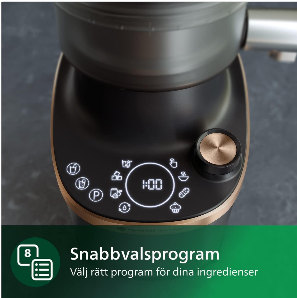
Image 5.1: A close-up of the Philips Flip&Juice mixer's control panel, displaying various quick selection program icons around a central digital timer, indicating ease of use for different preparations.

Once assembled, plug the appliance into a power outlet. The control panel will illuminate.