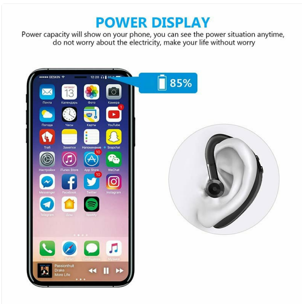
Figure 4: The power display feature, showing how the headset's battery level can be viewed on a connected smartphone.