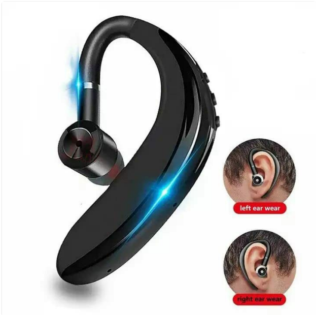
Figure 2: Illustration demonstrating how the S109 headset can be worn on both the left and right ear, highlighting its versatile design.