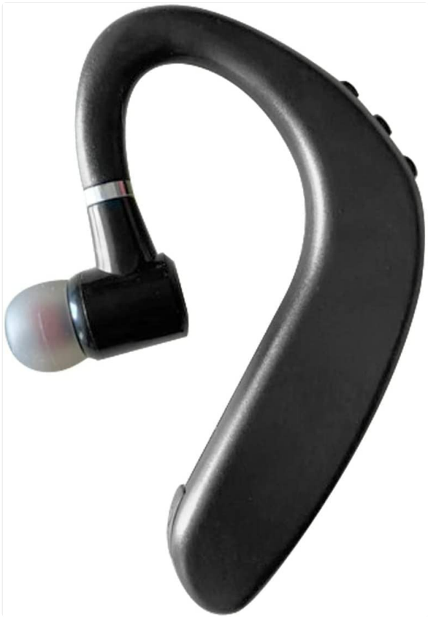
Figure 1: Front view of the ASTOUND S109 Wireless Bluetooth Headset, showcasing its sleek black design and ear hook.