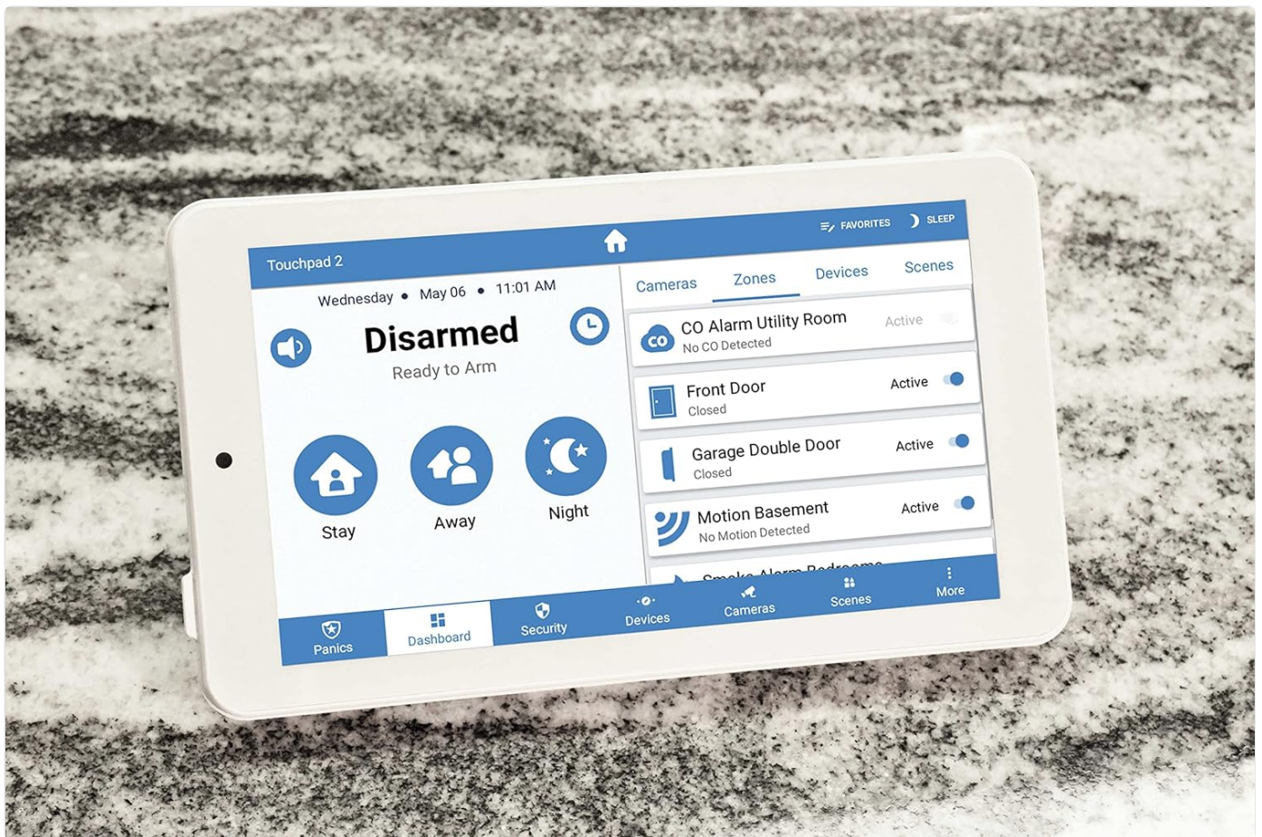
Figure 2: Touchpad in tabletop configuration, showing device and zone management.