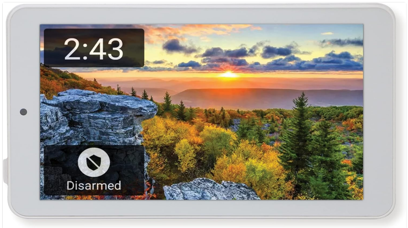
Figure 3: Touchpad displaying a scenic background in disarmed state.