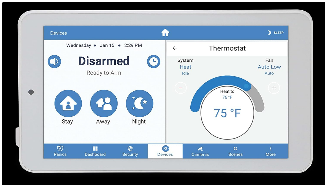
Figure 1: Alula Slimline Touchpad Pro main interface.

The Alula Slimline Touchpad PRO provides modern and intuitive control for your smart security system. Featuring a 7-inch full-color touchscreen, this device can be wall-mounted or placed on a tabletop, offering complete control of your security system from anywhere within your premises. It allows you to arm and disarm the system, view cameras, control smart devices, and initiate scenes. Its interface mirrors the Alula Smart Security app, ensuring ease of use and a familiar experience.