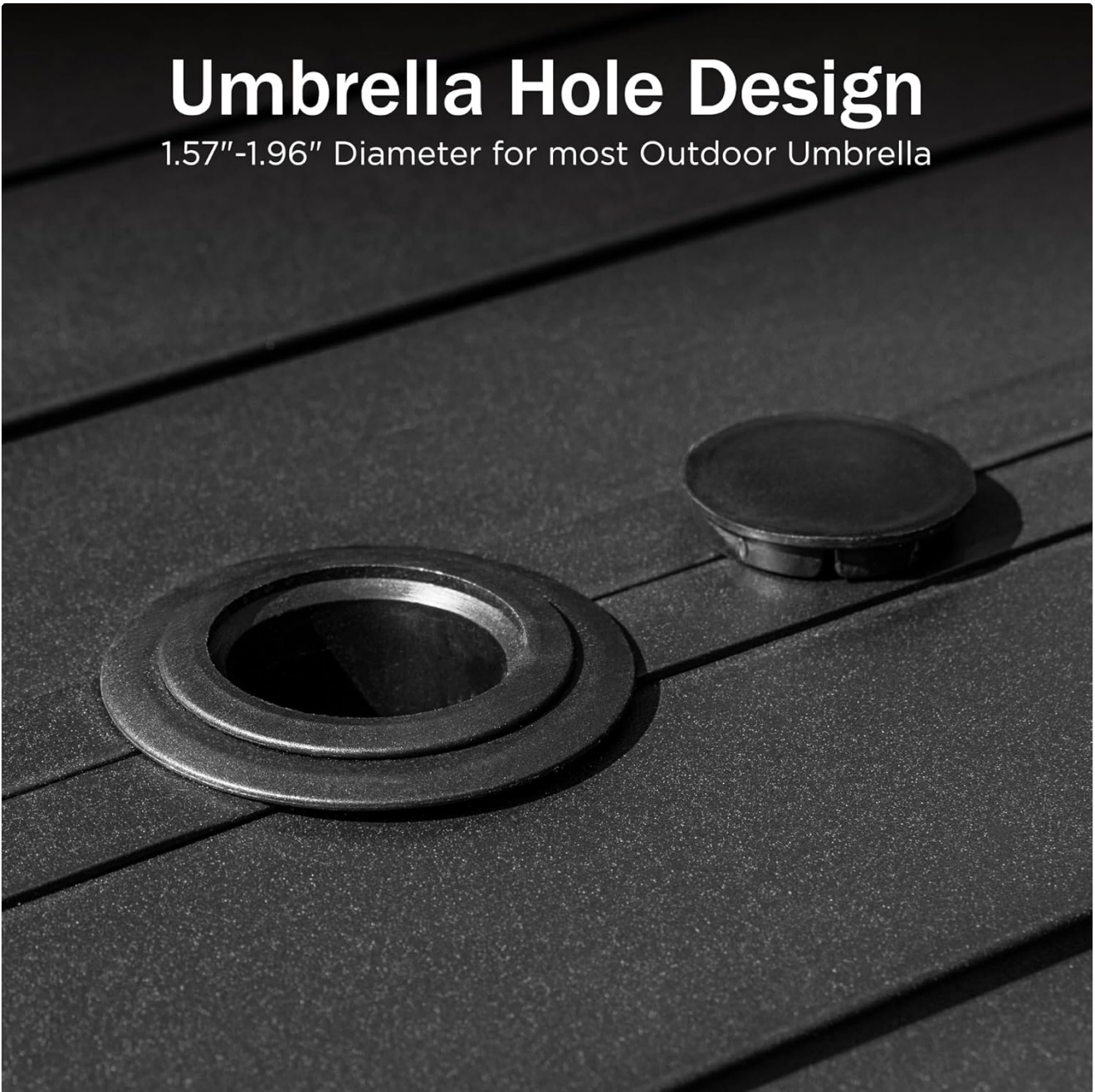
Figure 3: Umbrella Hole Design

1.57"-1.96" Diameter for most Outdoor Umbrella