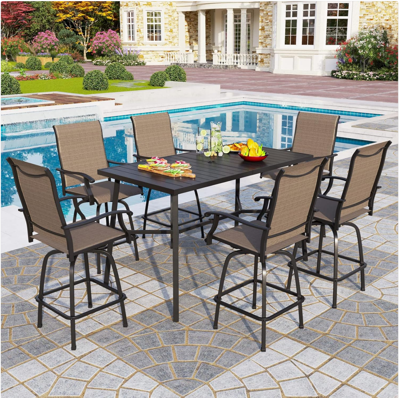
Figure 4: Example Outdoor Setup

This image demonstrates the PHI VILLA patio table in an outdoor setting next to a pool, surrounded by six bar-height chairs, illustrating its intended use for gatherings and dining.