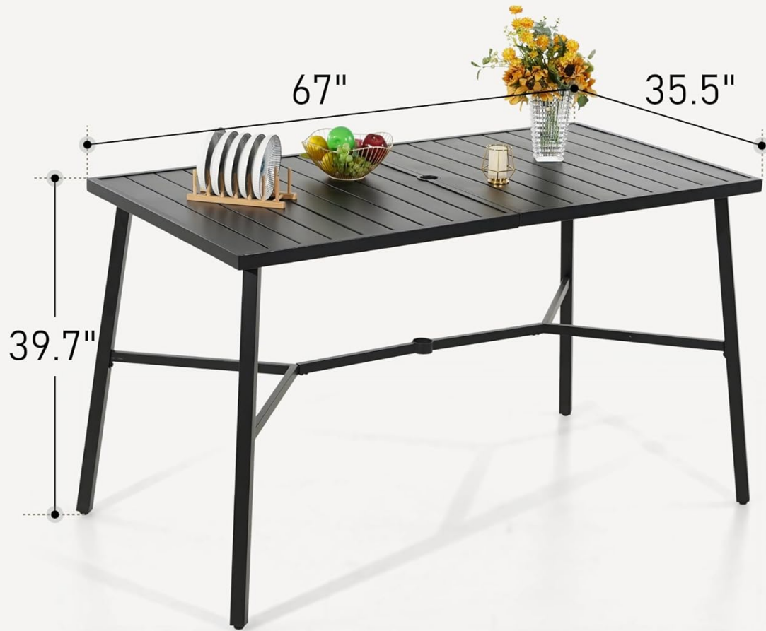
Figure 2: Table Dimensions and Assembly Overview

This image illustrates the overall dimensions of the patio bar table (67" L x 35.5" W x 39.7" H), providing a visual guide for assembly and placement. It highlights the general structure of the table, including the legs and cross-bracing.