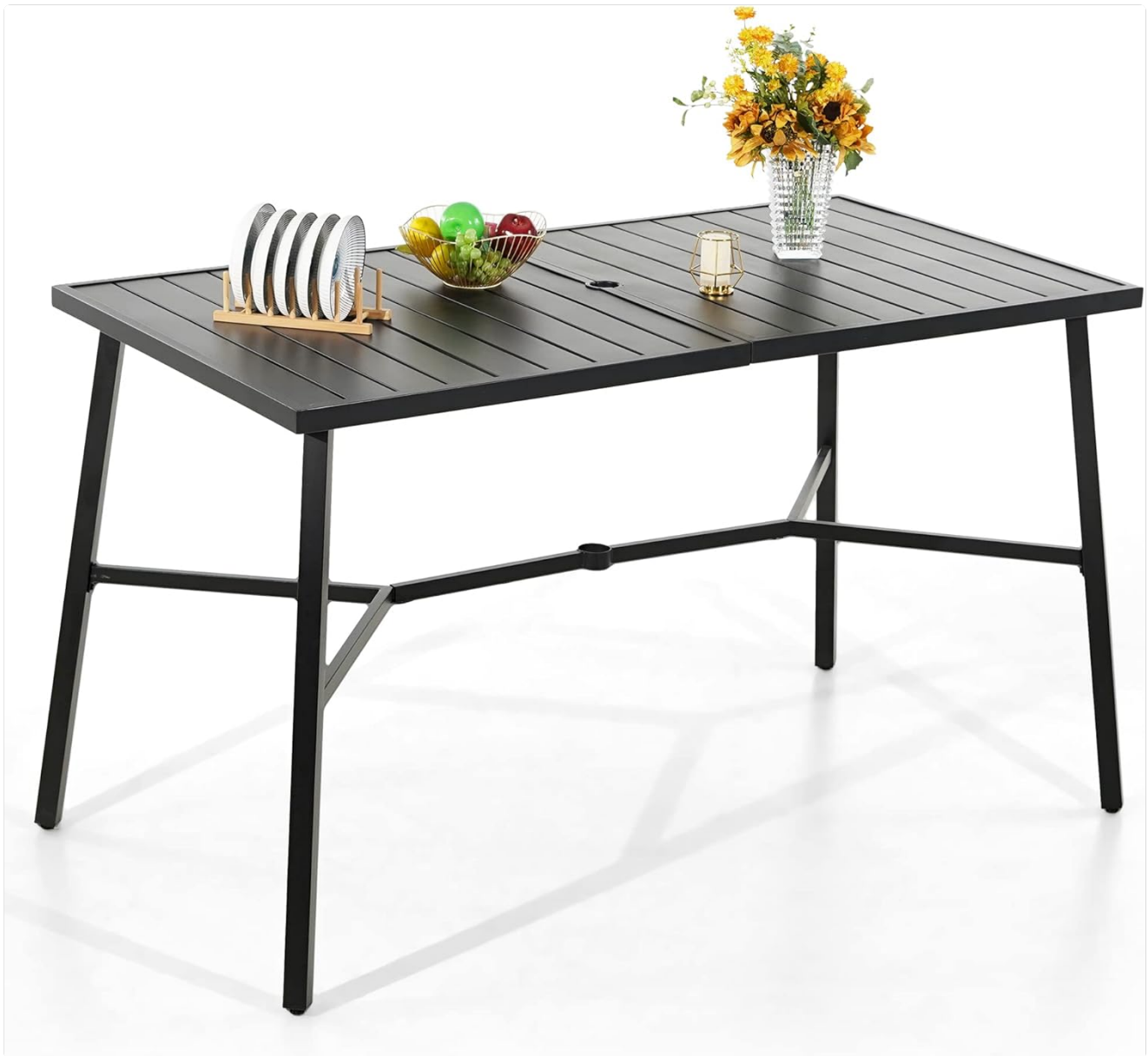
Figure 1: PHI VILLA Outdoor Patio Bar Dining Table (Set for 6, Black)

This image displays the complete PHI VILLA Outdoor Patio Bar Dining Table, showcasing its black finish and rectangular design, suitable for accommodating six individuals. The table features a central umbrella hole and sturdy metal legs with cross-bracing for stability.