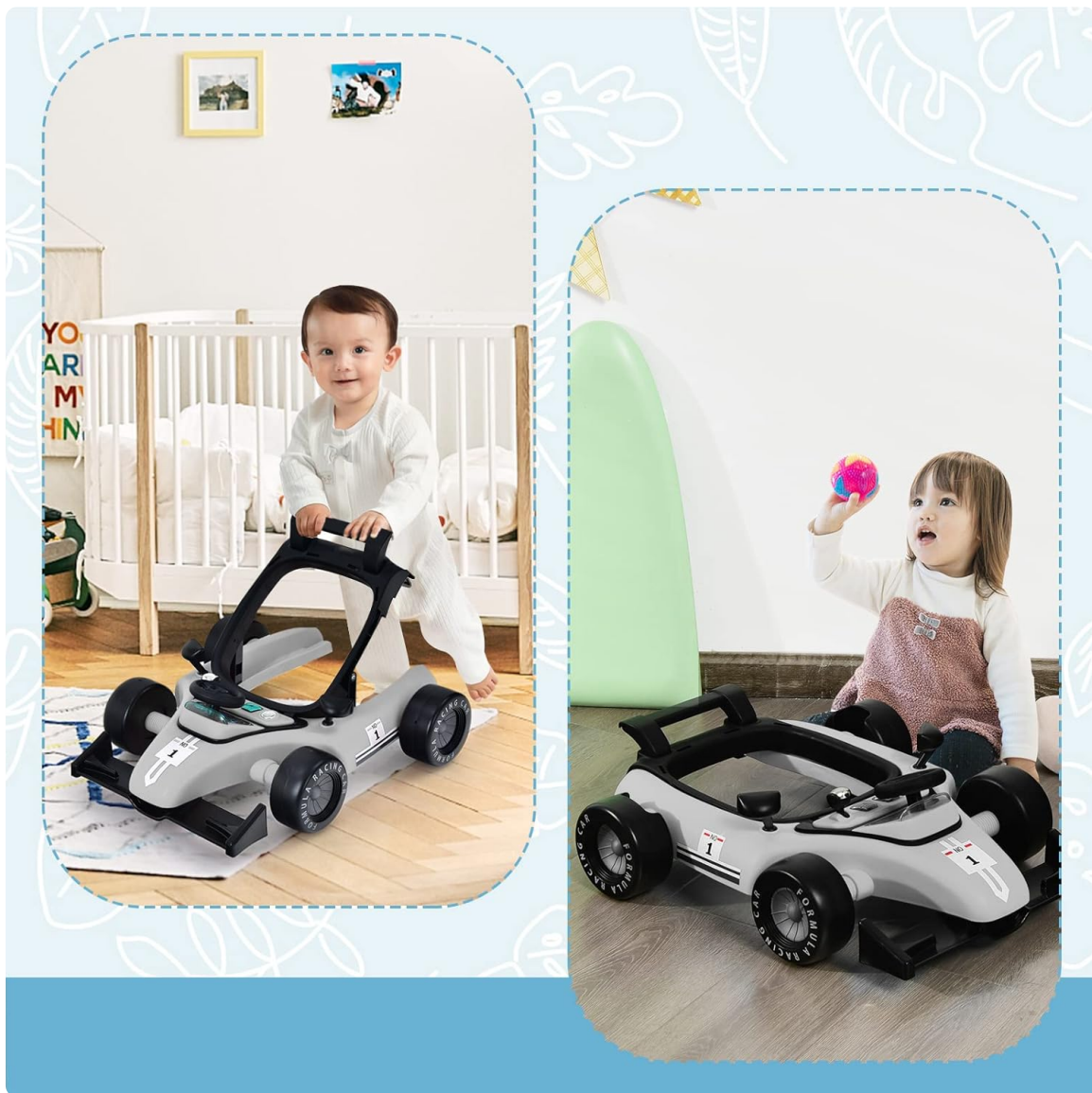
Two children are shown interacting with the walker, one using it as a push-behind aid for walking practice, and another sitting on it in the ride-on car mode.