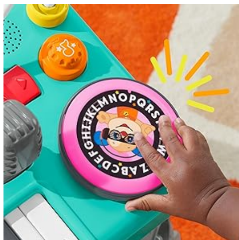
Image 6: A close-up of the interactive DJ turntable with alphabet details.