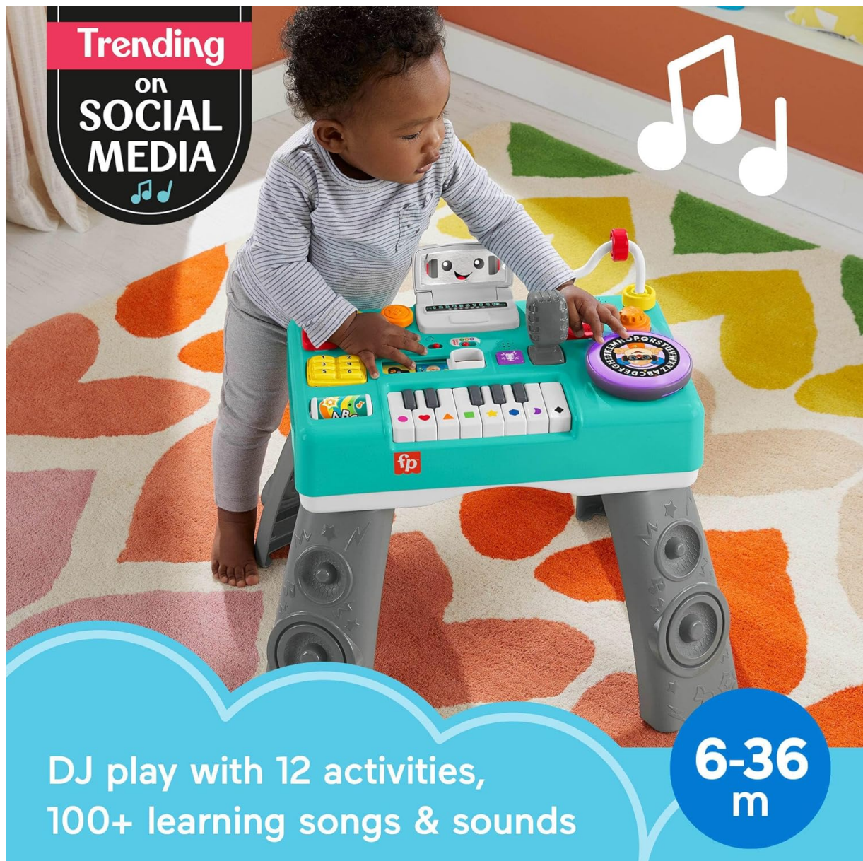
Image 4: A baby interacting with the DJ table while standing, demonstrating the leg attachment.