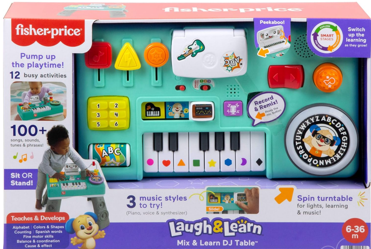
Image 2: The Fisher-Price Laugh & Learn Mix & Learn DJ Table as it appears in its retail packaging.