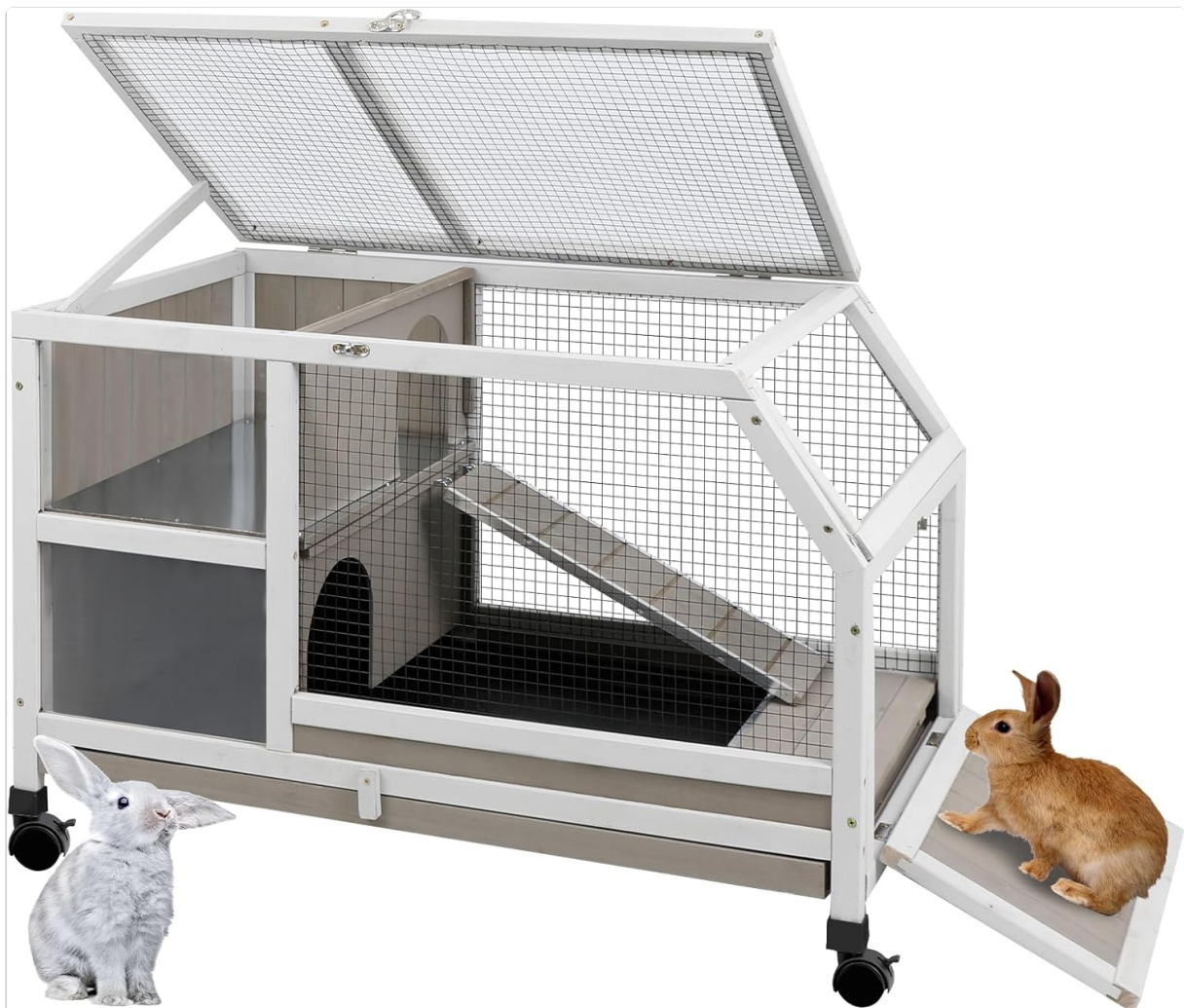
Figure 4.1: Fully assembled Kative RAB08 Indoor Rabbit Hutch.

Video 4.2: Assembly demonstration for a similar bunny cage, illustrating panel and connector installation. This video is