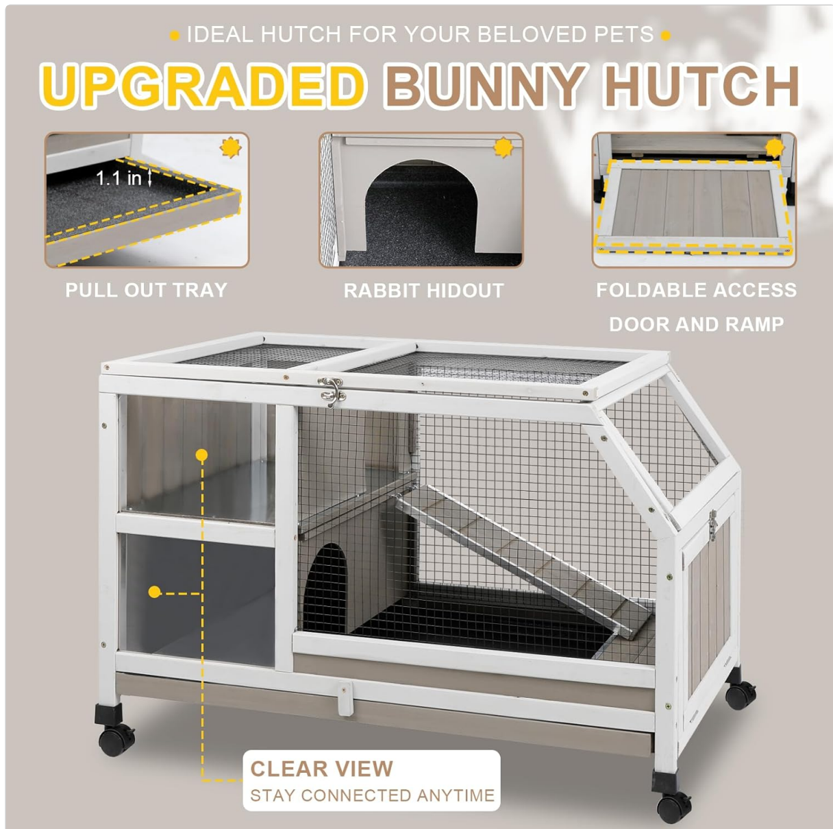
Figure 5.1: Overview of the hutch's features including access points and internal structure.