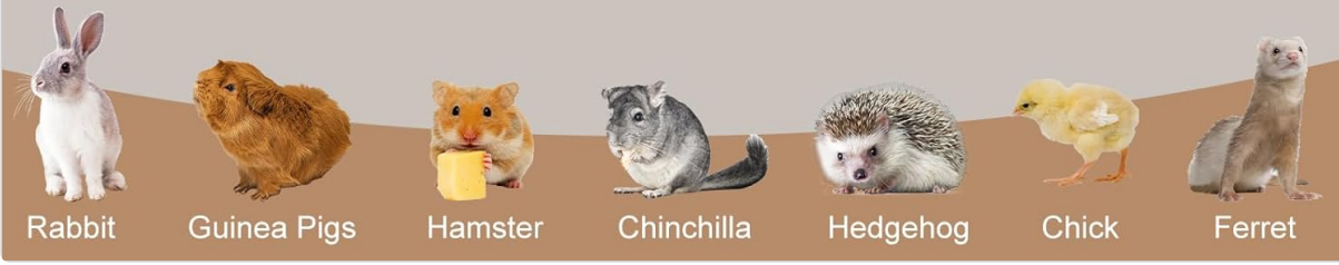
Figure 8.1: Detailed dimensions and examples of suitable small animals for the hutch.