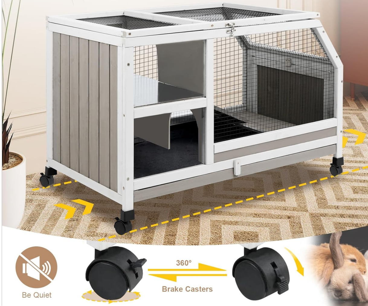
Figure 5.3: Lockable caster wheels provide mobility and stability.

Video 5.4: A short demonstration of the rabbit hutch with casters, showing its mobility. This video is provided by AIVITUVIN PETS.