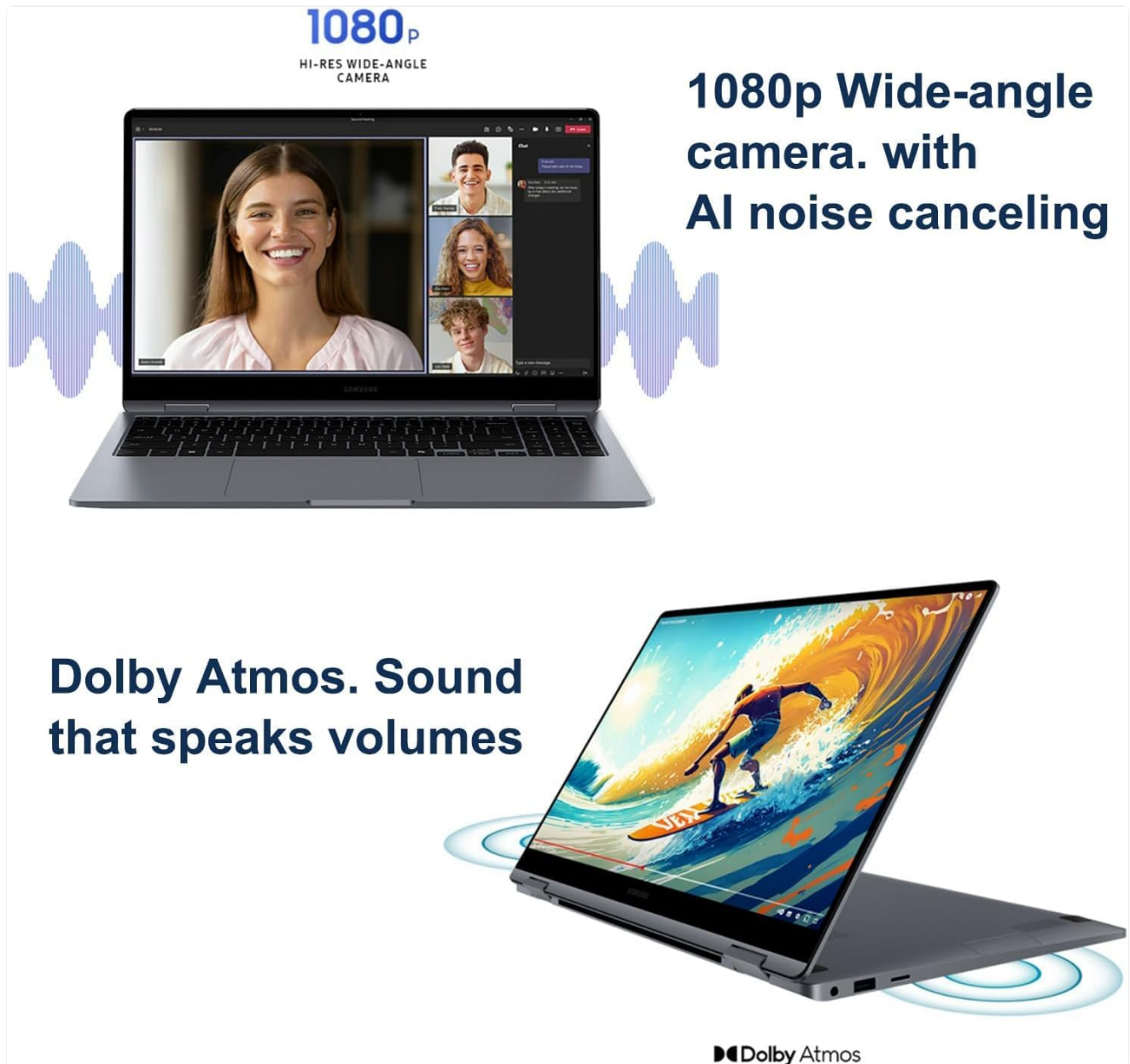
Image 3.2: The 1080p wide-angle camera with AI noise canceling ensures clear communication, complemented by Dolby Atmos sound.

The laptop features a 1080p FHD webcam with AI noise canceling for clear video calls. Dolby Atmos technology enhances the audio experience.