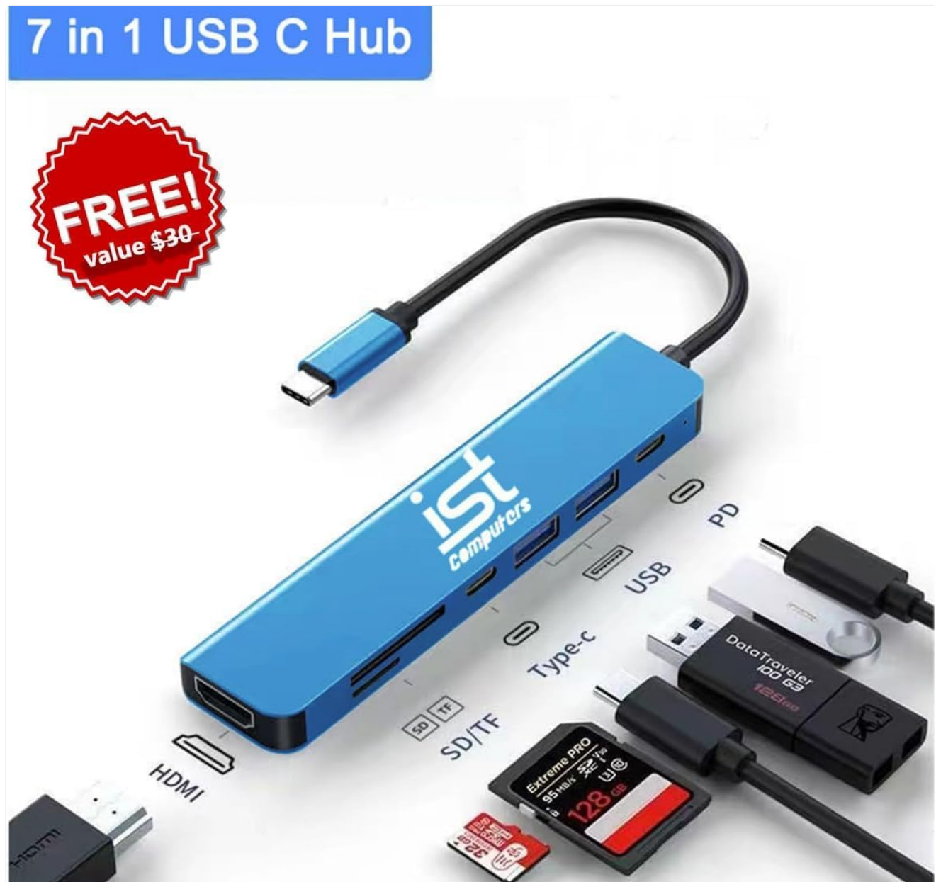
Image 2.1: The 7-in-1 USB-C Hub provides additional connectivity options for the laptop, including HDMI, USB, and memory card slots.

Utilize the available ports to connect external devices such as a mouse, keyboard, or external display. The included USB-C hub expands connectivity options.