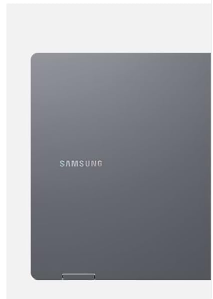
Image 6.1: The Galaxy Book4 360 is designed to be light and thin, making it highly portable.