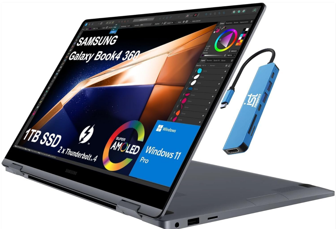
Image 1.1: The Samsung Galaxy Book4 360 laptop with an external USB-C hub. The laptop is shown in a partially folded position, highlighting

The Samsung Galaxy Book4 360 is a versatile 2-in-1 laptop designed for flexibility and performance. It features a 15.6-inch FHD AMOLED touchscreen, an Intel Core 5 120U processor, 16GB DDR5 RAM, and a 1TB PCIe NVMe M.2 SSD. This device supports multiple modes of use, including laptop, tent, stand, and tablet, adapting to various tasks and environments. It comes with Windows 11 Pro and integrated AI capabilities.