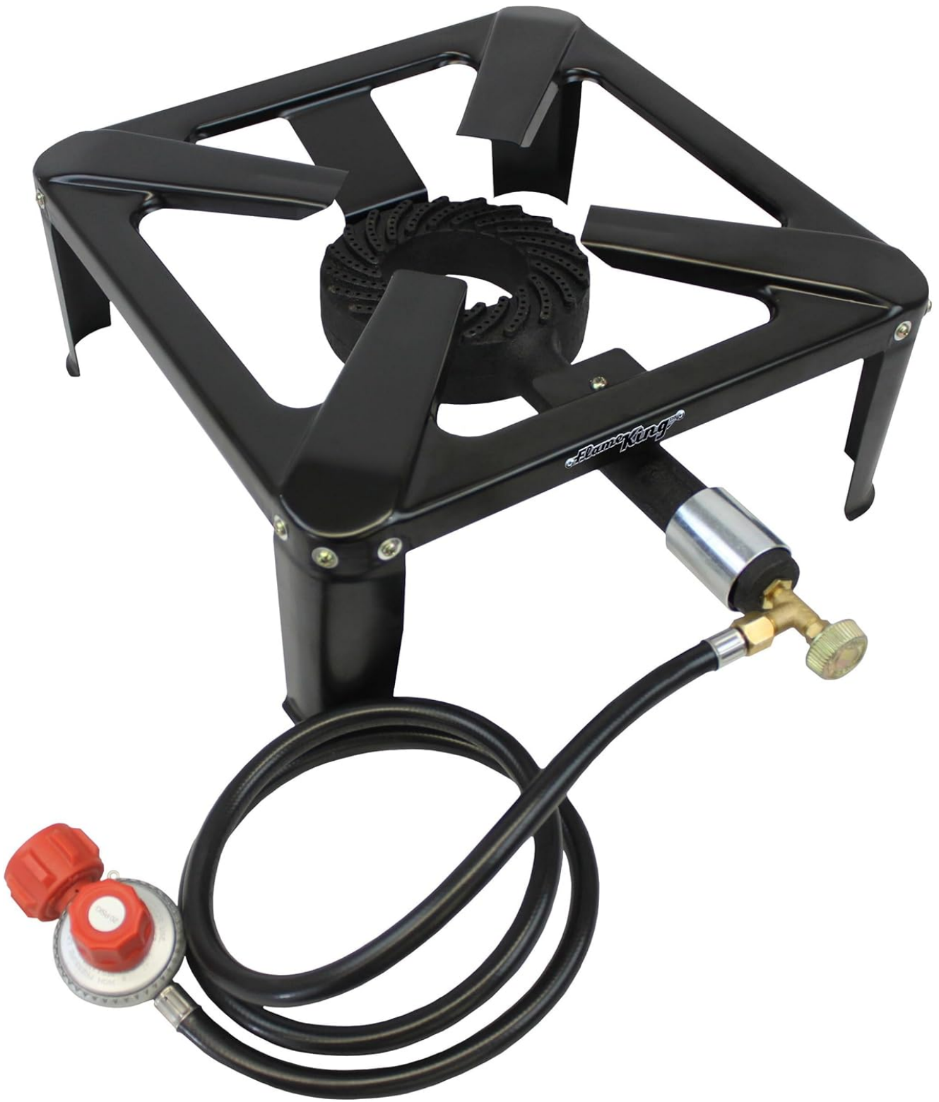
Image: The Flame King Heavy Duty 120,000 BTU Propane Burner, showcasing its sturdy black frame and integrated hose with regulator.