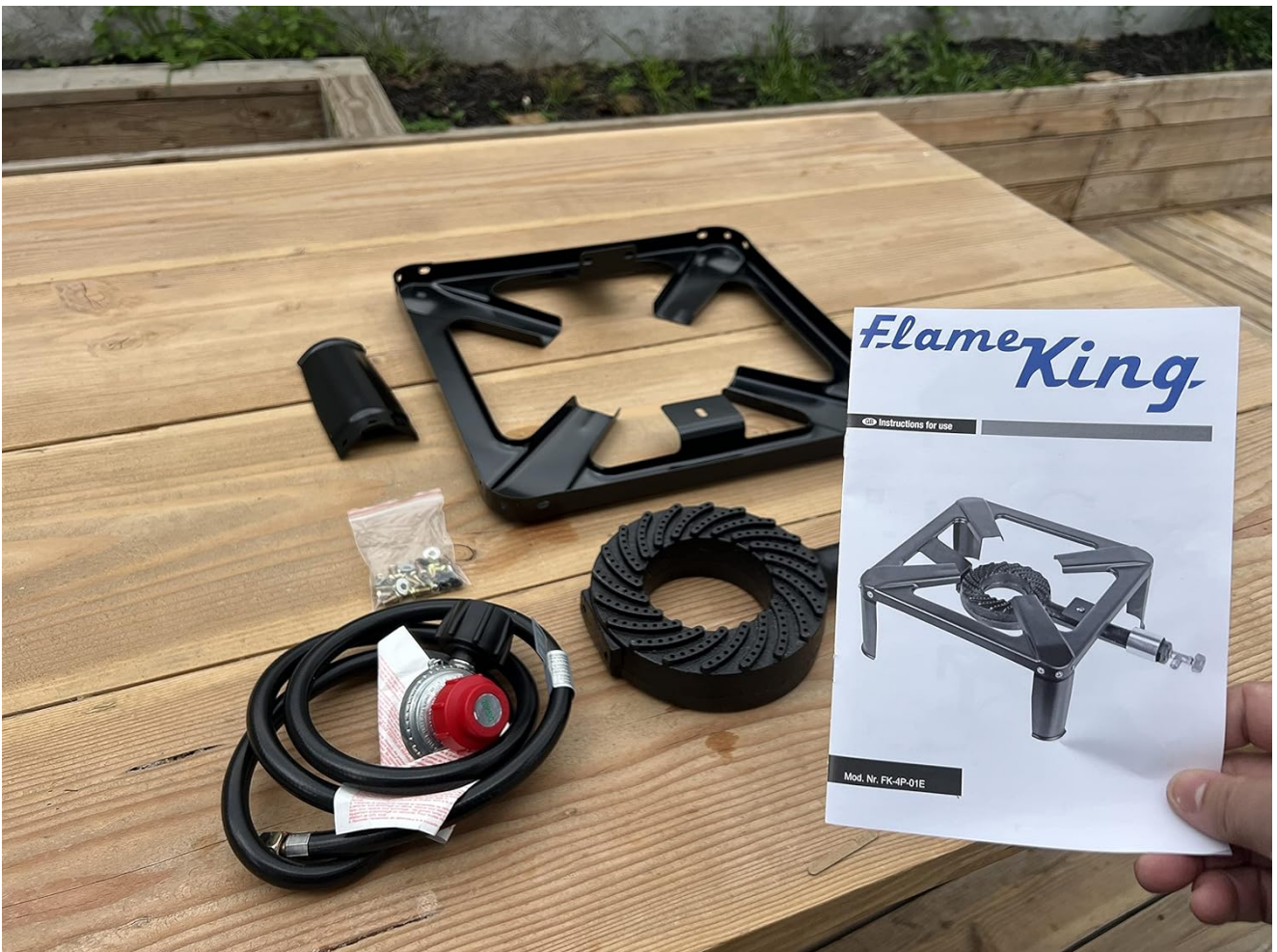
Image: All components of the Flame King Propane Burner laid out, including the frame, burner head, hose with regulator, and instruction manual.