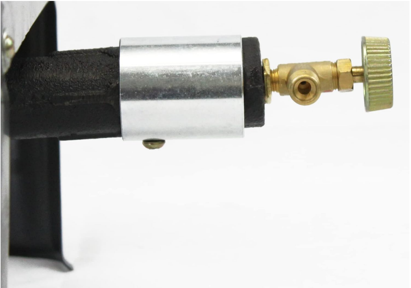
Image: Close-up view of the regulator connecting to the burner's gas inlet, showing the secure attachment point.