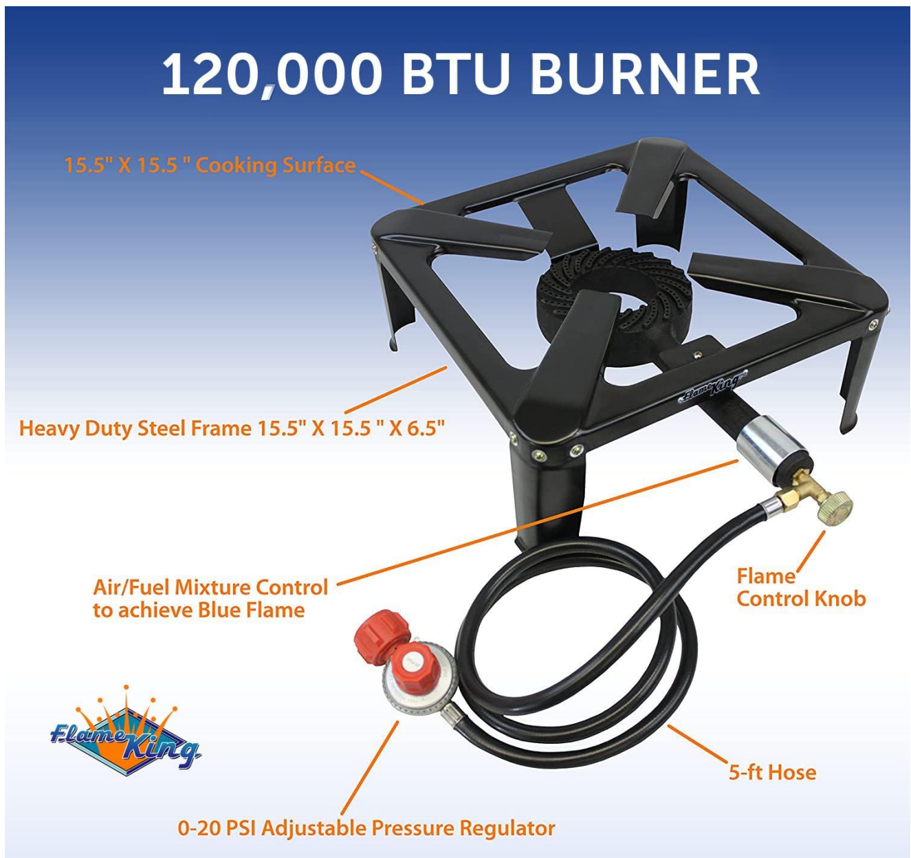
Image: A detailed diagram illustrating the components and assembly points of the Flame King Propane Burner, including the flame control knob, air/fuel mixture control, and 0-20 PSI adjustable pressure regulator.