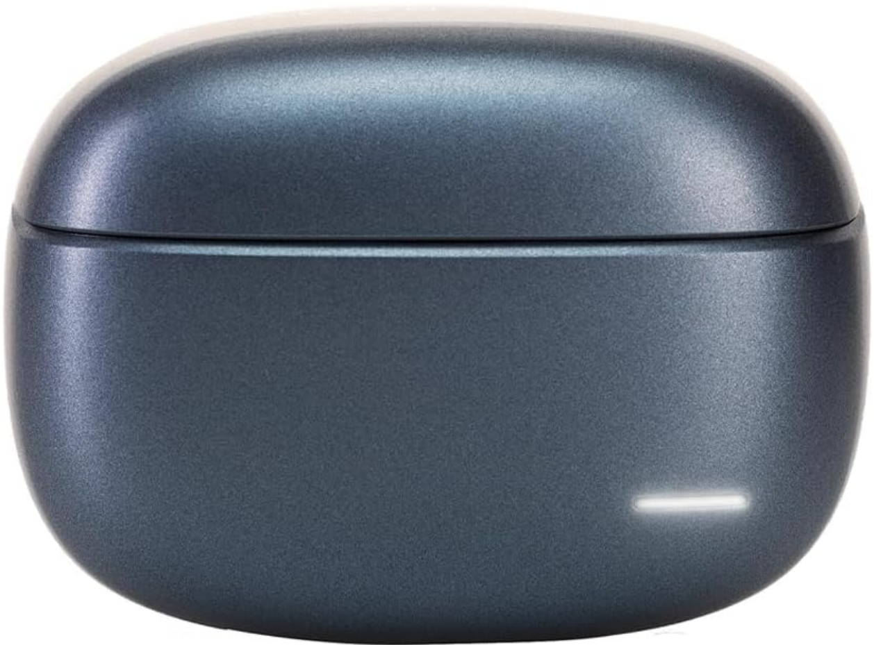
Figure 3.1: The AlienCraft DROID66 charging case, showing the indicator light on the front.