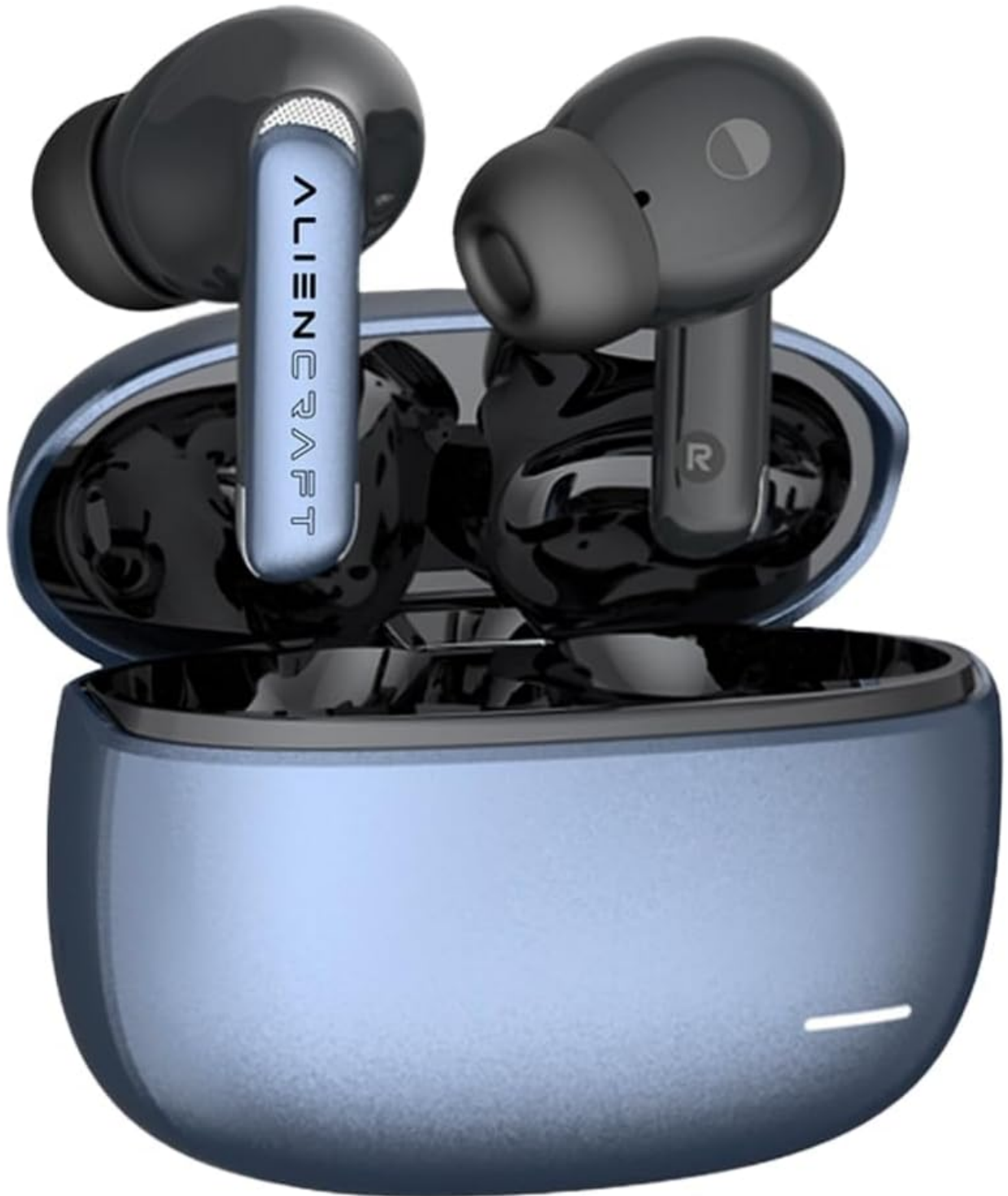
Figure 2.1: AlienCraft DROID66 Earbuds in their charging case. The earbuds are black with a metallic blue stem, and the case is a matching Nubian Gray/blue color.