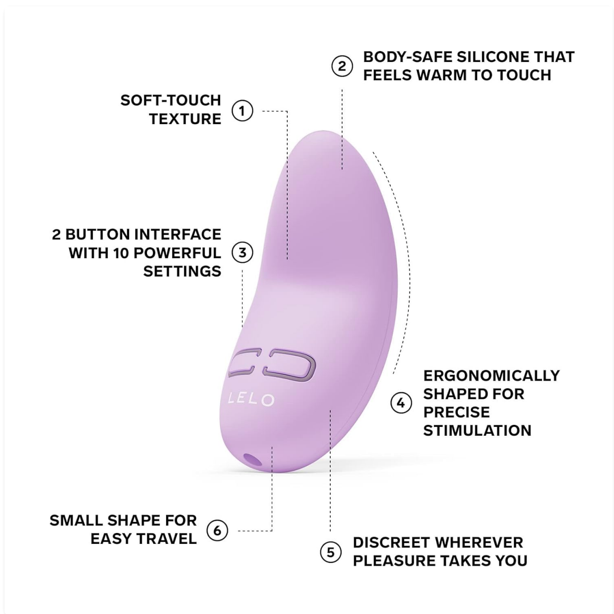
Image: Key features of the LELO Lily 3 massager.