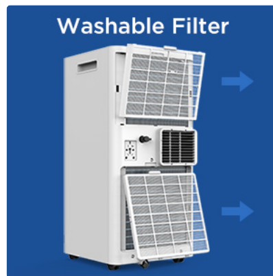
Figure 12: Washable Filter Removal