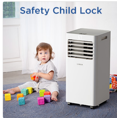
Figure 4: Safety Child Lock Feature