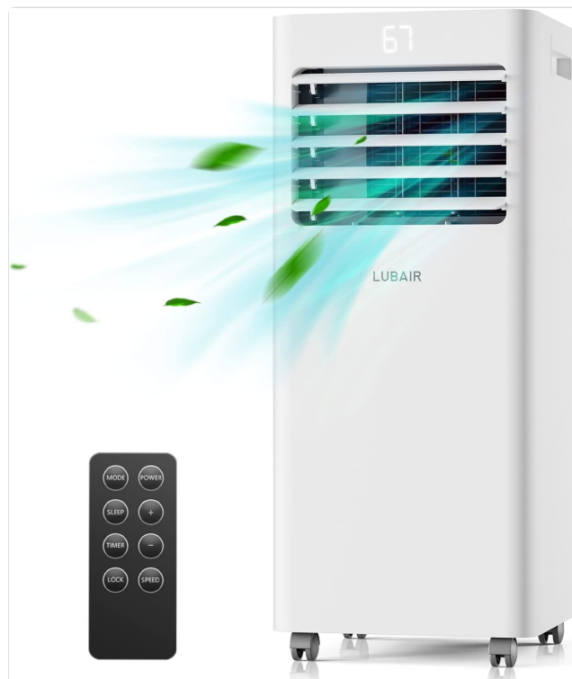
Figure 1: LUBAIR Portable Air Conditioner Unit

Thank you for choosing the LUBAIR 8,000 BTU Portable Air Conditioner. This versatile 3-in-1 unit provides powerful cooling, effective dehumidification, and efficient air circulation as a fan, designed to keep your space comfortable. Its portable design with built-in wheels and handles allows for easy movement between rooms, making it ideal for areas up to 300 sq.ft. Please read this manual thoroughly before operation to ensure proper use, maintenance, and safety.