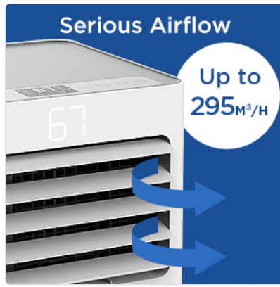
Figure 9: Airflow Capacity