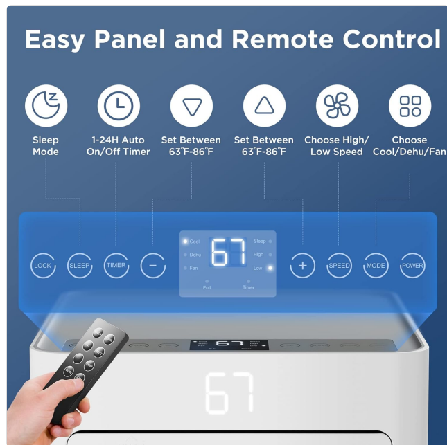
Figure 7: Easy Panel and Remote Control Overview

Video 3: Demonstrates the functions of the portable air conditioner's display and controls, including mode selection, speed, timer, and sleep mode.