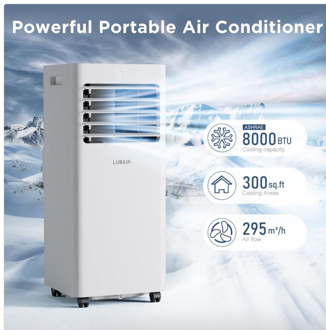
Figure 2: Key Performance Metrics of the Portable AC