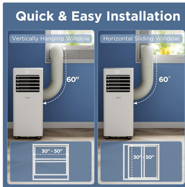
Figure 6: Quick and Easy Installation Guide for Window Kit

Video 2: Step-by-step guide on how to set up the air conditioner with the window kit.