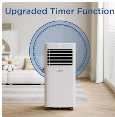
Figure 10: Upgraded Timer Function

The 24-hour on/off timer allows you to pre-set the unit to turn on or off at specific times, optimizing energy usage and convenience.