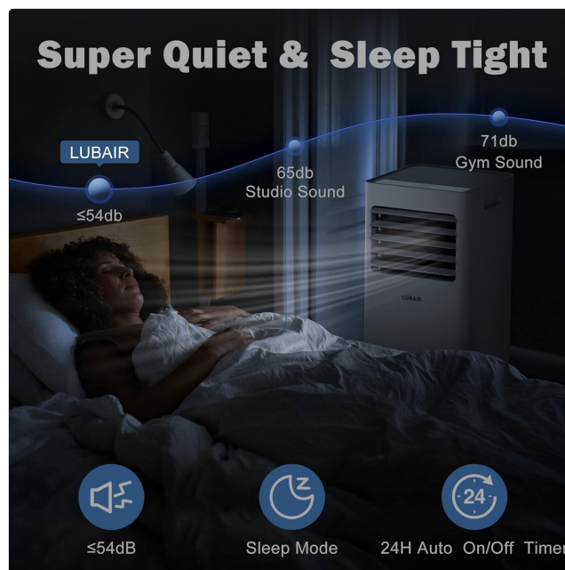
Figure 11: Low Noise and Sleep Mode Benefits

Activate Sleep Mode for quiet operation ( \leq 54\text{dB} ) and a comfortable environment during the night, ensuring undisturbed rest.