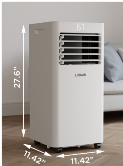
Figure 14: Product Dimensions