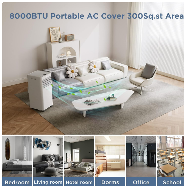
Figure 3: Versatile Application of the Portable AC in Different Spaces