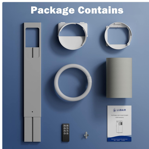
Figure 5: Package Contents