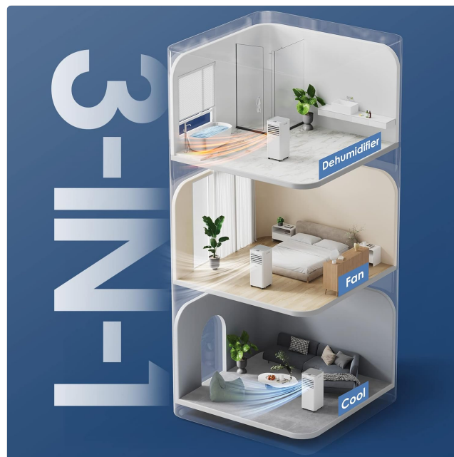
Figure 8: Understanding the 3-in-1 Functions