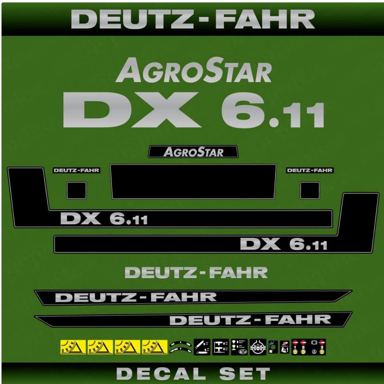
Image 1: Complete Deutz Fahr Agrostar DX 6.11 Tractor Aftermarket Decal Set. This image displays all the individual decals included in the set, showcasing their design and layout.