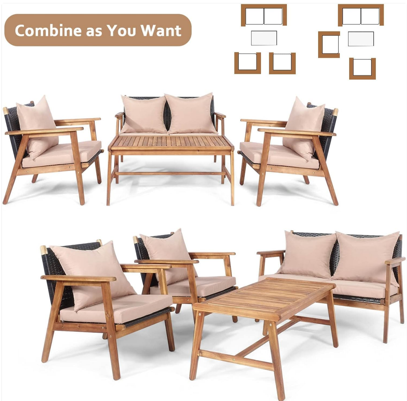
Image: An illustration demonstrating different ways the furniture pieces (single chairs, loveseats, and coffee tables) can be combined and arranged to fit various outdoor spaces.