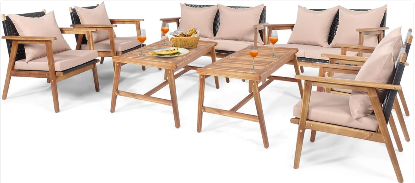
Image: The complete 8-piece RELAX4LIFE outdoor patio furniture set, featuring two loveseats, two single chairs, and two coffee tables, arranged for outdoor use.

This manual provides essential instructions for the assembly, operation, and maintenance of your RELAX4LIFE 8-Piece Outdoor Patio Furniture Set. Please read this manual thoroughly before assembly and use to ensure proper function and longevity of your furniture.