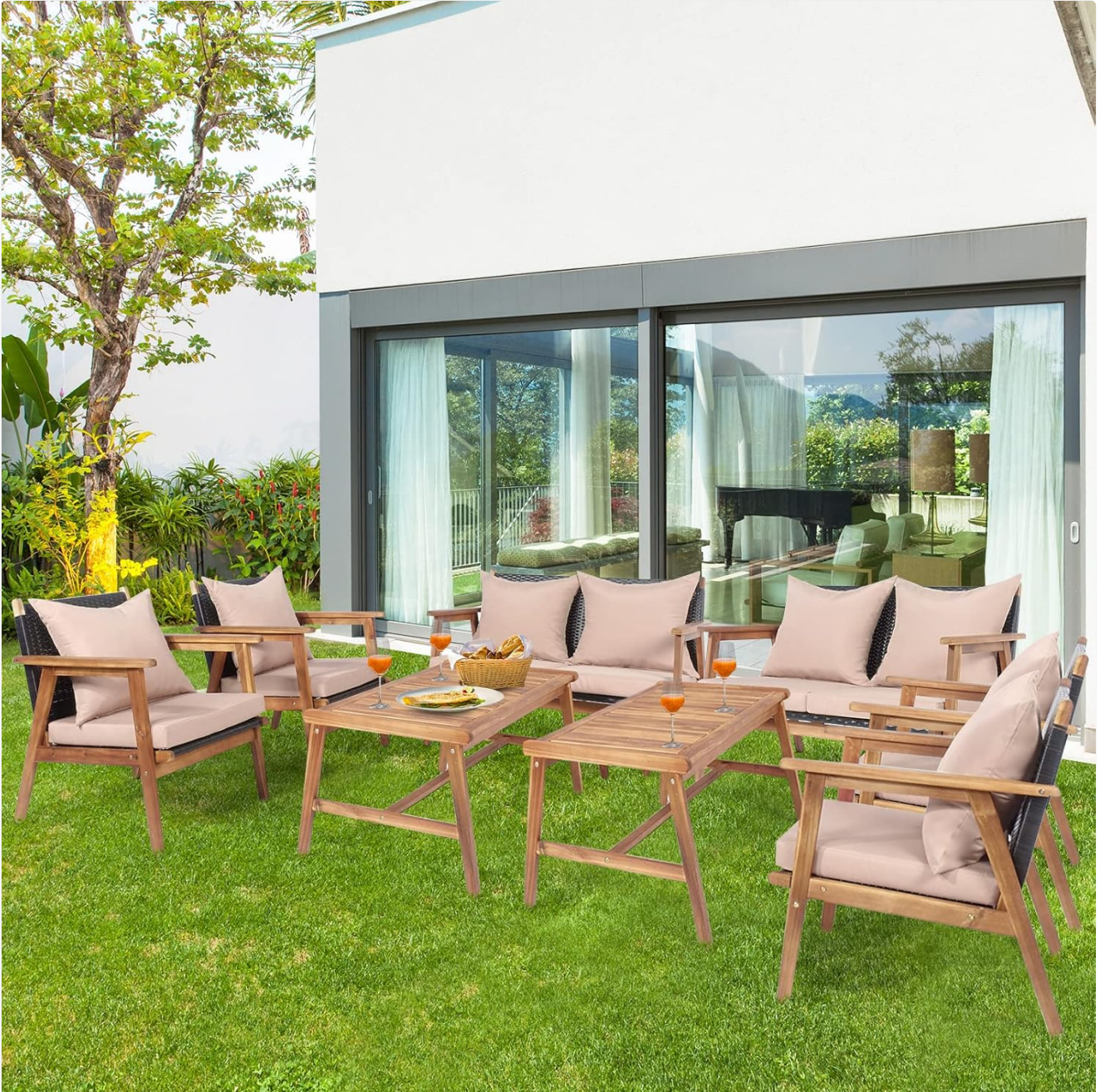
Image: The 8-piece patio furniture set arranged on a green lawn in front of a modern house with large glass doors, showcasing its suitability for backyard settings.