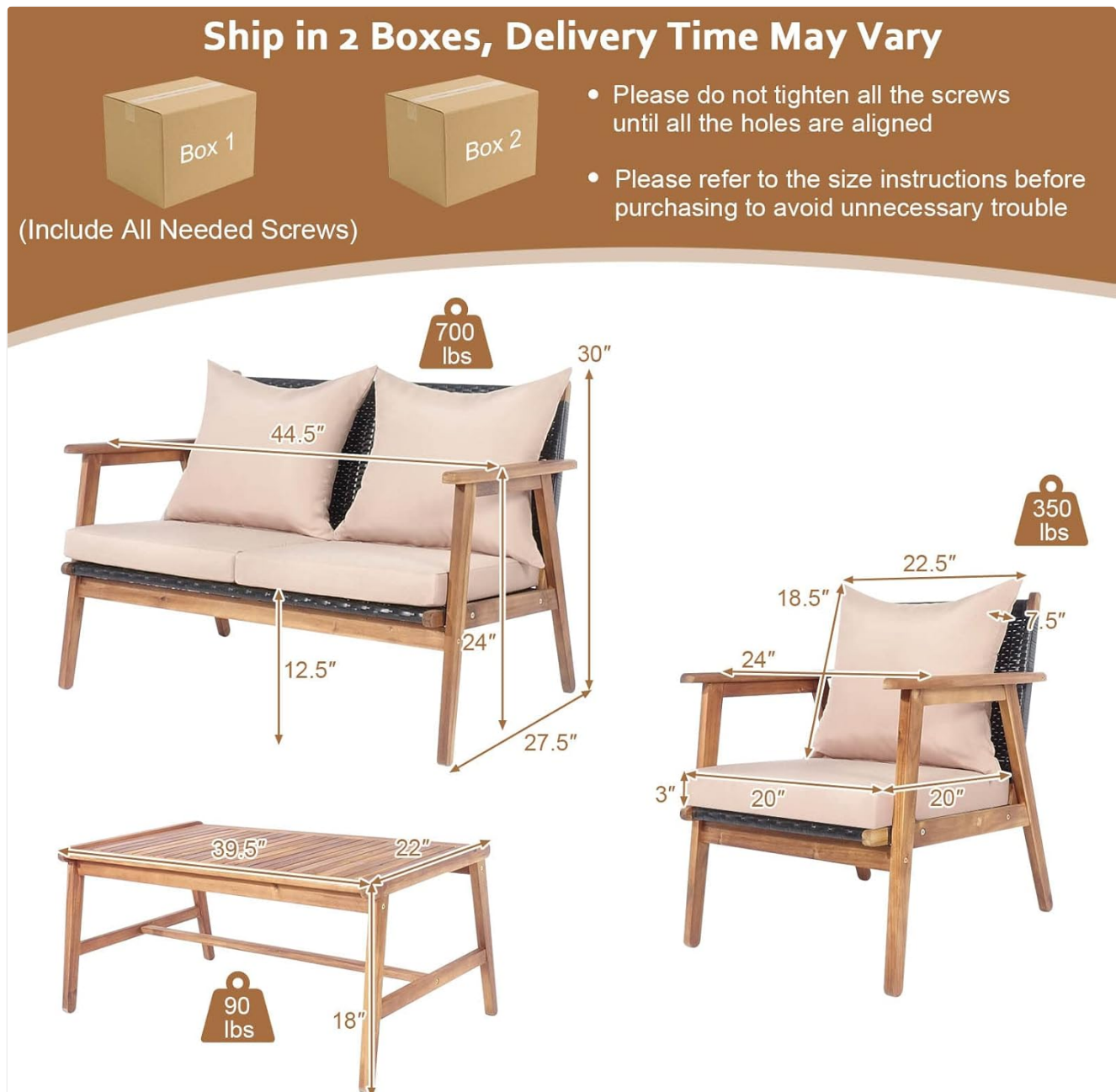
Image: A diagram illustrating the dimensions of the loveseat, single chair, and coffee table, along with their respective weight capacities. It also indicates that the set ships in multiple boxes, with the screw bag in Box 1.