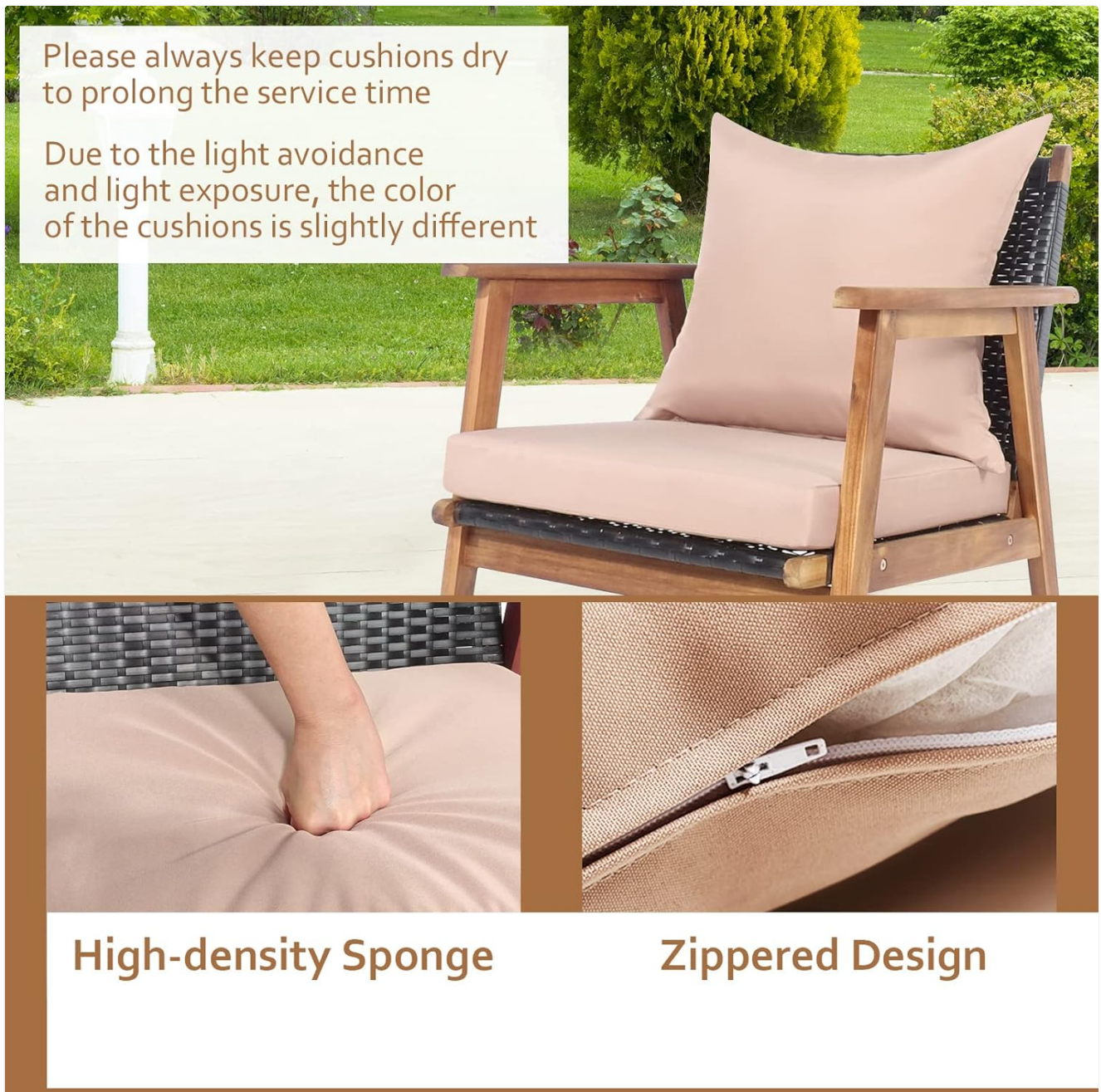
Image: A close-up view highlighting the high-density sponge filling of the cushions and the zippered design for easy cover removal and maintenance. A note advises keeping cushions dry and mentions potential color variation due to light exposure.

• General Protection: Consider using furniture covers when the set is not in use for extended periods to protect it from sun, rain, and dust.