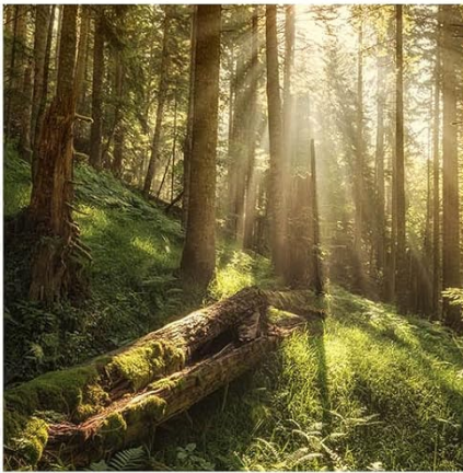
Gift from Nature

Make the Overall Frame More Stable Add a Rustic Addition to Your Outdoors