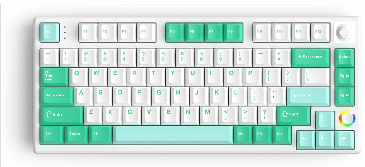
Image: Top-down view of the KEYMECHER KS75T 75% Mechanical Keyboard, highlighting its compact layout and key arrangement.

The KS75T is a 75% layout keyboard with 85 keys, providing essential keys like Page Up, Page Down, Delete, Insert, Home, Print, Pause, and dedicated arrow keys. It features NKRO anti-ghosting for accurate simultaneous key presses.