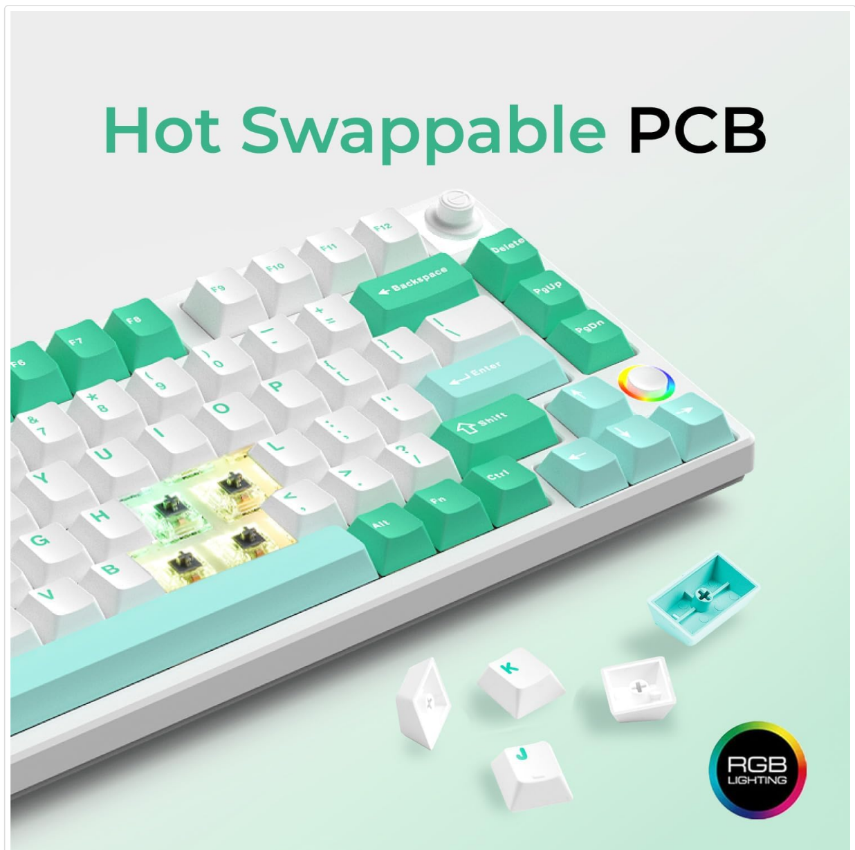
Image: The KEYMECHER KS75T keyboard with keycaps and switches removed, demonstrating its hot-swappable feature.