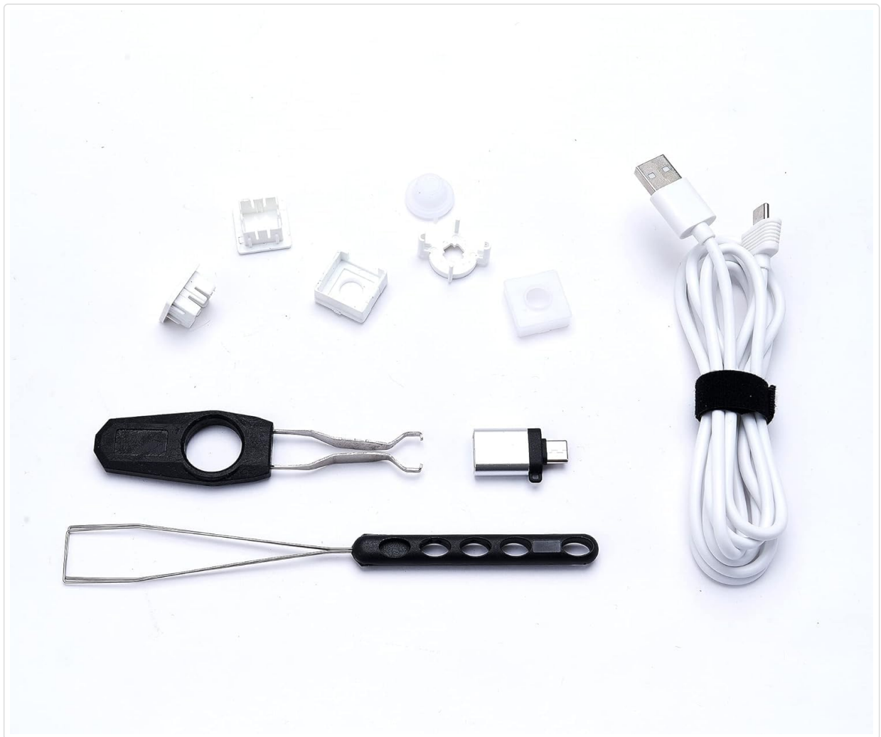
Image: Contents of the KEYMECHER KS75T package, including the keyboard, cables, and tools.