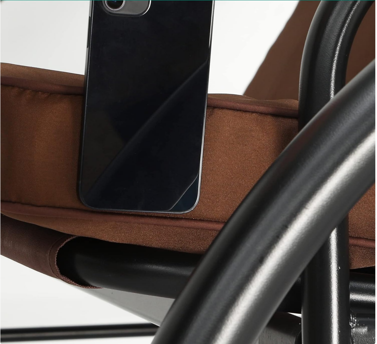
Image: Illustration of the durable steel stand construction.