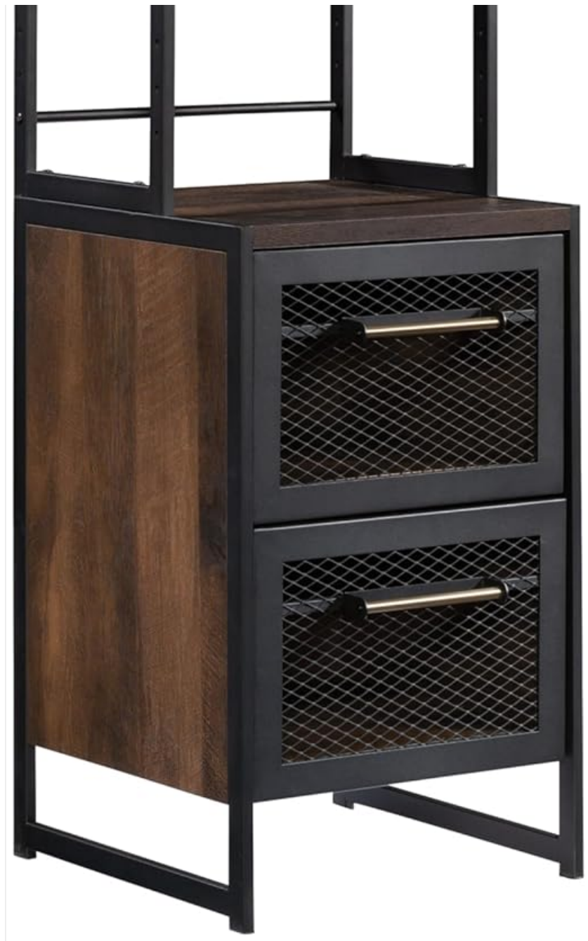
Image: The Sauder Briarbrook Tall Narrow Bookcase, showcasing its design with open shelving and two lower drawers, finished in Barrel Oak.