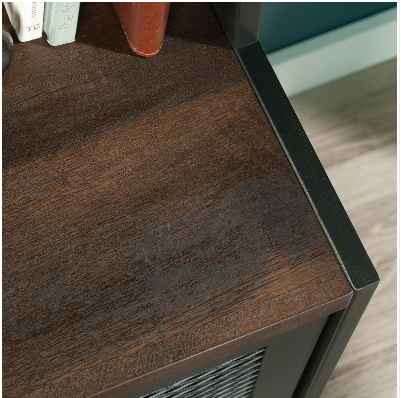
Image: A close-up view of the Barrel Oak finish, highlighting the texture and color of the bookcase surface.