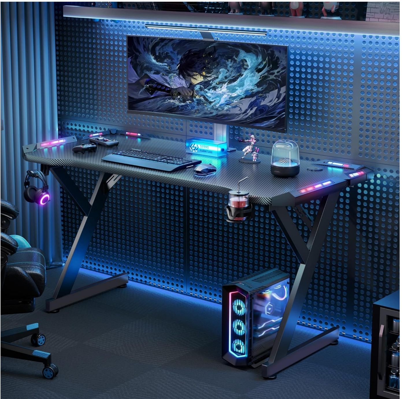
Image 1.1: The HLDIRECT 55 Inch Gaming Desk with LED Lights, showcasing a complete gaming setup with a monitor, keyboard, mouse, and PC tower, all illuminated by the desk's integrated LED lights.