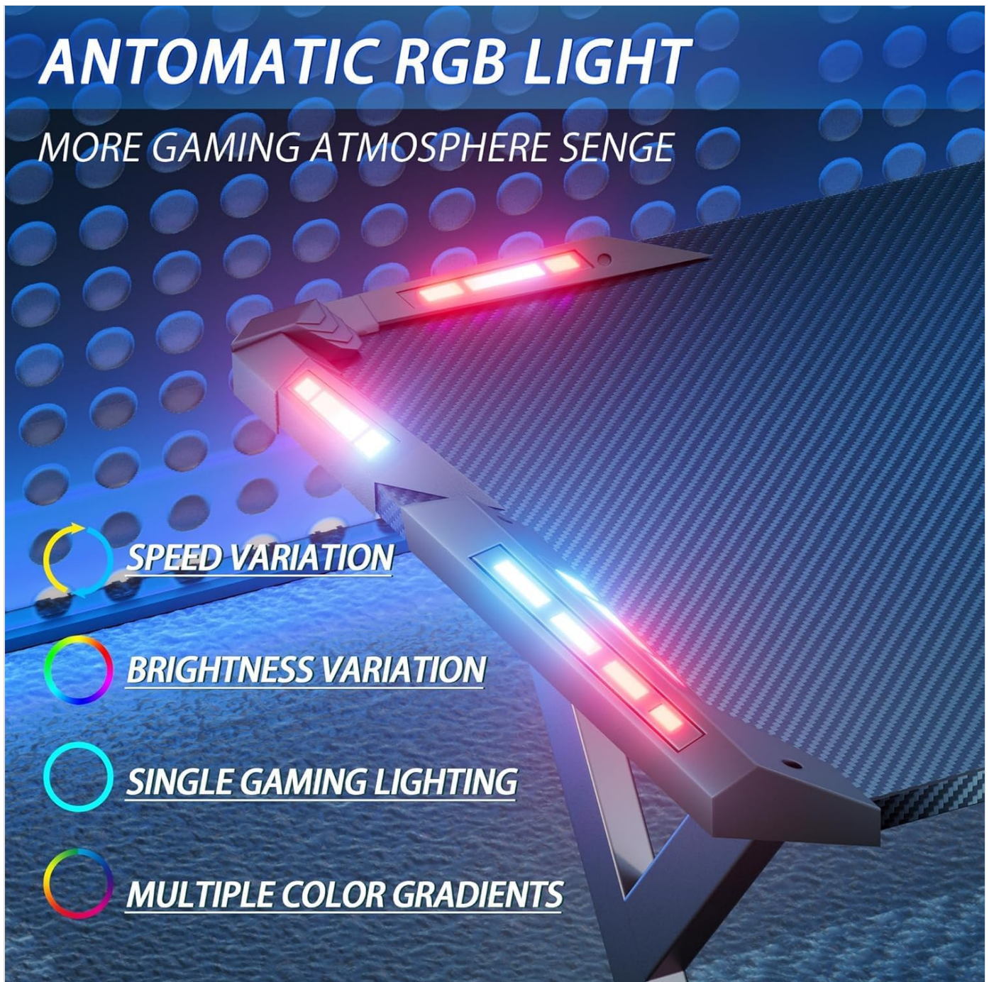
Image 5.1: A detailed view of the desk's RGB LED lighting system, illustrating the various control options available via the remote, such as speed variation, brightness adjustment, single gaming lighting, and multiple color gradients.