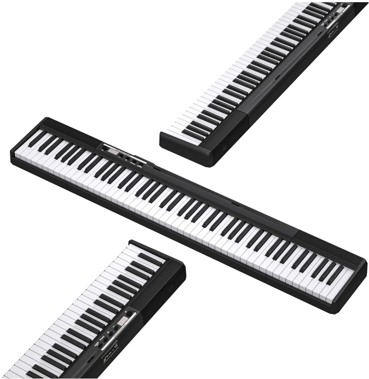
Figure 4: Detailed view of the Longeye Piano Keyboard's control panel, showing buttons for power, volume, demo, rhythm, tone, split, record, and other functions, along with a digital display.