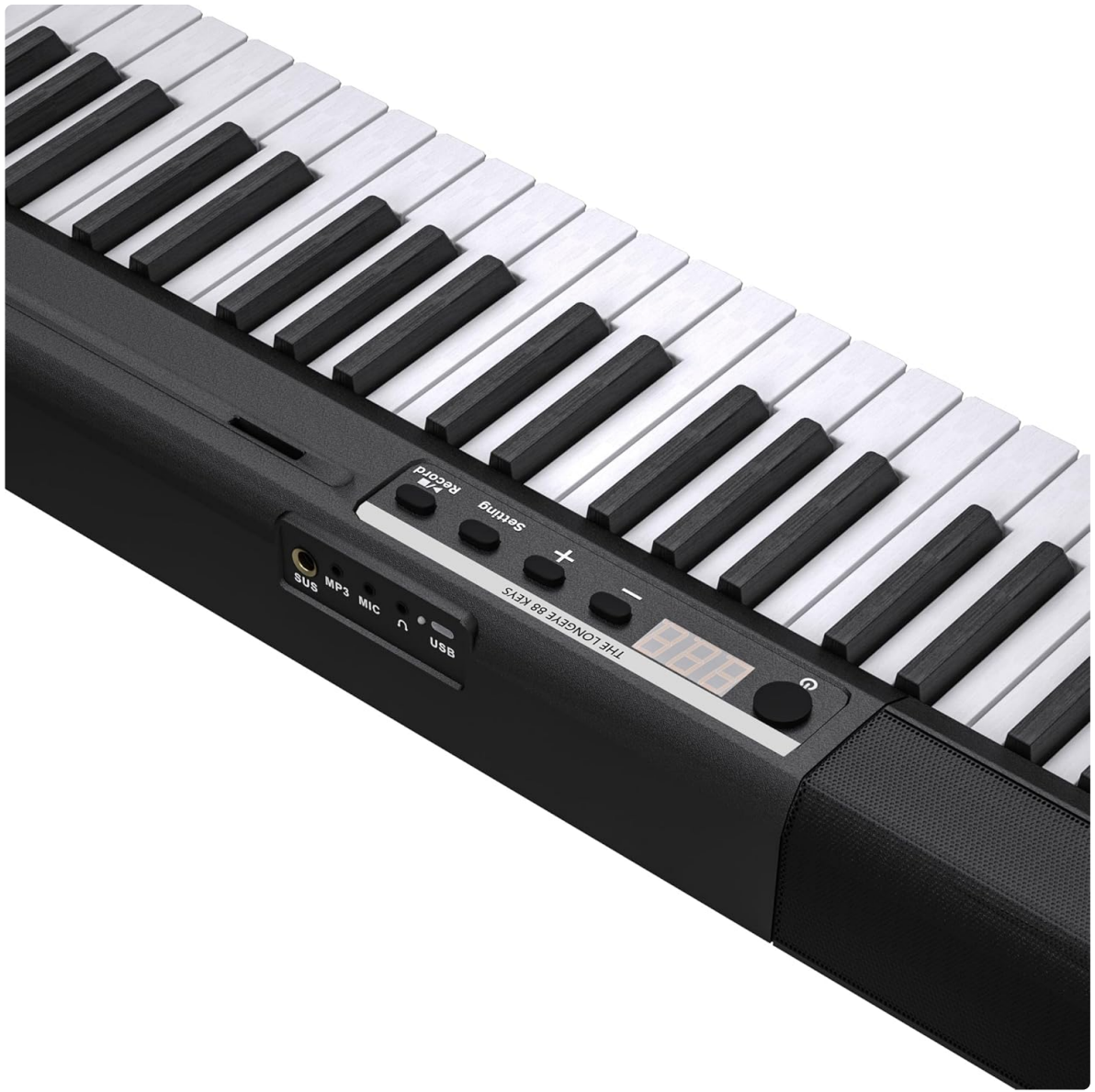
Figure 3: Close-up view of the back panel of the Longeye Piano Keyboard, showing the various input and output ports for accessories like the sustain pedal, headphones, and USB power.