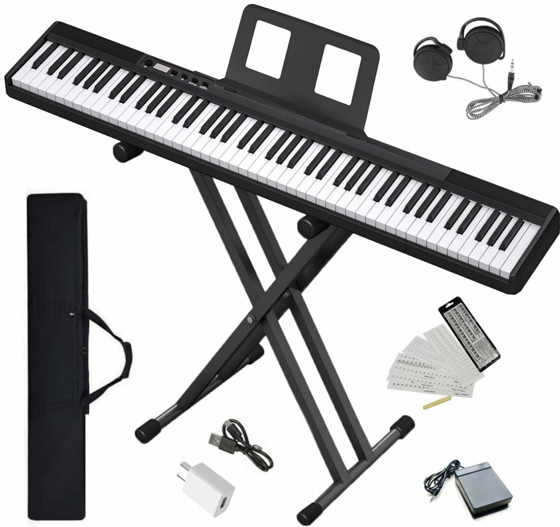
Figure 1: Longeye Piano Keyboard 88 Keys. This image shows the full 88-key digital piano in black, highlighting its sleek design and compact form factor.