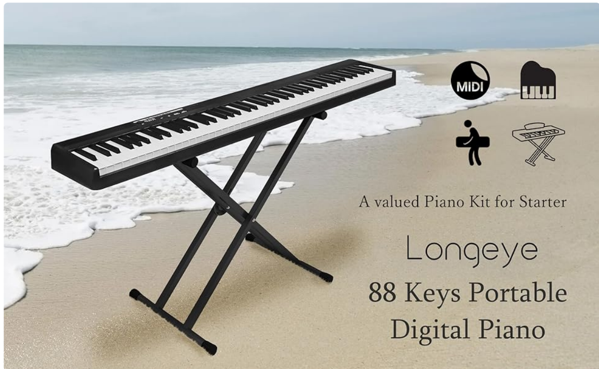
Figure 2: The Longeye Piano Keyboard set, including the double-X stand, headphones, sustain pedal, and music rest. The stand provides robust support for the keyboard.

Assemble the double-X stand by following the included instructions. Ensure all screws are tightened for stability. The stand is designed to provide extra stability for your digital piano.