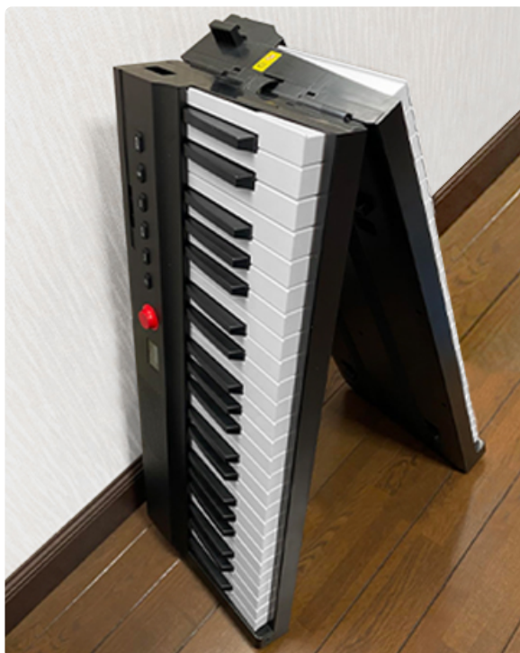
Figure 5: Close-up of the Longeye Piano Keyboard's semi-weighted keys, illustrating the authentic feel and touch response for expressive playing.

Experience an authentic playing feel with 100% full-size piano keys. The GEN2 semi-weighted touch simulates an acoustic piano, enhancing dynamic performance by adjusting note volume based on key pressure.