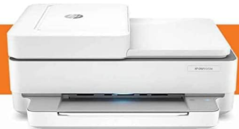
HP ENVY 6458e