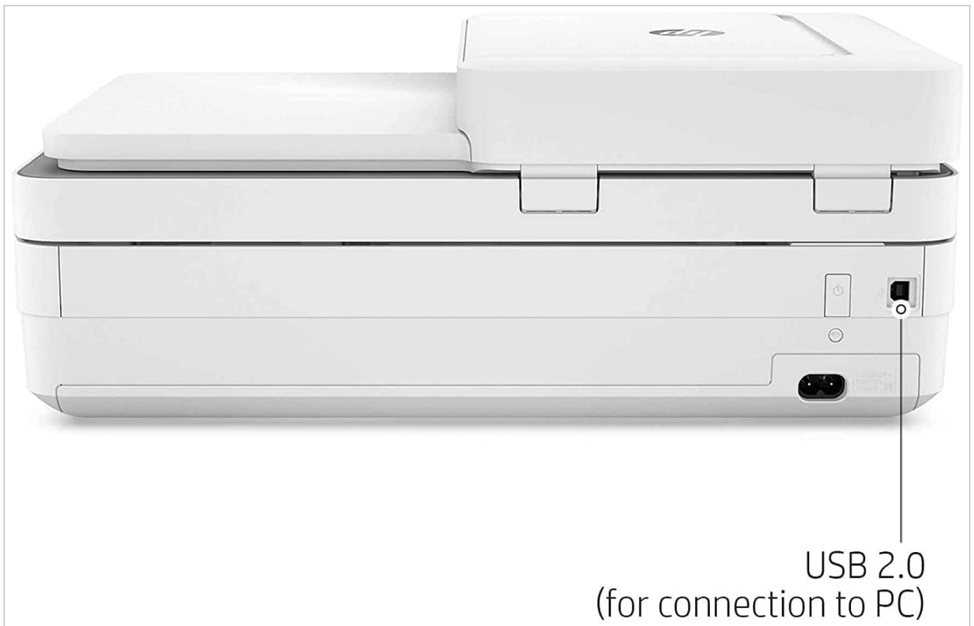
Figure 3: Rear view of the HP Envy 6458e printer. This image shows the back of the printer, indicating the location of the USB 2.0 port for PC connection.