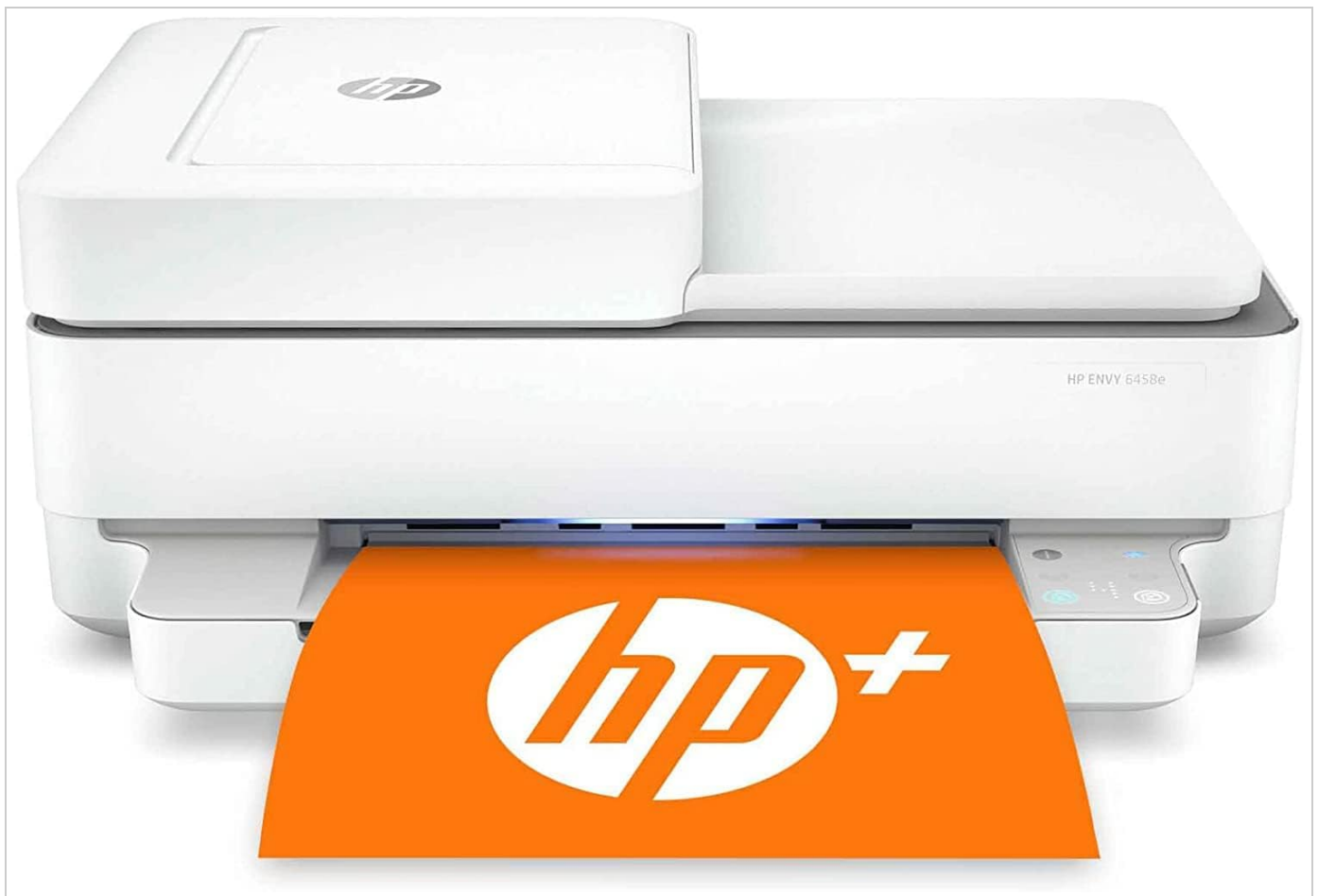
Figure 1: HP Envy 6458e All-in-One Printer. This image shows the printer from the front, with a sheet of paper featuring the HP+ logo emerging from the output tray.