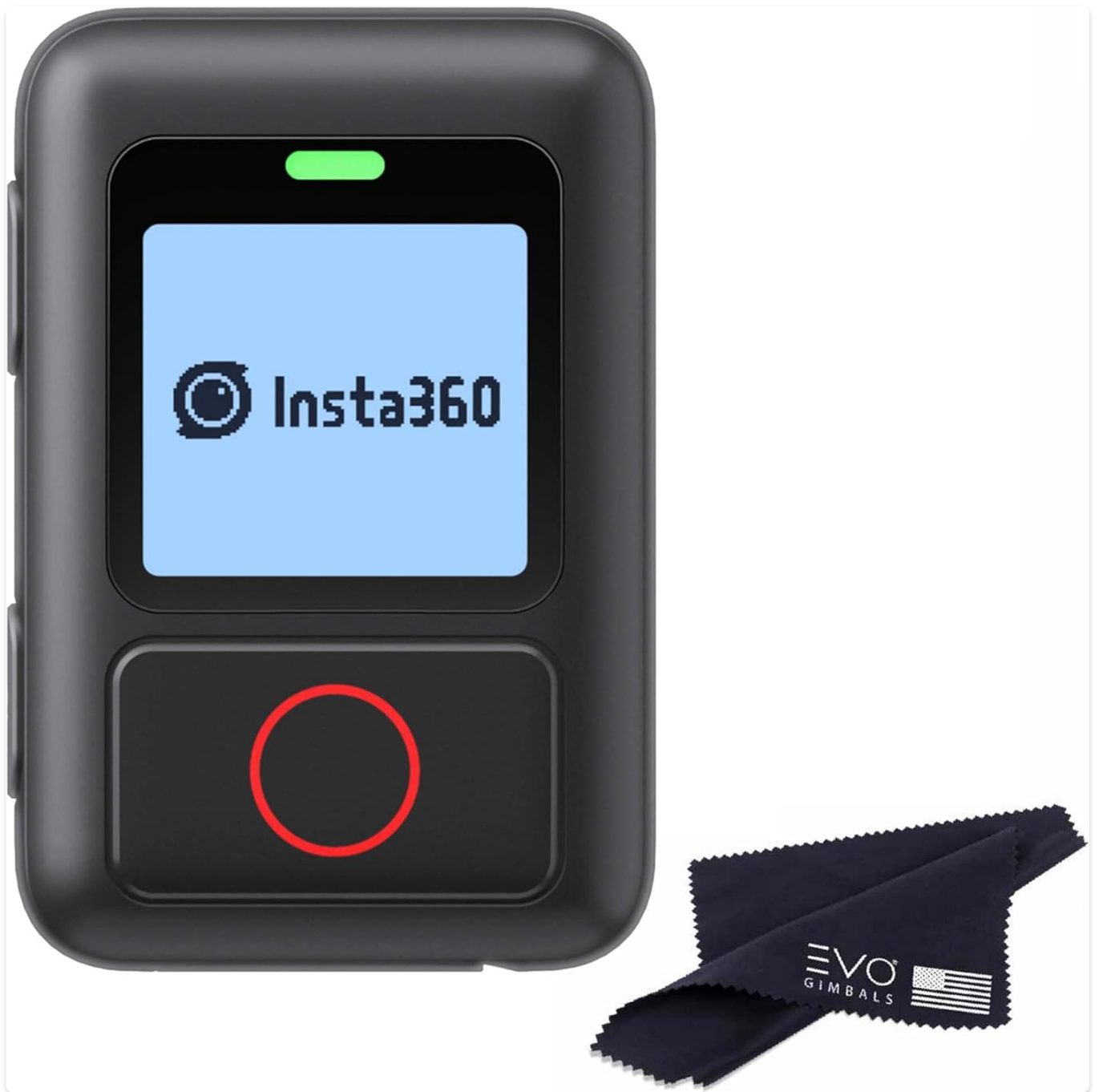
Front view of the remote, highlighting its display screen and large red control button.