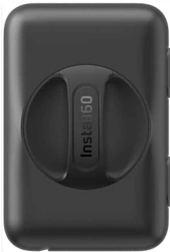
Rear view of the remote, showcasing the integrated mounting plate for accessories.