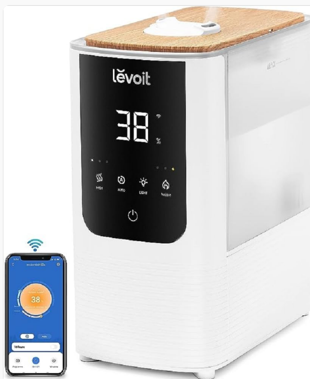
Image: The LEVOIT OasisMist 450S Smart Humidifier, showing its sleek white design, digital display, and a smartphone screen displaying the VeSync app interface.

Welcome to your new LEVOIT OasisMist 450S Smart Humidifier. This manual provides essential information for safe operation, setup, maintenance, and troubleshooting. Please read it thoroughly before use and retain it for future reference.