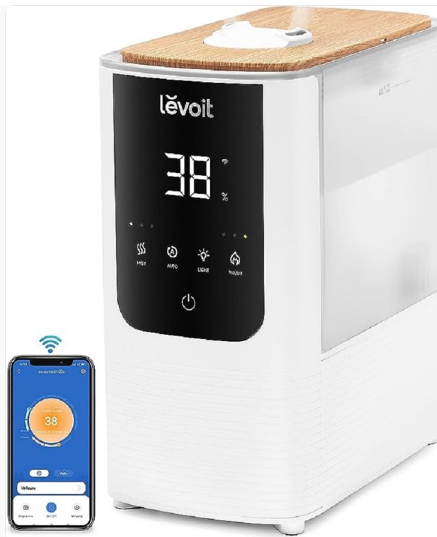
Image: A visual representation of the LEVOIT OasisMist 450S Smart Humidifier. (Note: For a detailed component diagram, please refer to the physical manual included with your product.)