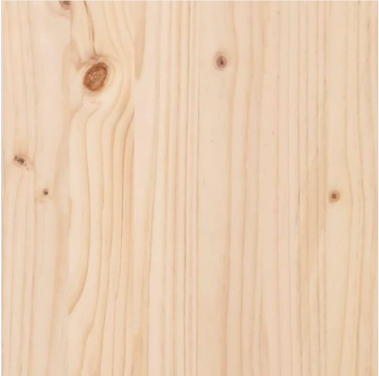
Figure 4: Detail of the natural pine wood grain.