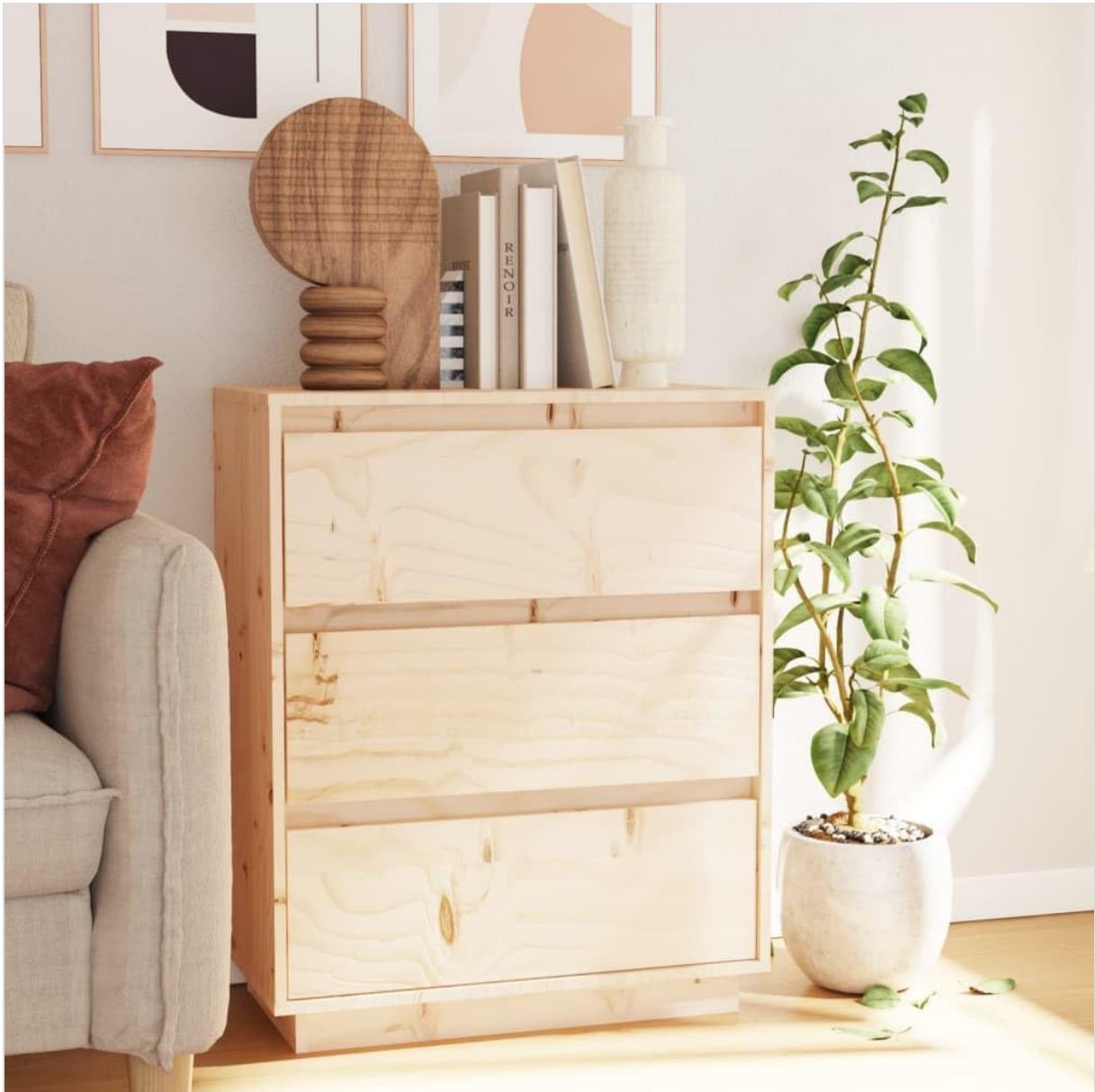
Figure 2: Assembled Sideboard (drawers closed).