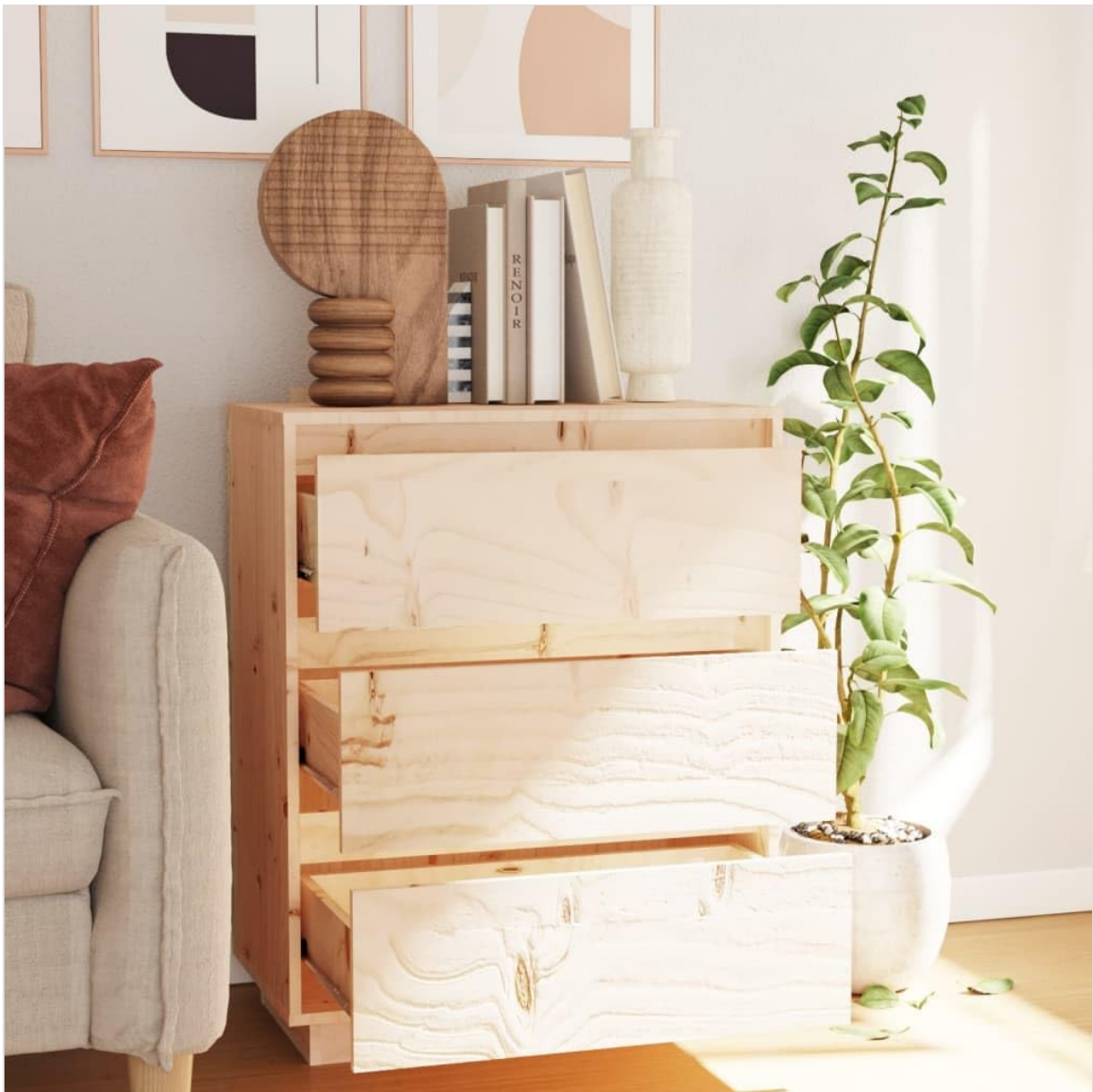
Figure 3: Sideboard with drawers open, demonstrating storage capacity.