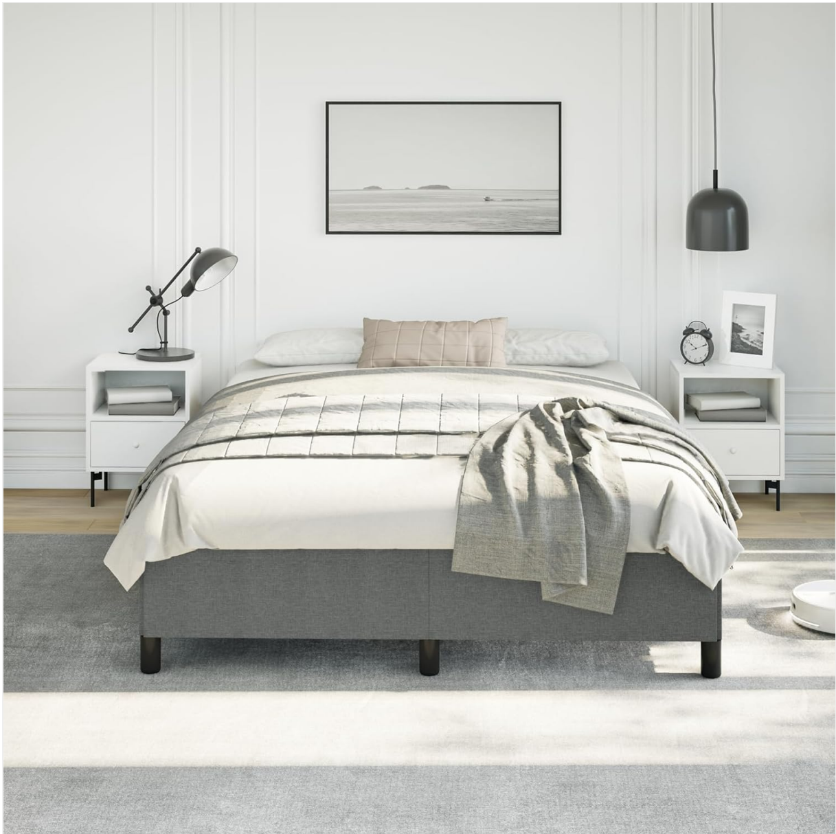
Figure 5: Assembled Bed Frame with Mattress. This image shows the bed frame fully set up with a mattress and bedding, demonstrating its intended use in a bedroom environment.