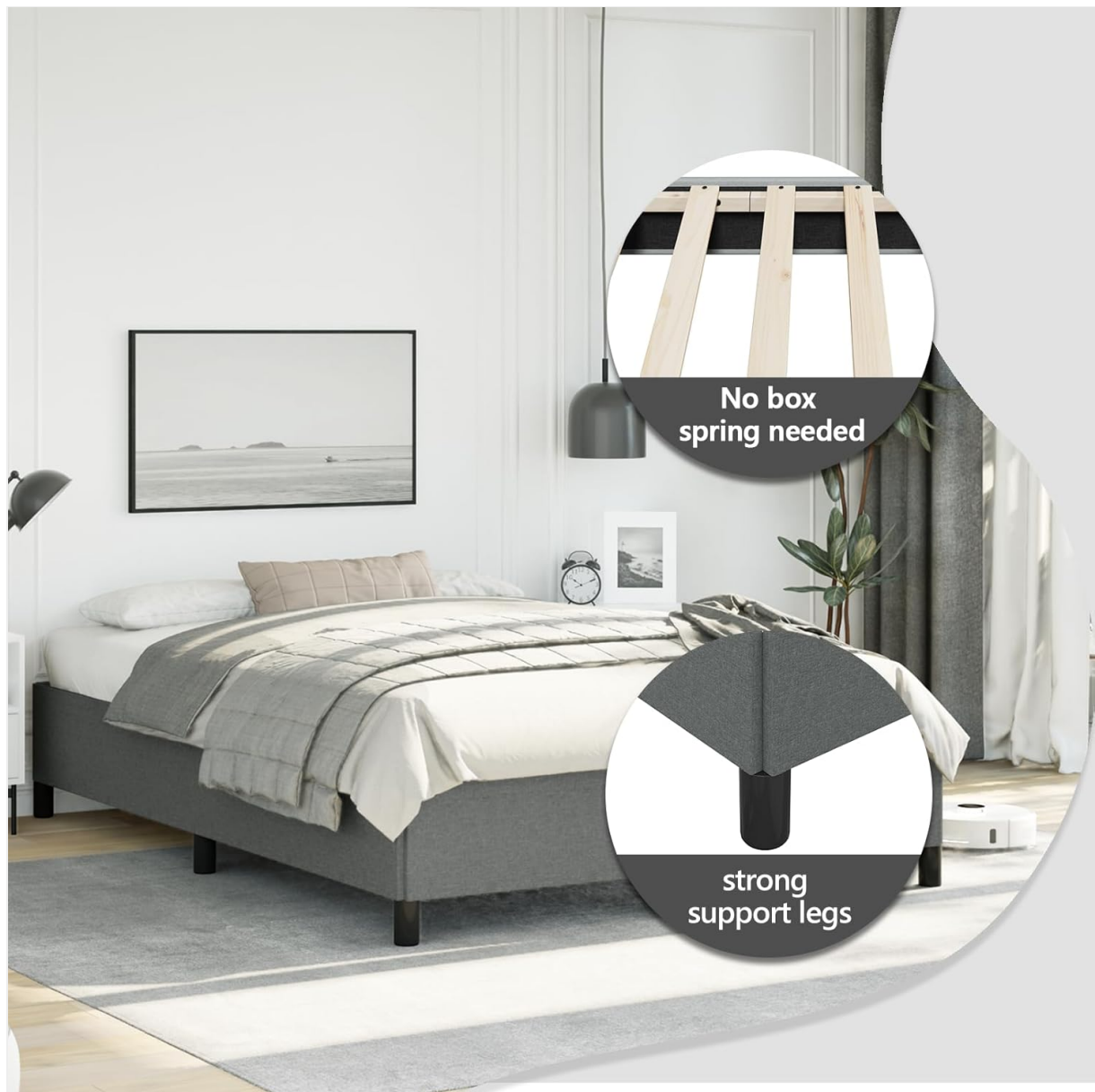
Figure 4: Key Assembly and Design Features. This graphic highlights the bed frame's sturdy construction, its adaptability for customization, and the simplicity of its assembly process.