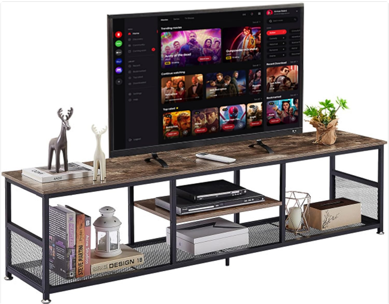
Figure 1: VECELO Industrial TV Stand with a television and decorative items.