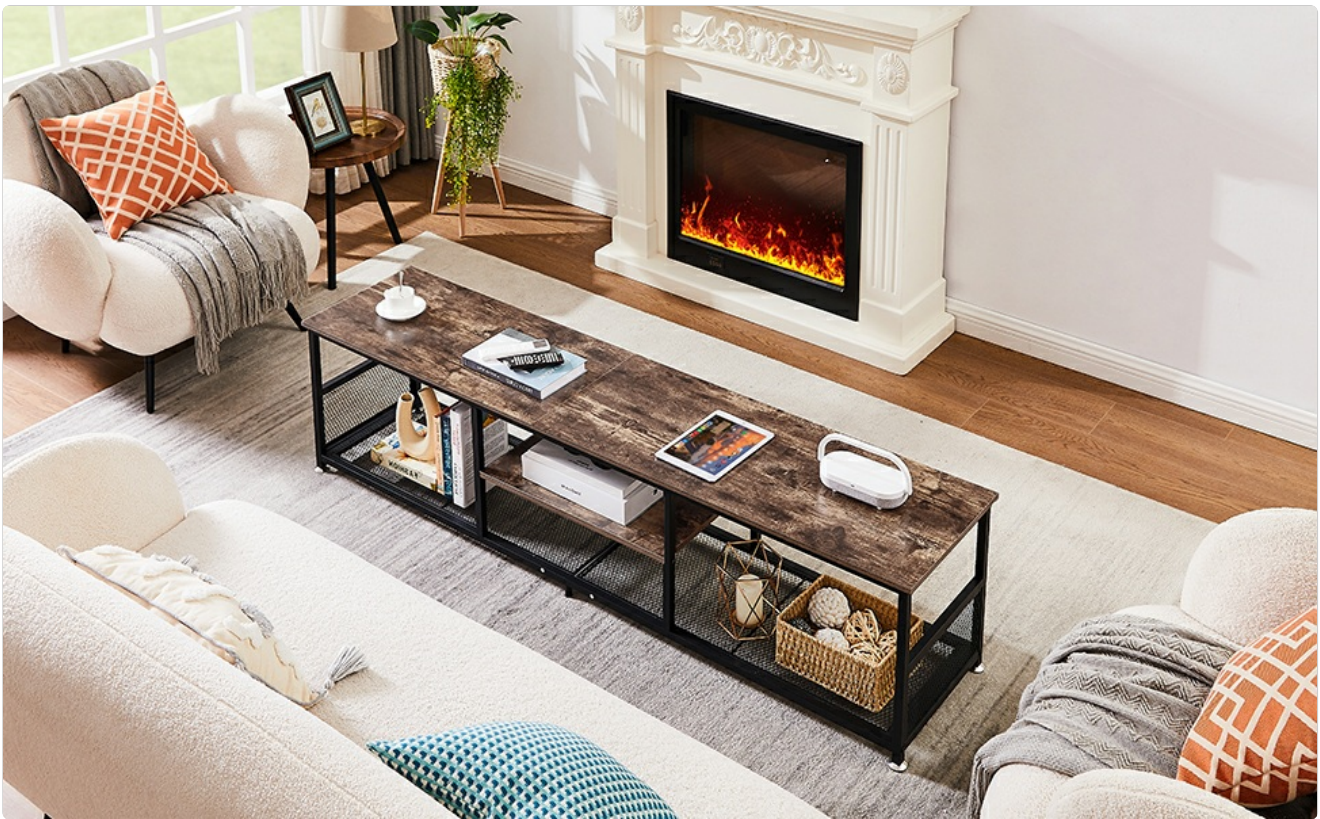
Figure 4: The TV stand integrated into a modern living room setup.