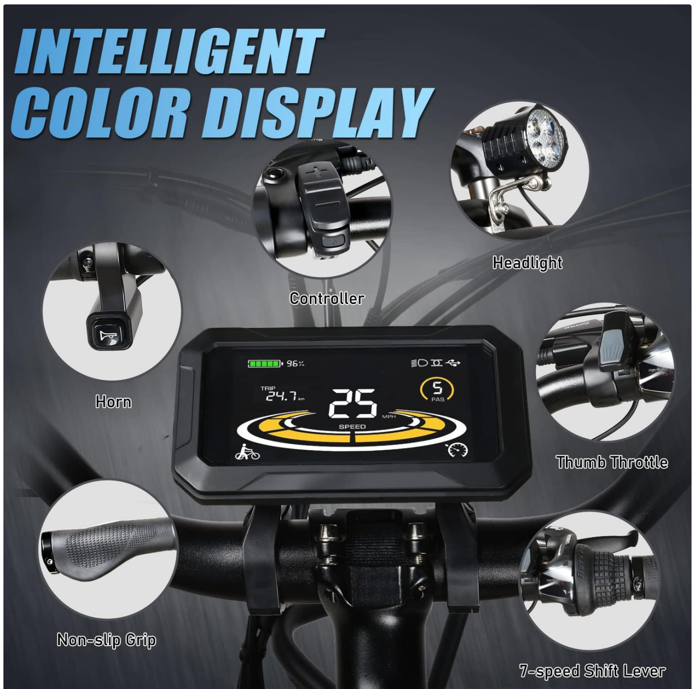
Figure 3: Intelligent Color Display and control components. This image highlights the LCD display, controller, headlight, horn, thumb throttle, non-slip grips, and 7-speed shift lever, showing their positions on the handlebar.

Press and hold the power button on the LCD display to turn the bike's electrical system on or off.