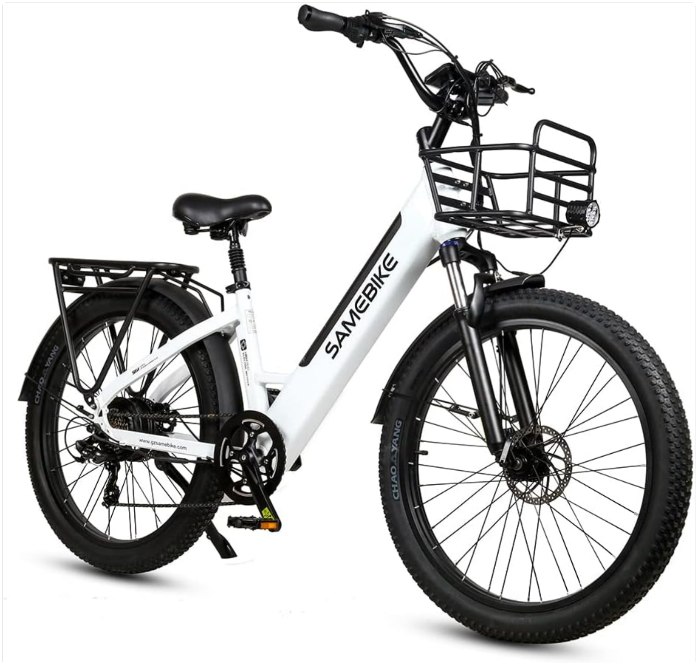
Figure 1: Overview of the SAMEBIKE RS-A01 Electric Bike. This image displays the full bike from a side angle, highlighting its white frame, front basket, rear rack, and fat tires.