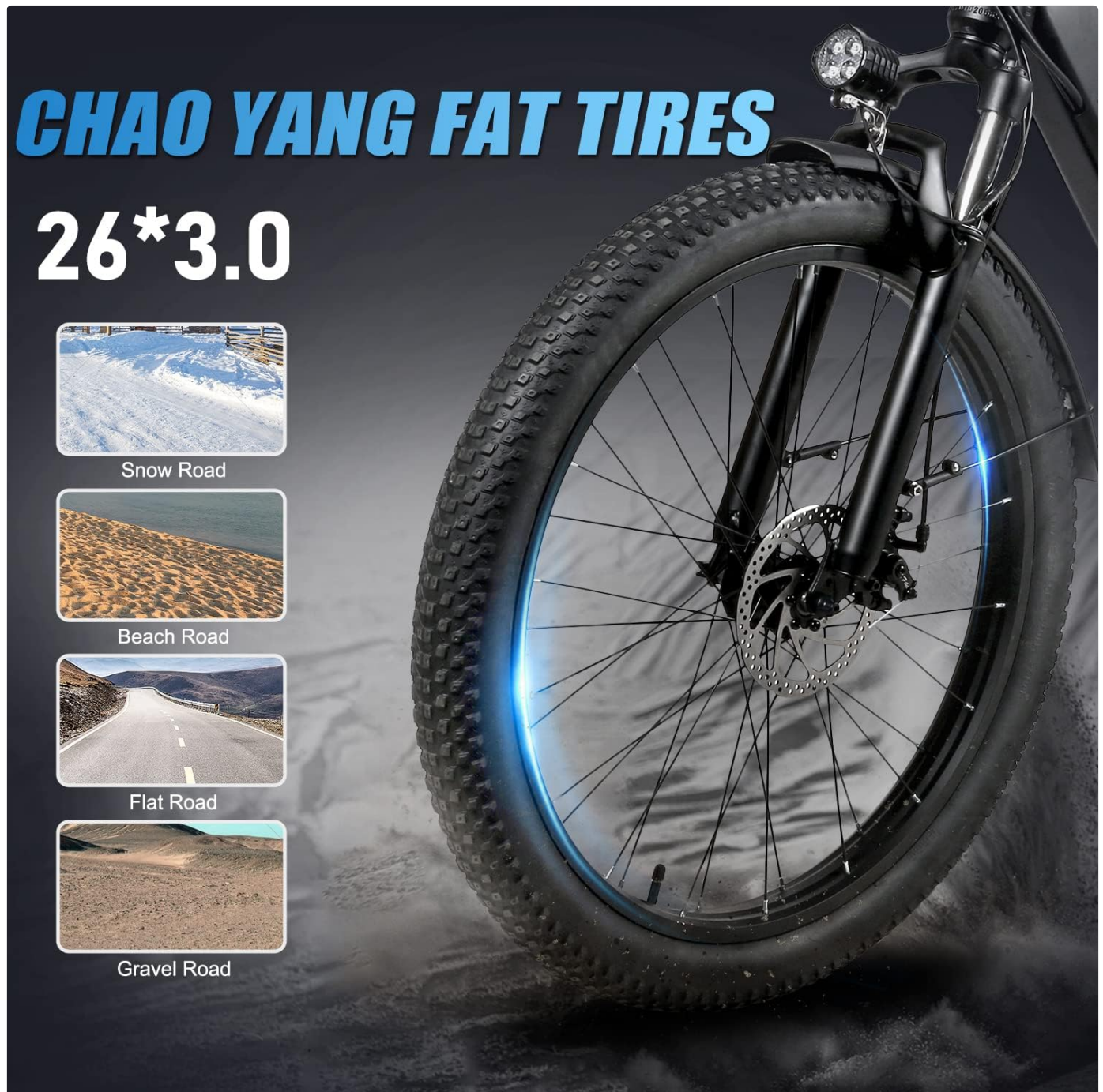
Figure 5: Chao Yang 26x3.0 inch fat tires suitable for various terrains. This image displays the fat tire and provides visual examples of suitable riding conditions: Snow Road, Beach Road, Flat Road, and Gravel Road.

The 26x3.0 inch fat tires are designed for versatility. Adjust tire pressure according to the terrain for optimal performance and comfort. Lower pressure is suitable for soft surfaces like snow or sand, while higher pressure is better for paved roads.