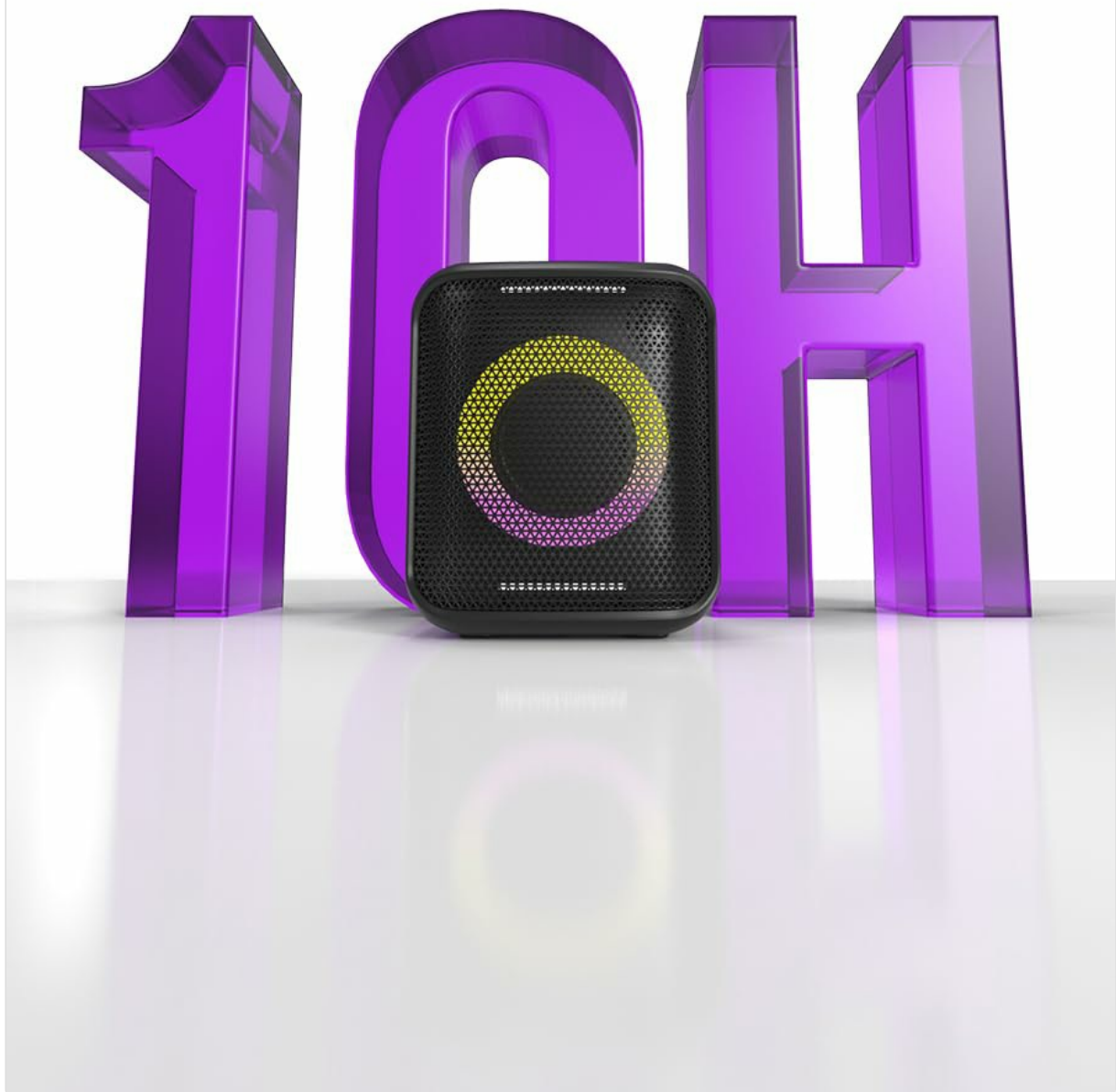
Image: The F&D PA100 speaker, emphasizing its battery life of up to 10 hours.

A built-in large capacity 4000mAh lithium battery, continuously play for 10 Hours.