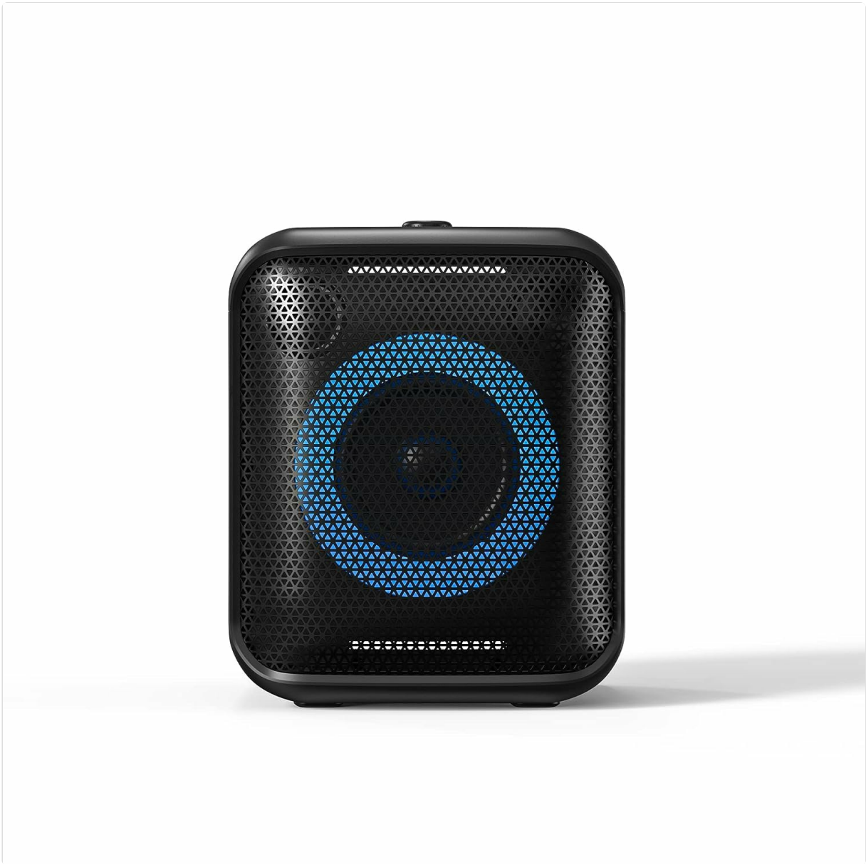
Image: Front view of the F&D PA100 speaker, showcasing its design and LED lighting.