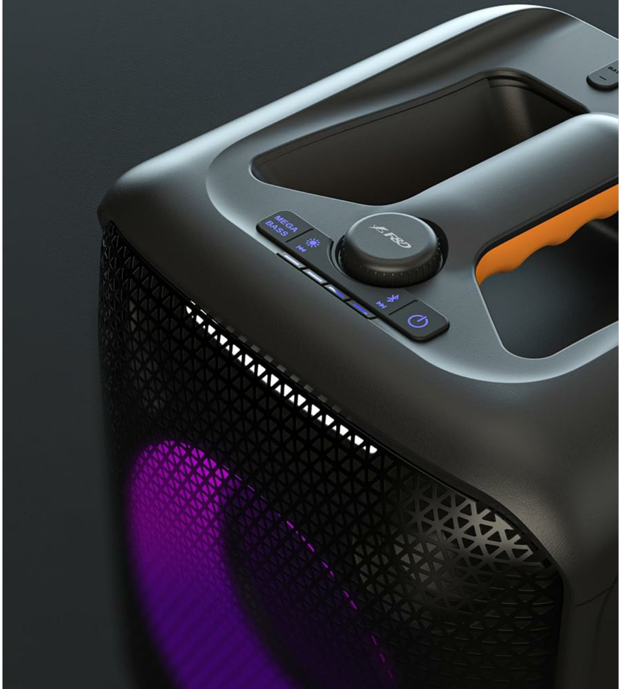
Image: Top panel of the F&D PA100 speaker, highlighting its durable and splash-resistant construction.

The main body is made of ABS plastic, with high hardness, corrosion resistance, and IPX4 waterproof.