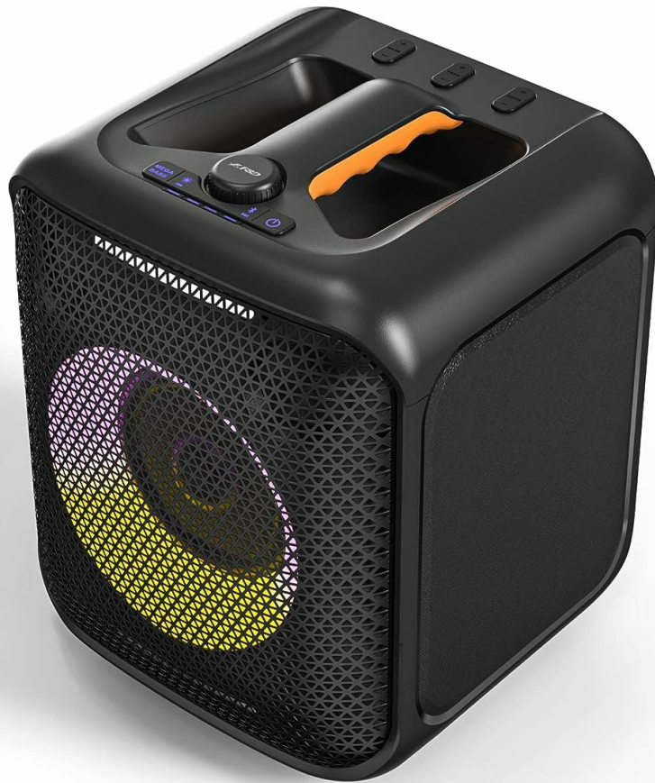
Image: Angled top view of the F&D PA100 speaker, displaying the control panel and integrated handle.