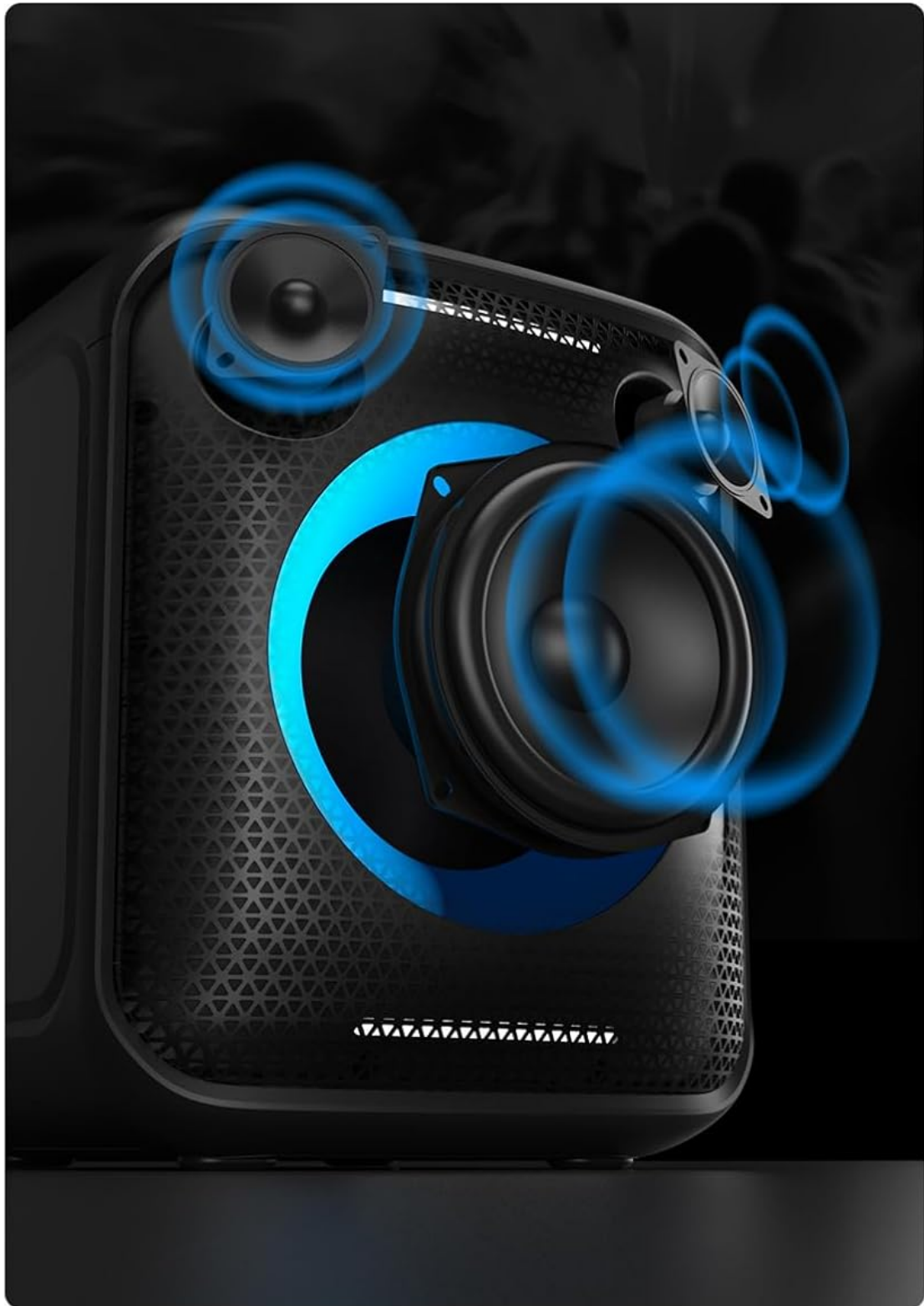
Image: Internal view highlighting the 5.25-inch subwoofer and 2-inch tweeters for high-performance audio.

Equipped with an 5.25-inch subwoofer and two 2-inch tweeters, Adjustable rich bass and clear high-pitch sound.