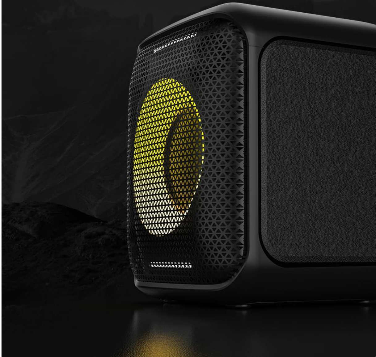
Image: Side profile of the F&D PA100 speaker, illustrating its concise and sleek exterior design.

The brief and sleek outward line of the rectangular speaker forms a coherent overall esthetic sense.