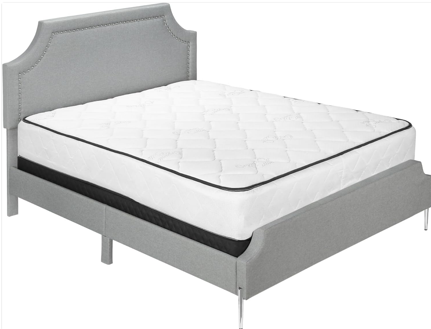
Image: The assembled bed frame with a mattress and box spring in place, demonstrating how the bed appears when ready for use.