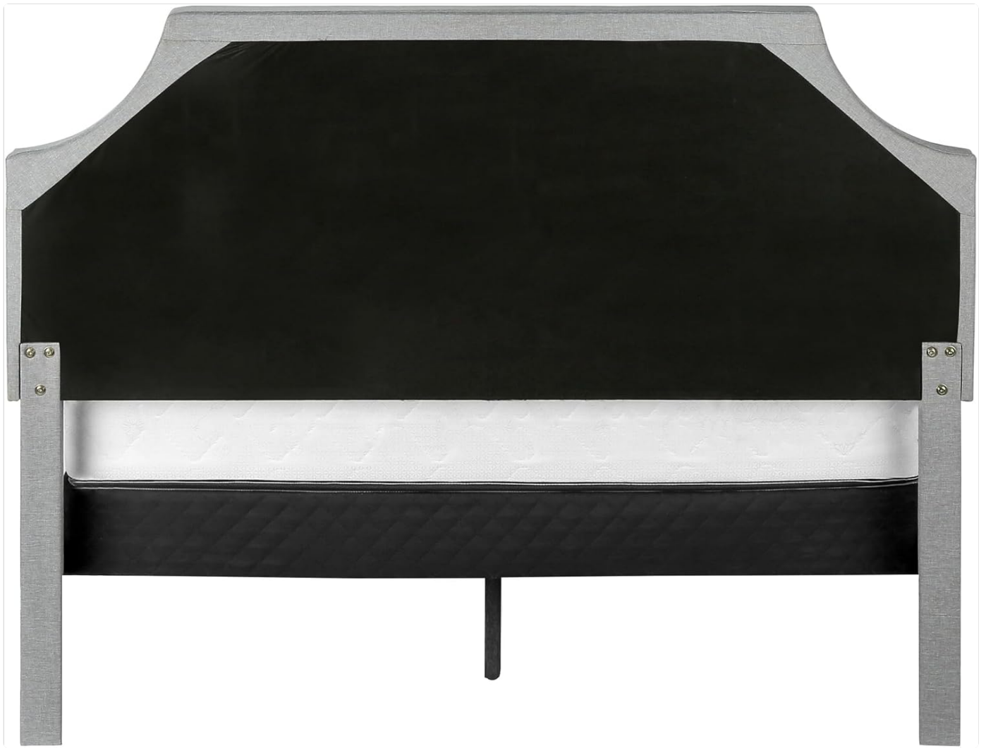
Image: The back of the headboard, revealing the zippered compartment where assembly hardware and instructions are stored.