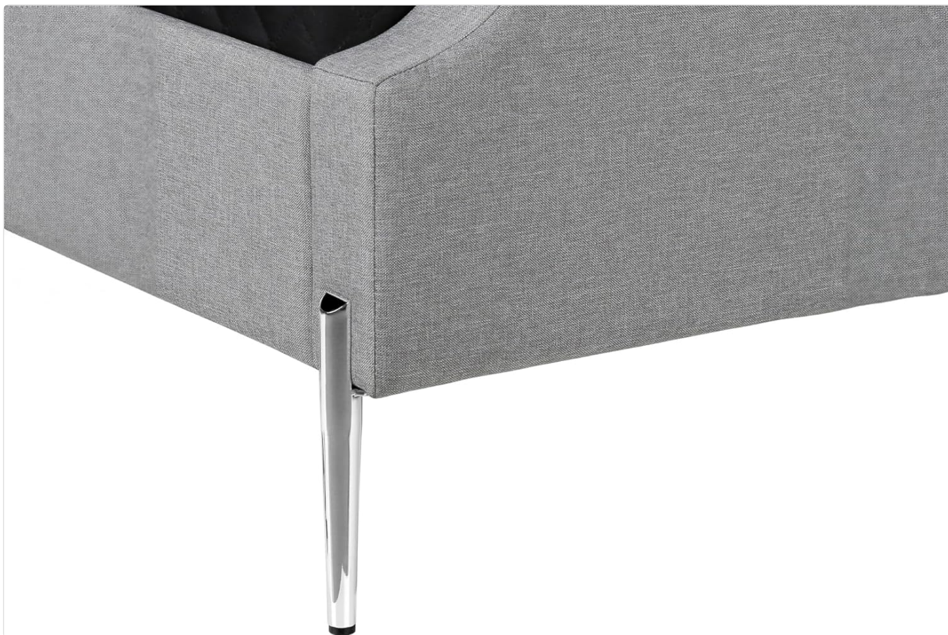
Image: A close-up shot of the sleek chrome metal legs at the footboard, showcasing their modern design and finish.