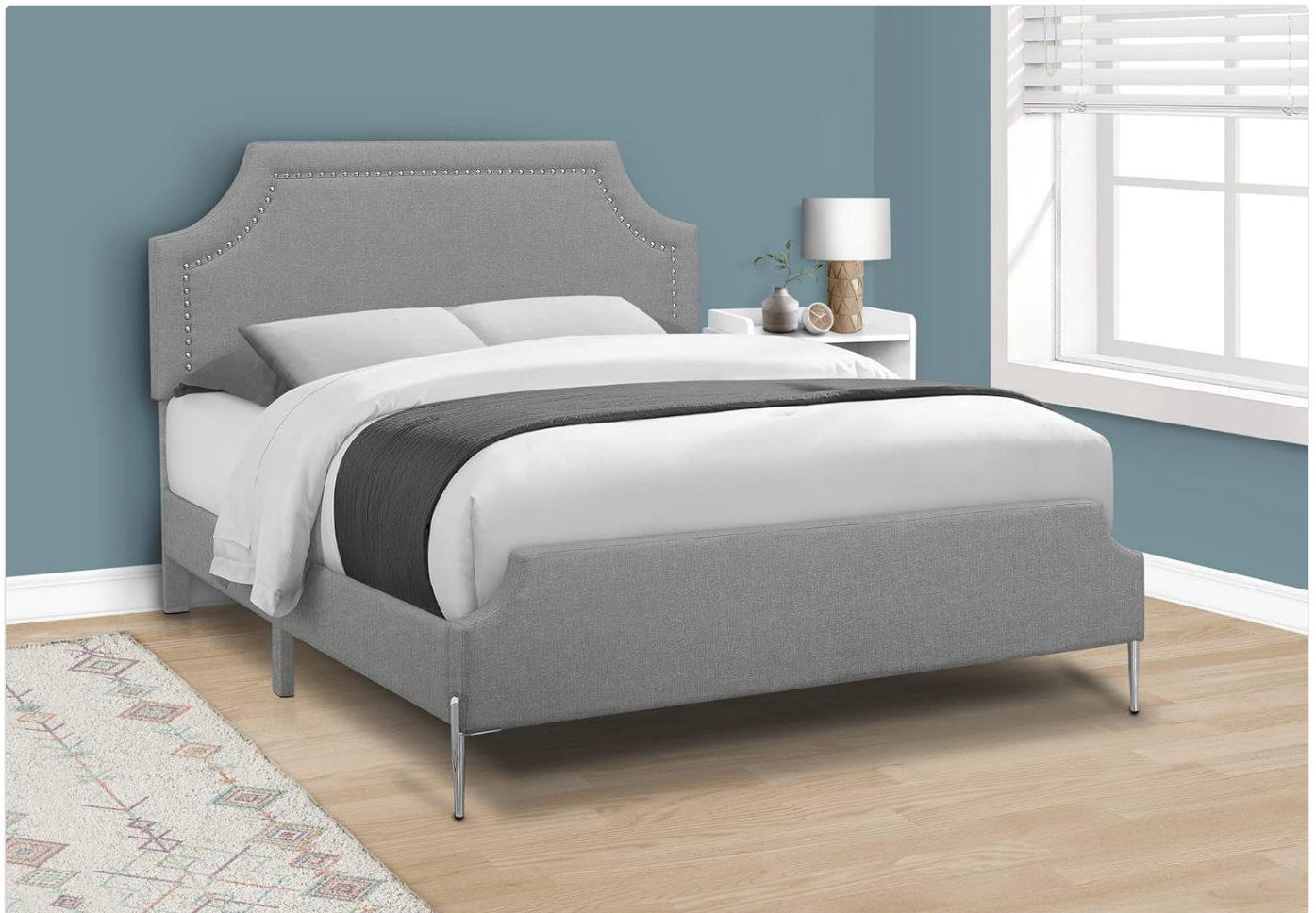
Image: The Monarch Specialties I 6035Q Queen Size Upholstered Platform Bed, featuring a grey linen-look fabric and chrome metal legs,

This manual provides detailed instructions for the assembly, operation, maintenance, and troubleshooting of your Monarch Specialties I 6035Q Queen Size Upholstered Platform Bed. Please read this manual thoroughly before beginning assembly to ensure proper setup and safe use of your new bed frame. Keep this manual for future reference.