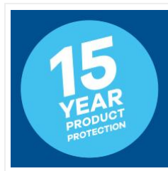
Image: An icon signifying the 15-year product protection offered with the device.

For technical support, warranty claims, or any questions regarding your device, please refer to the contact information provided in your product packaging or visit the official Satisfyer website.