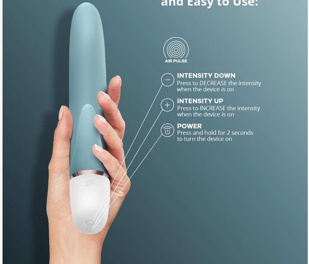
Image: A hand demonstrates the location of the power, intensity up, and intensity down buttons on the Satisfyer Marvelous Four device.