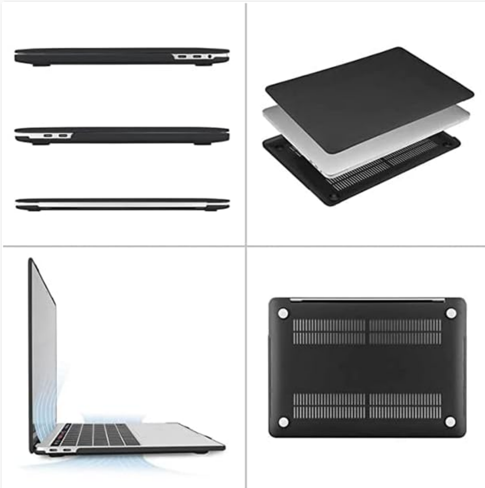
Image: Various views of the hardshell case, highlighting the ventilation slots on the bottom cover and the precise cutouts for ports on the sides.