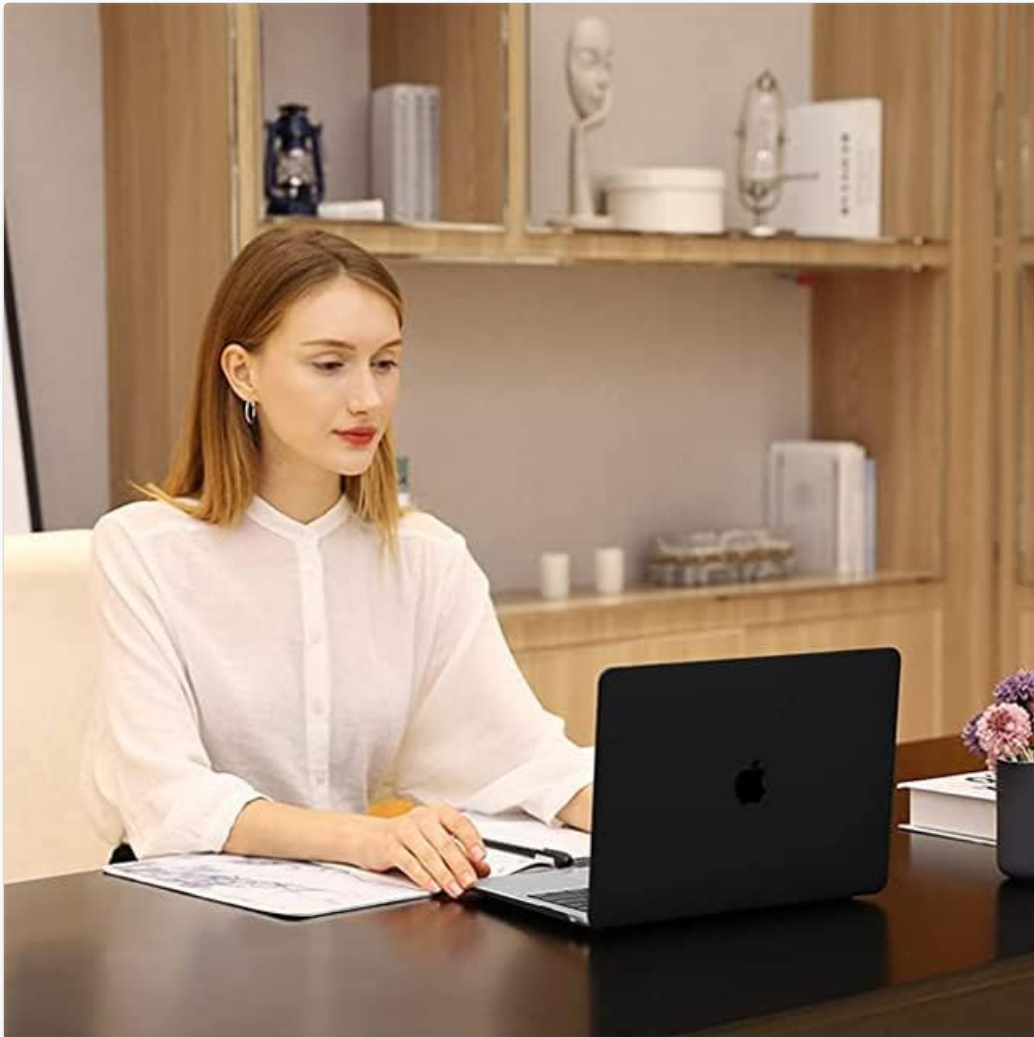
Image: A person working on a MacBook Pro with the AWH hardshell case installed, demonstrating its seamless integration into daily use.

Once installed, your AWH Hardshell Shield Case, Keyboard Cover, and Screen Protector will provide continuous protection during daily use. The case allows full access to all ports, buttons, and the Touch ID sensor. The bottom cover's ventilation slots ensure proper heat dissipation during operation.