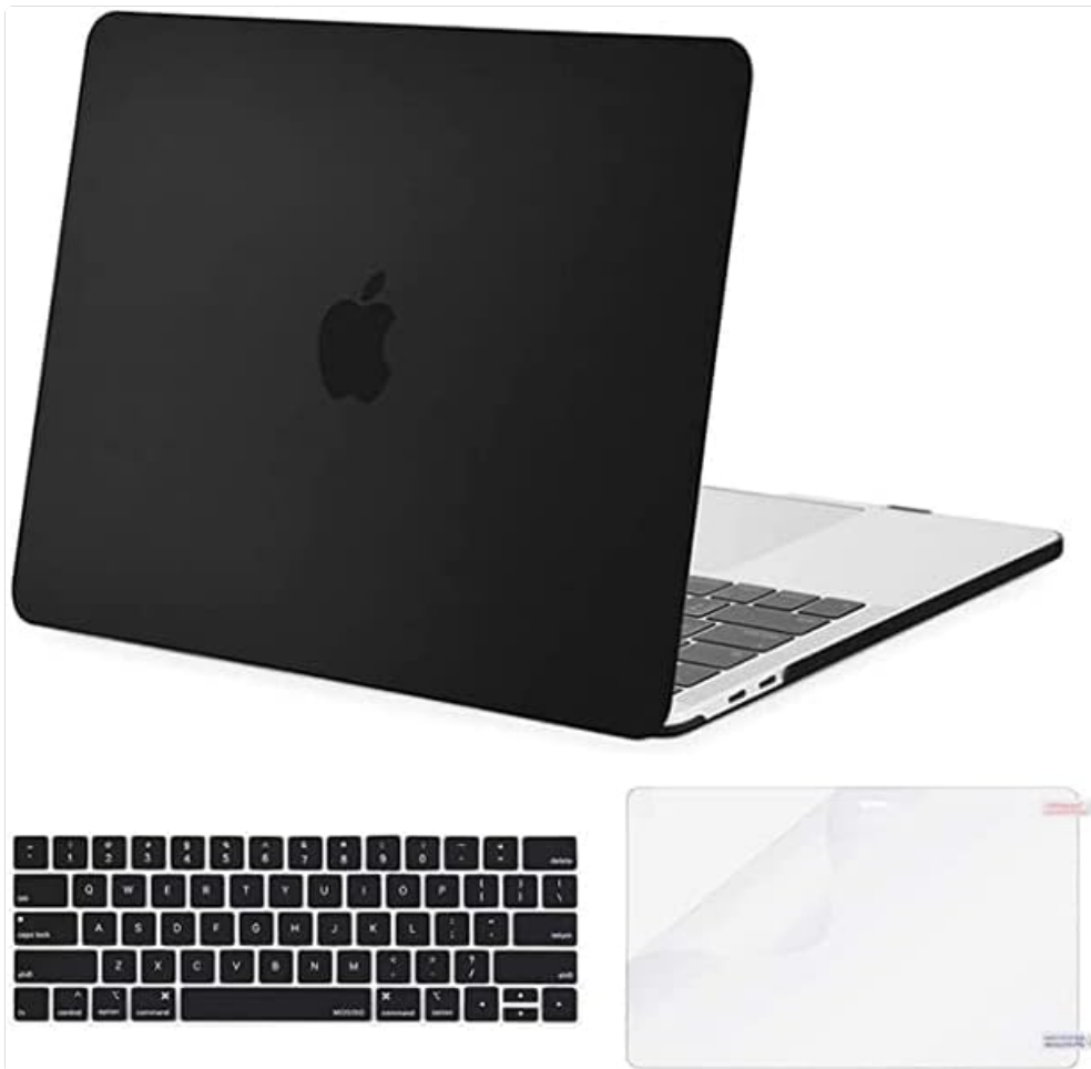
Image: The AWH Hardshell Shield Case (black), along with the included black keyboard cover and clear screen protector.