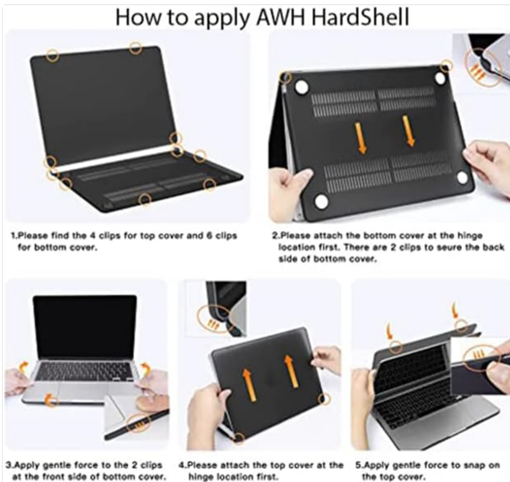
Image: A visual step-by-step guide demonstrating the proper method for installing the AWH hardshell top and bottom covers onto a MacBook Pro, showing clip locations and attachment points.