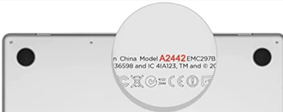
Image: A diagram illustrating how to locate the model number (A2442) on the back of the MacBook Pro 14-inch, emphasizing compatibility with this specific model.