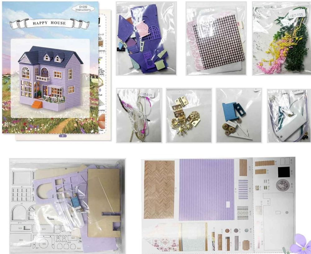
Image: Overview of the Flever Happy House DIY Dollhouse Kit contents.

All the materials needed for assembly are included, allowing you to enjoy the fun of DIY effortlessly.