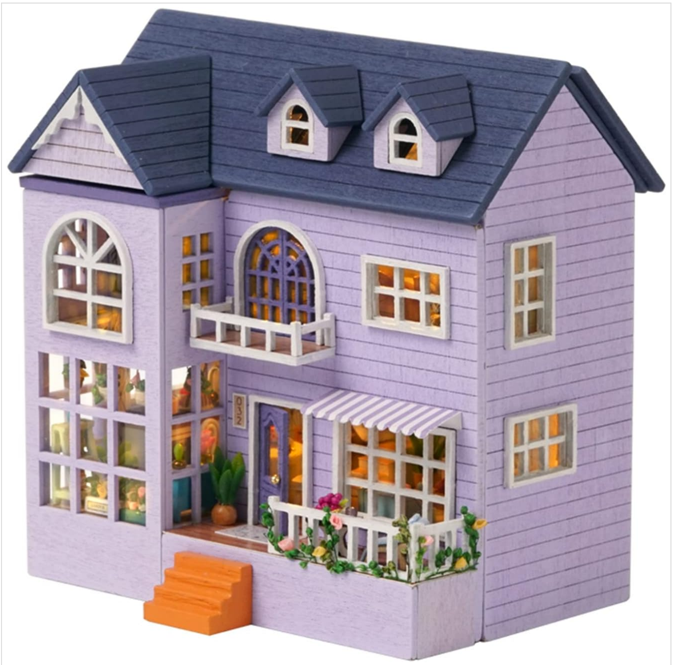
Image: The Flever Happy House illuminated at night.