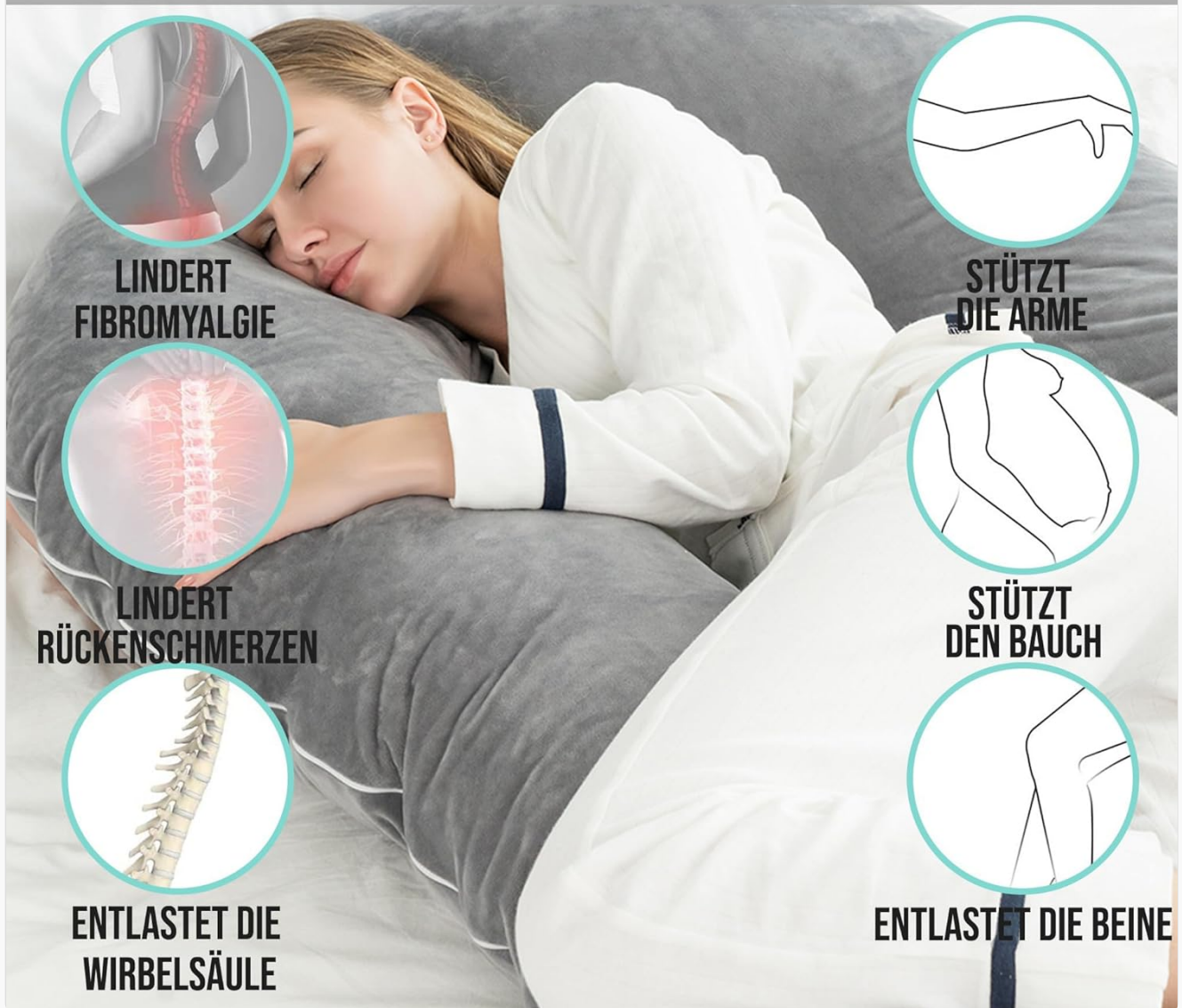
Image: A visual representation of the pillow's benefits, showing how it alleviates fibromyalgia, back pain, and provides support for the spine, arms, belly, and legs.