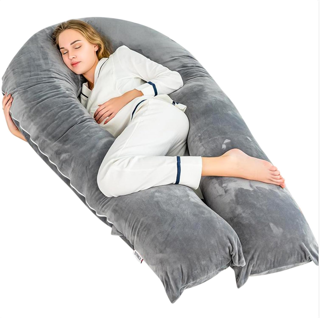
Image: A woman sleeping peacefully on her side, fully supported by the Strex U-shaped pregnancy pillow, illustrating its primary use for comfortable sleep.