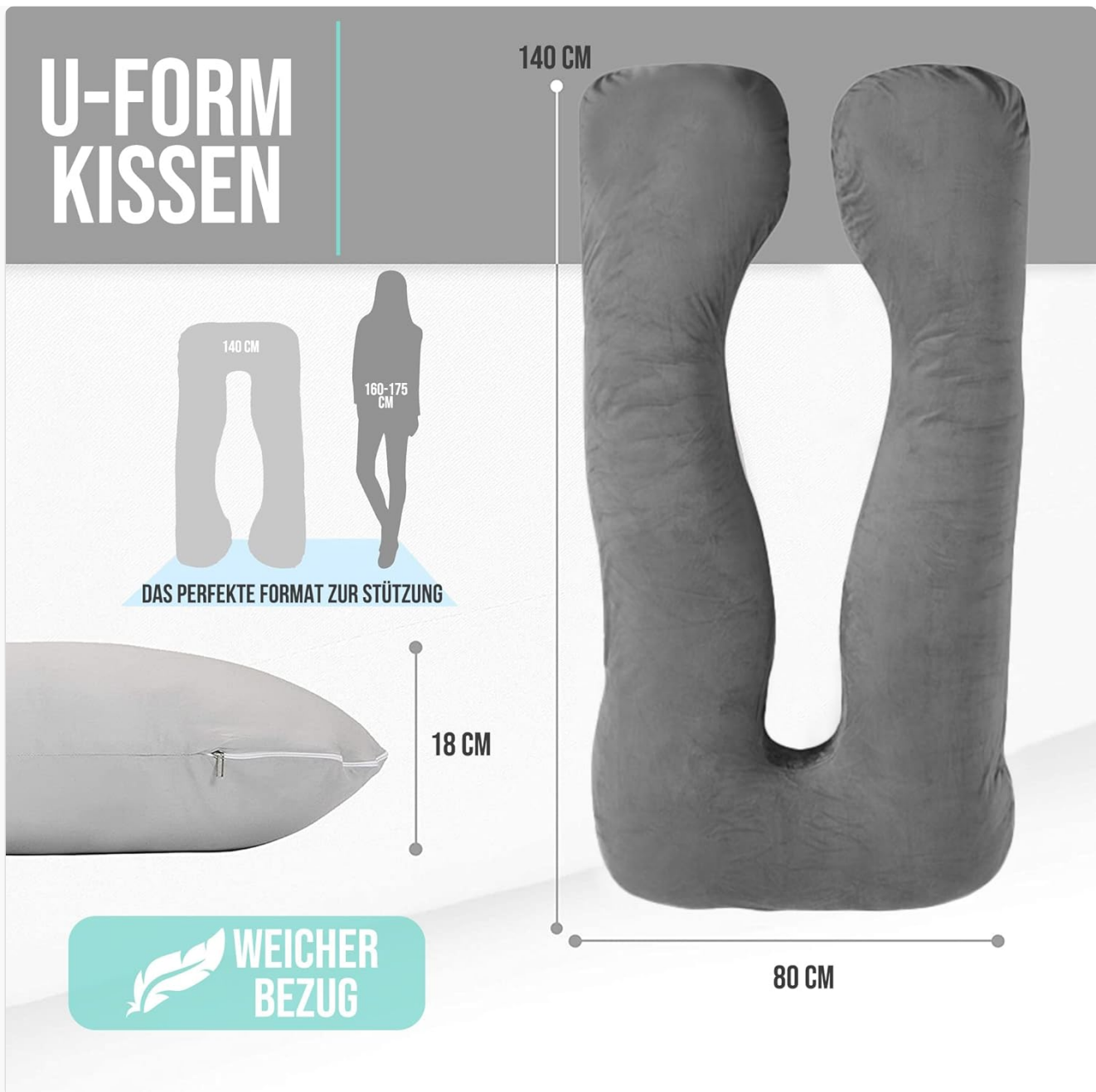
Image: A diagram illustrating the dimensions of the U-shaped pillow (140 cm length, 80 cm width, 18 cm height) and its suitability for individuals between 160-175 cm in height.