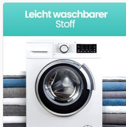
Image: A washing machine with neatly folded towels, illustrating the ease of washing the pillow's fabric cover.

Image: A detailed view of the pillow's construction, showing the washable cover, adjustable padding, double zipper, soft velvet exterior, breathable inner cover, and high-quality cotton filling.