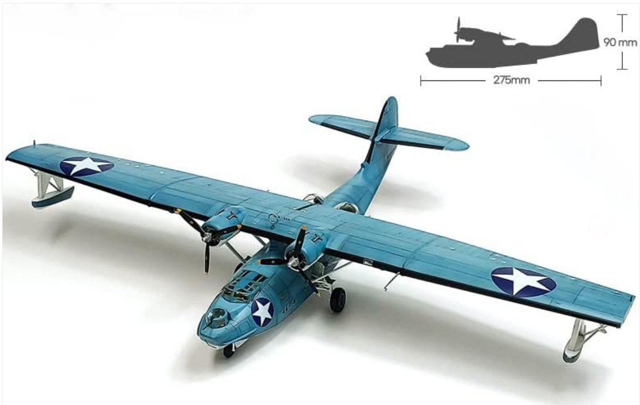
Figure 3.1: Fully assembled USN PB5-A model, showing overall dimensions (275mm length, 90mm height).

Refer to the specific diagrams and instructions included in your model kit box for detailed, step-by-step guidance on each component.