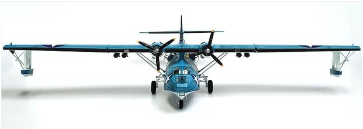
Figure 3.5: Frontal view of the model, displaying the nose turret and landing gear configuration.