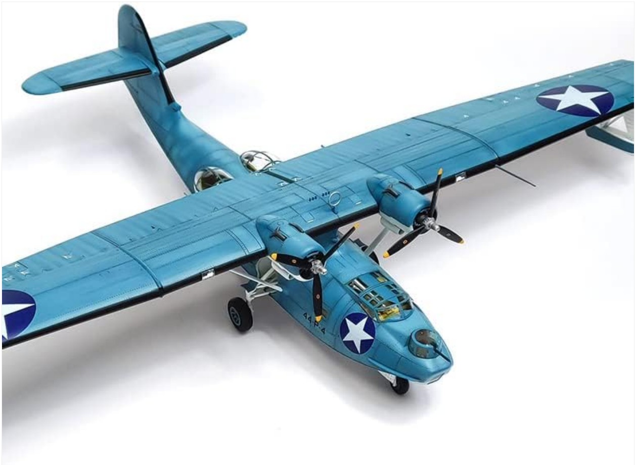
Figure 3.6: Angled front view, providing a perspective of the aircraft's broad wingspan and amphibious design.