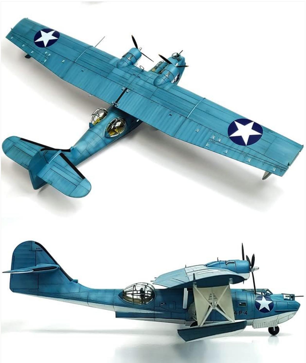
Figure 3.2: Top and side views of the completed model, highlighting the aircraft's distinctive shape and details.