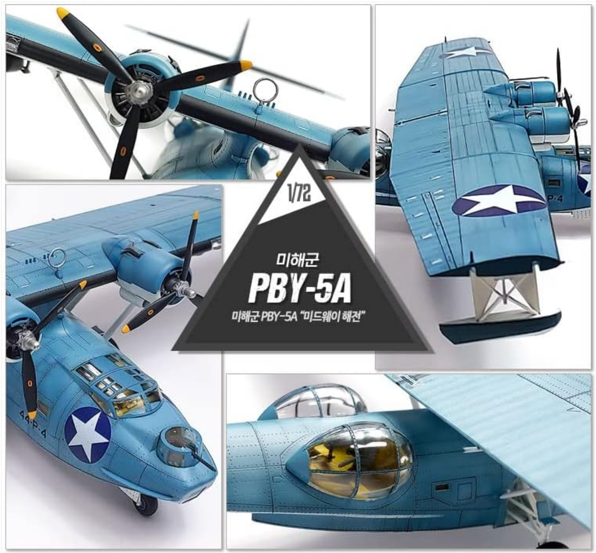
Figure 3.4: Close-up details of the model, showcasing the cockpit glazing, engine propellers, and tail section.