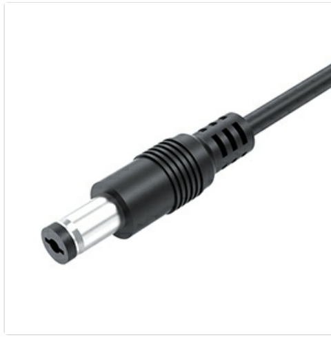
Image: A close-up view of the round tip connector, highlighting its design.