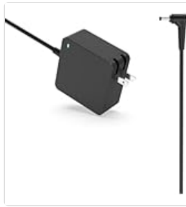
Image: Illustrates the compact design of the charger, showing approximate dimensions of 2.25 inches in height and 1.3 inches in width.