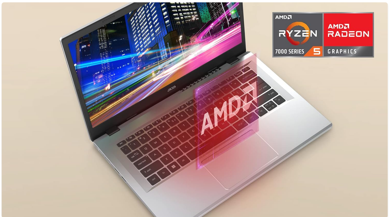
Figure 1: Acer Aspire 3 A315-24P-R2SC Slim Laptop

This manual provides essential information for setting up, operating, maintaining, and troubleshooting your Acer Aspire 3 A315-24P-R2SC Slim Laptop. Designed for practical multitasking and productivity, this laptop features the AMD Ryzen™ 7000 Series Processor and a 15.6" Full HD IPS display. Please read this manual thoroughly to ensure optimal performance and longevity of your device.