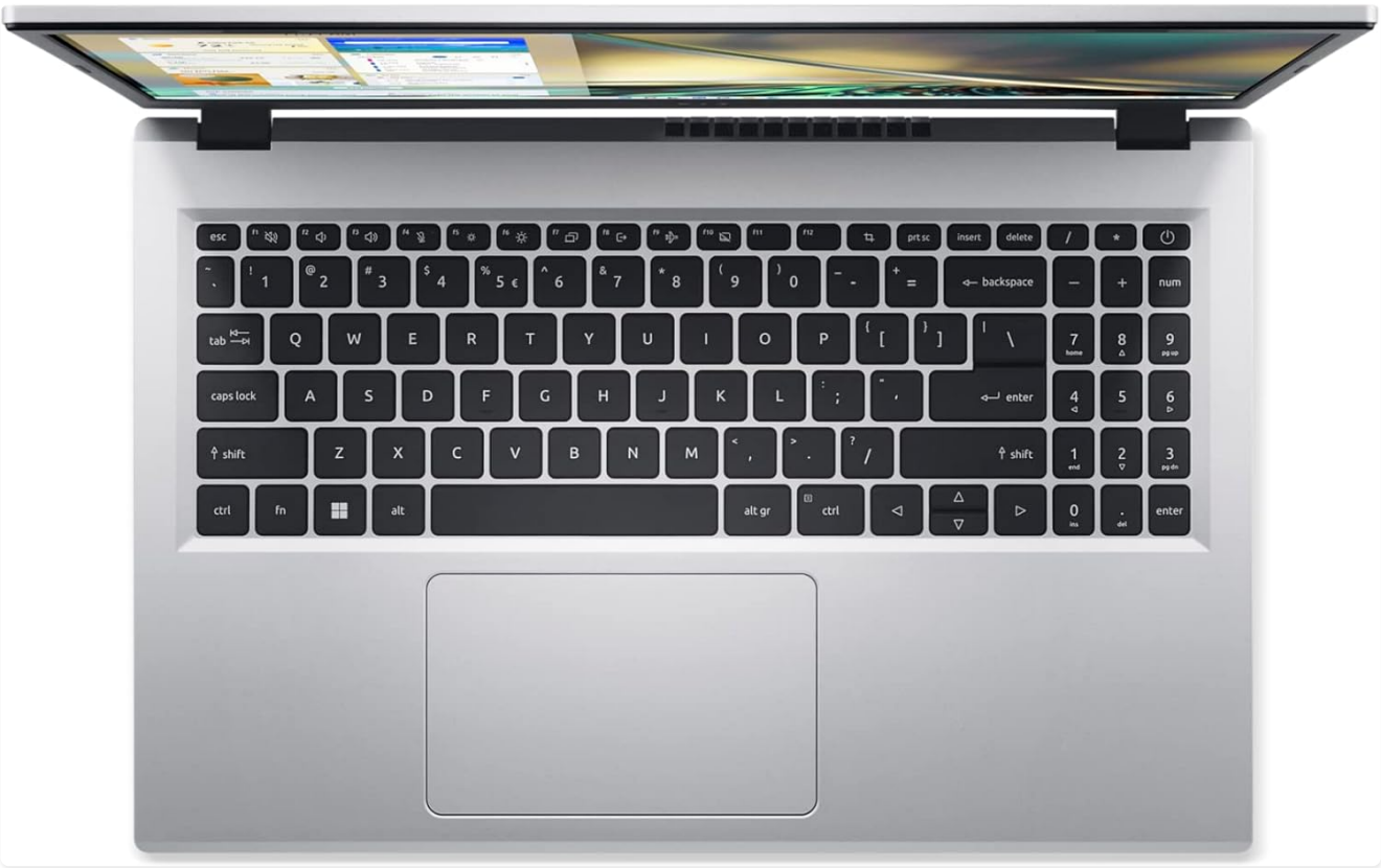
Figure 8: Windows 11 Home Interface

The laptop comes with Windows 11 Home, offering a modern interface and enhanced features for productivity and organization.