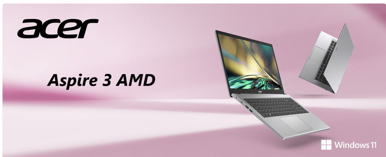
Figure 6: AMD Ryzen Processor and Radeon Graphics

The Acer Aspire 3 is powered by the AMD Ryzen 5 7520U Quad-Core Processor with AMD Radeon Graphics, 8GB LPDDR5 RAM, and a 256GB NVMe SSD. This configuration ensures smooth performance for everyday tasks, productivity applications, and light multimedia use.