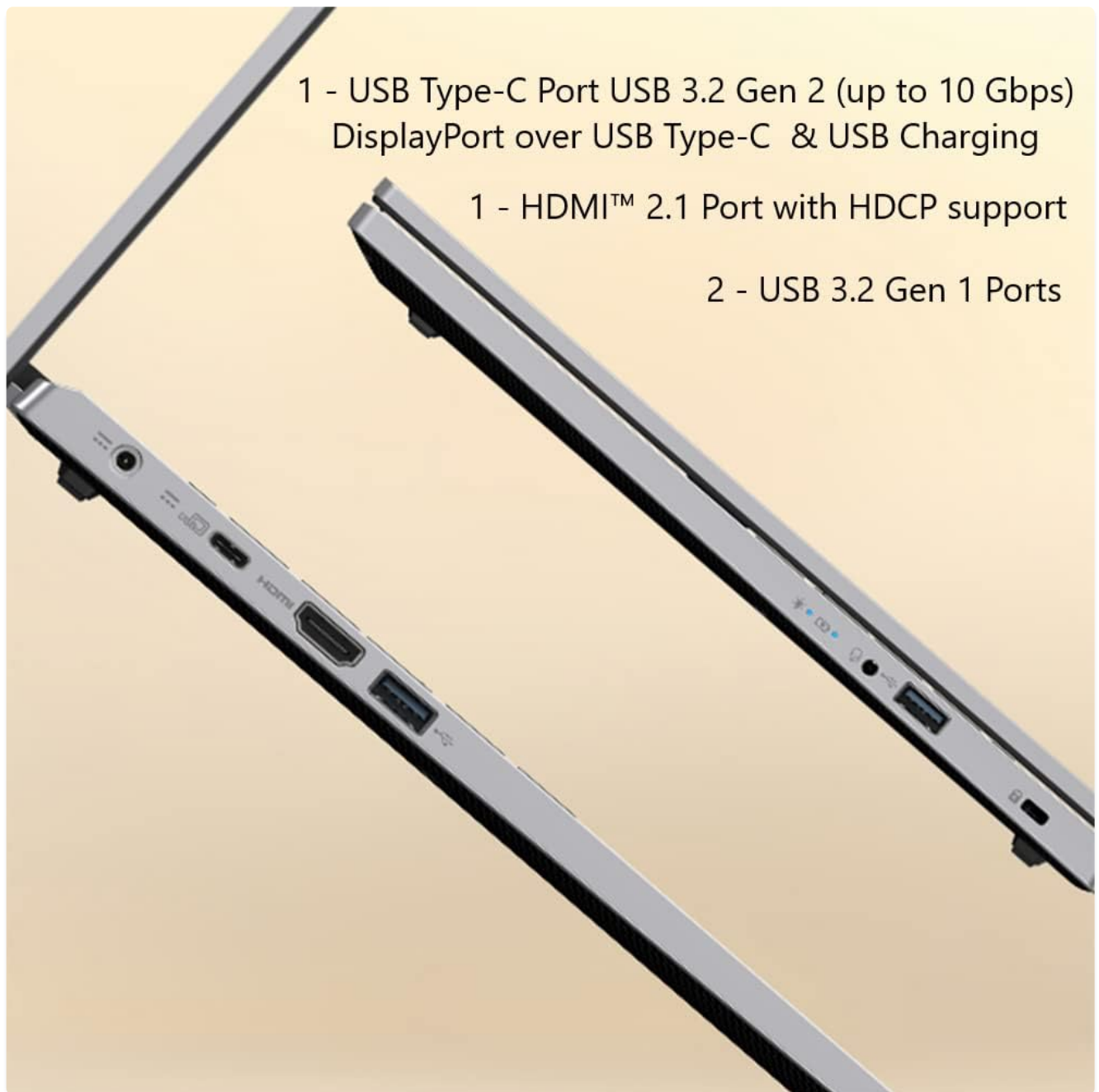
Figure 4: Right Side Ports