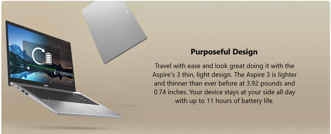
Figure 2: 15.6" Full HD IPS Display

The Aspire 3 features a thin and light design, making it portable for various environments. The 15.6" Full HD IPS display offers sharp details and crisp colors with narrow bezels for an enhanced viewing experience.