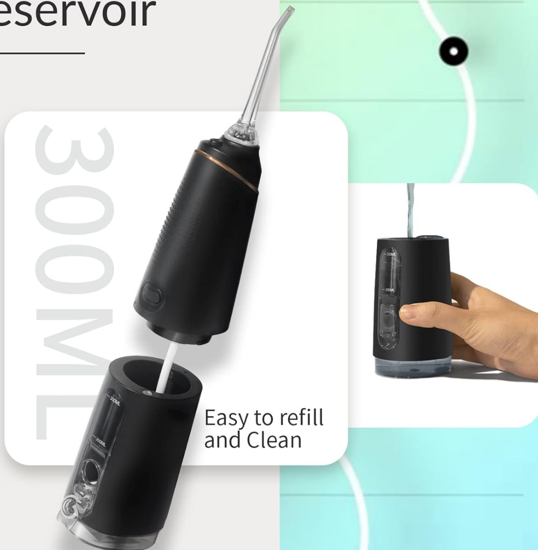
Image: A visual representation of the Liberex FF-20S Water Flosser's detachable 300ml water reservoir, demonstrating how it can be easily removed for refilling and cleaning.