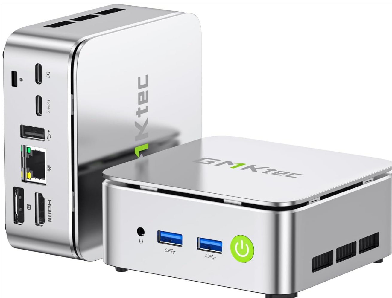
Image: The GMKtec G10 Mini PC, showcasing its compact design and various ports.

This manual provides comprehensive instructions for the GMKtec G10 Mini PC, a compact desktop computer featuring an AMD Ryzen 5 3500U processor. It is designed for various applications including office work, home entertainment, and light gaming. This guide covers initial setup, operational procedures, maintenance tips, troubleshooting common issues, and detailed product specifications to ensure optimal performance and user experience.