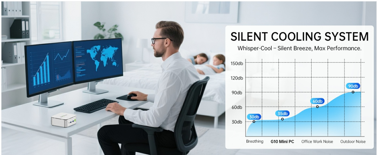
Image: A graph demonstrating the low noise output of the G10 Mini PC's silent cooling system compared to typical office and outdoor noise levels.