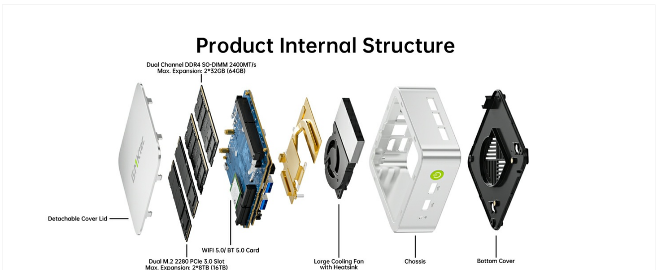
Image: An exploded diagram illustrating the internal structure of the GMKtec G10, highlighting the cooling components.