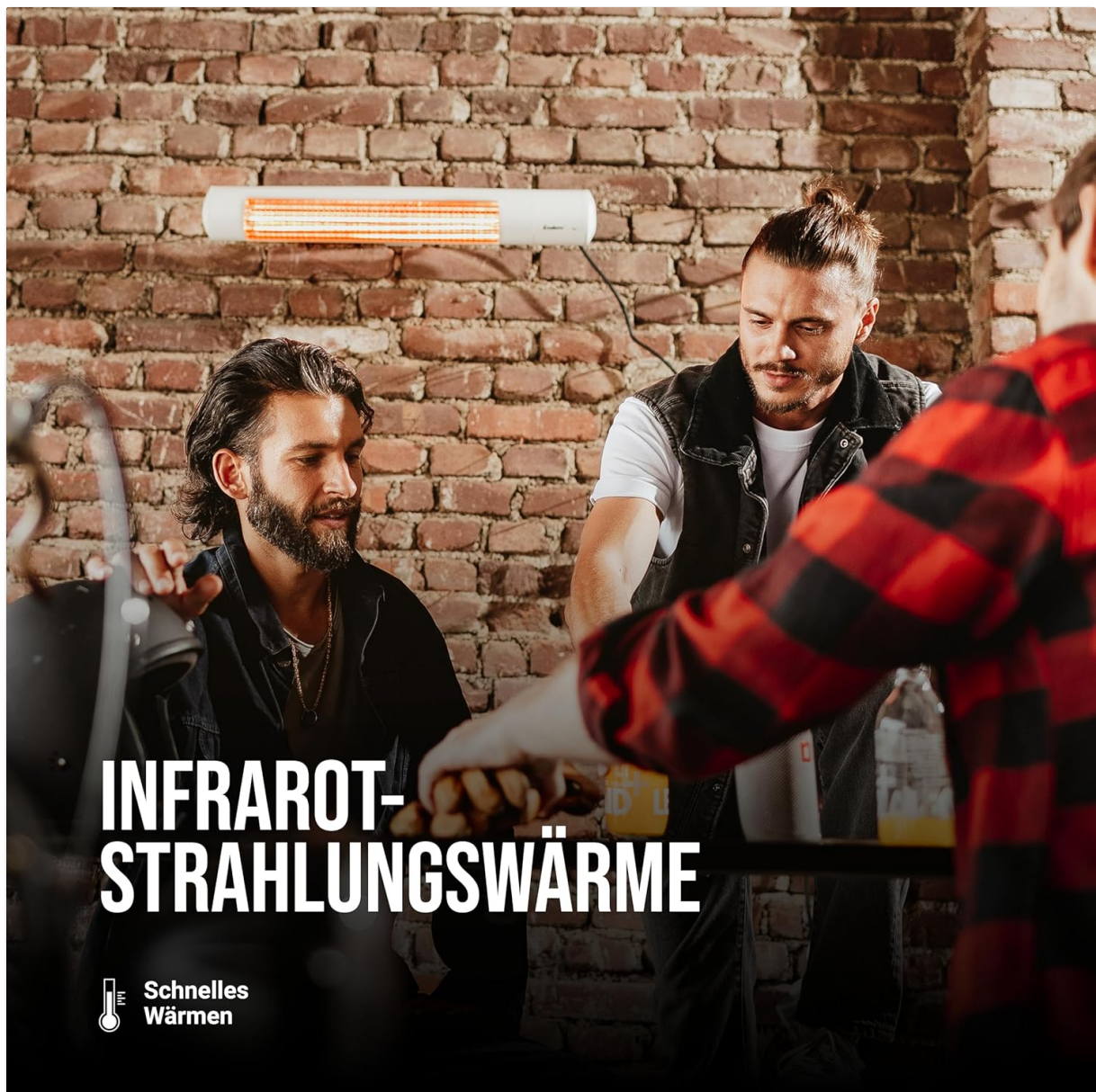
Image: An illustration of individuals experiencing the infrared radiant heat provided by the Enders Oxeo heater, emphasizing its fast heating capability.