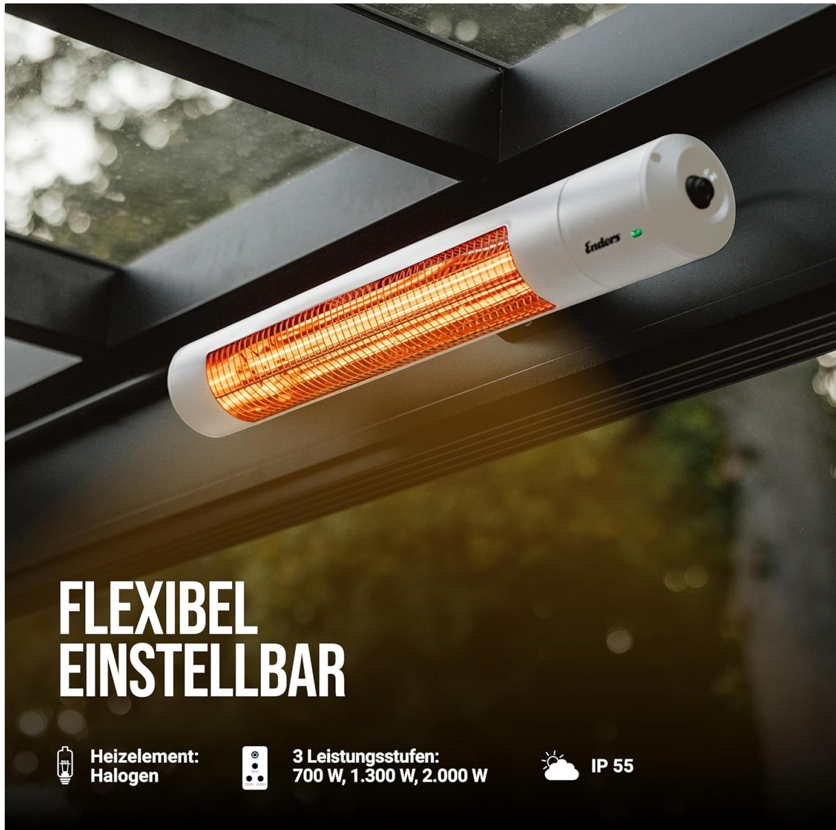
Image: The Enders Oxeo heater mounted, illustrating its flexible adjustment capabilities. It highlights the halogen heating element, three power levels (750W, 1500W, 2000W), and an IP55 rating.