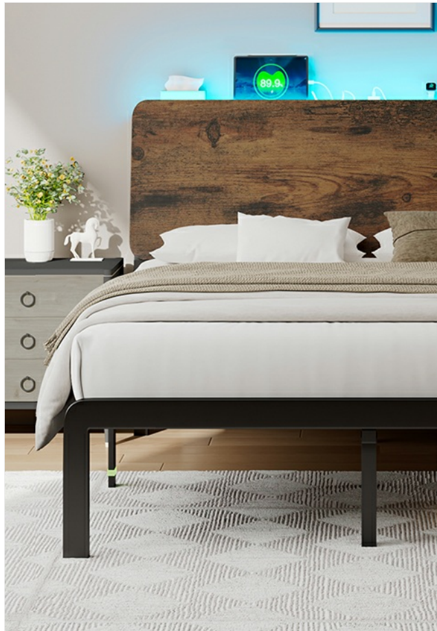
Image 2.1: Detail of fluorescent strips on bed legs. These strips enhance visibility in dim lighting, helping to prevent accidental contact.