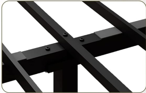
Strong Central Foundation