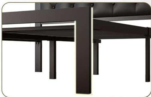
9 Thick Legs Supports