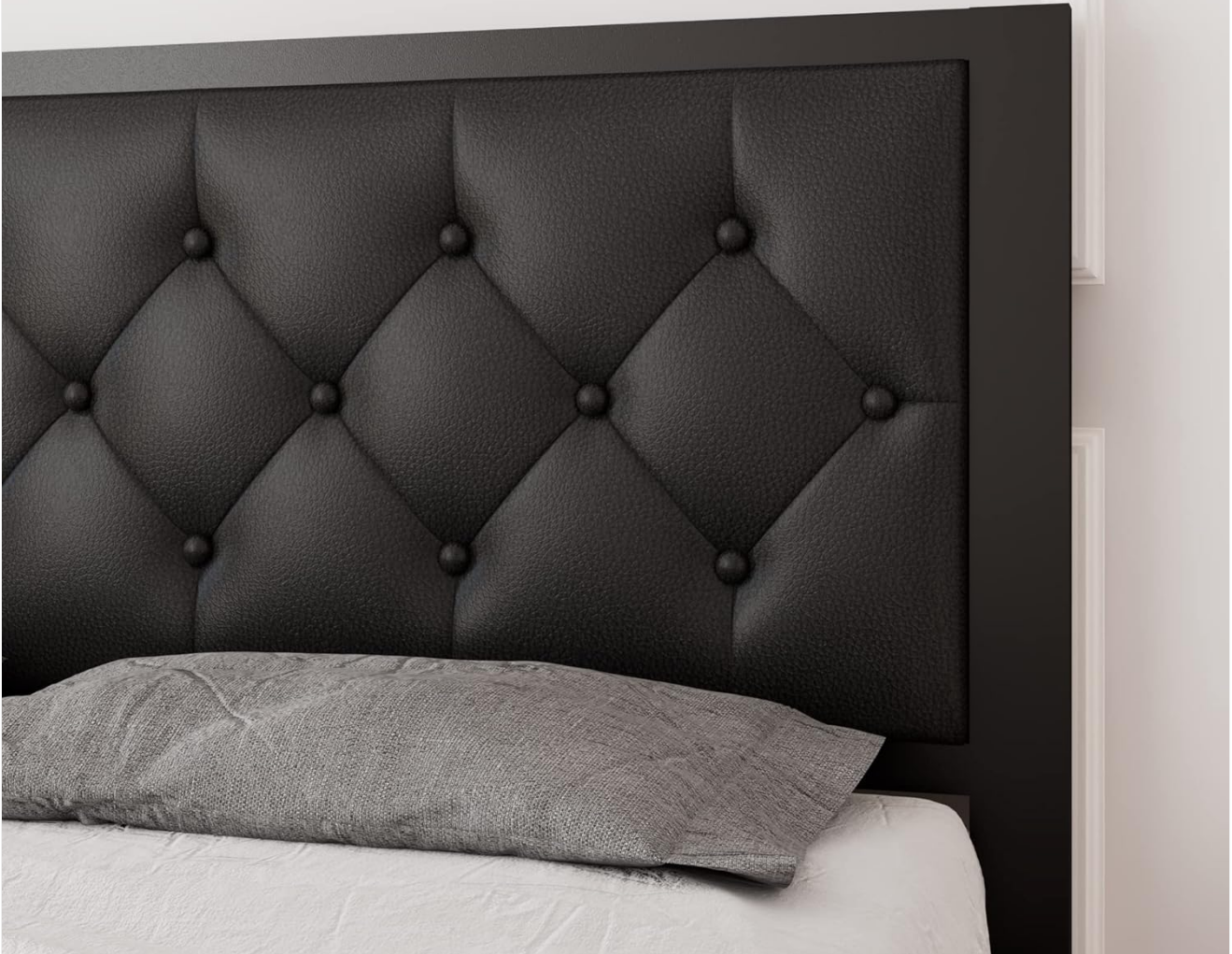
Image 5.3: Close-up of the faux leather button tufted headboard. This premium fabric is skin-friendly, soft to the touch, and easy to clean, adding a retro and classic aesthetic to your room.

Features premium faux leather with a skin-friendly and soft-touch, easy to clean and maintain.