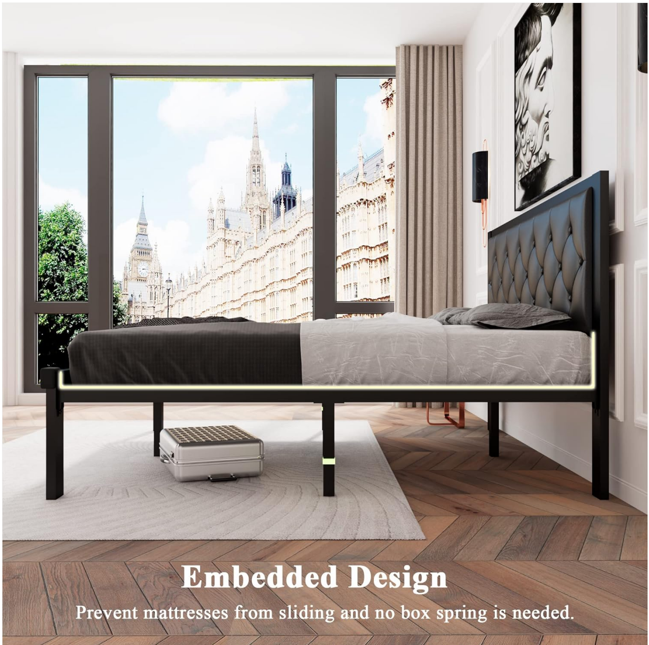
Image 5.1: Illustration of the embedded design. This feature securely holds the mattress in place, preventing shifting and eliminating the need for a box spring.