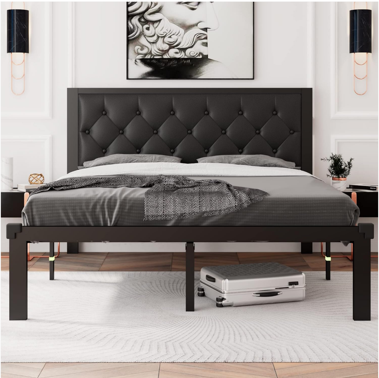
Image 1.1: Feonase Queen Size Metal Bed Frame with Faux Leather Button Tufted Headboard. This image shows the assembled bed frame with a mattress and bedding, highlighting its elegant design and under-bed clearance.