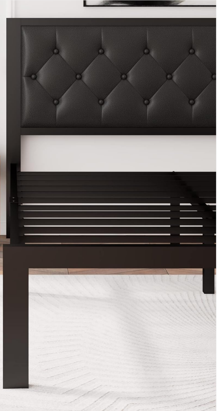
Image 4.1: Detailed view of the strong central foundation, zero noise buckles, and nine thick support legs. These elements contribute to the bed frame's stability and quiet operation.