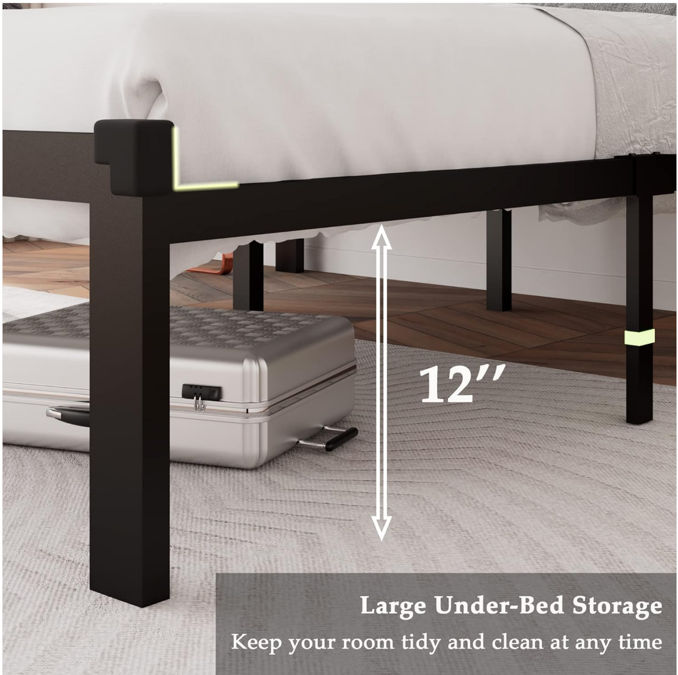
Image 5.2: Visual representation of the 12-inch under-bed storage. This generous clearance allows for convenient storage of luggage, boxes, and other items.