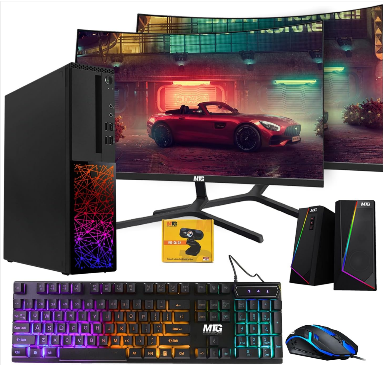
Image: Complete TechMagnet Galaxy Gaming Desktop PC setup, including the tower, dual curved monitors, RGB keyboard, mouse, speaker, and webcam.