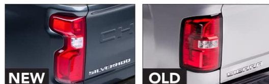
Figure 1: Ensure your truck bed matches the specified dimensions for proper fitment. This diagram illustrates how to measure your truck bed and identifies the correct new body style for 2019+ Chevrolet Silverado/GMC Sierra 1500 with a 5' 10" bed.

*GM OFFERED TWO BODY STYLES FOR 2019: THE NEW AND THE OLD (LEGACY/LIMITED). PLEASE CONFIRM APPLICATION BEFORE ORDERING.