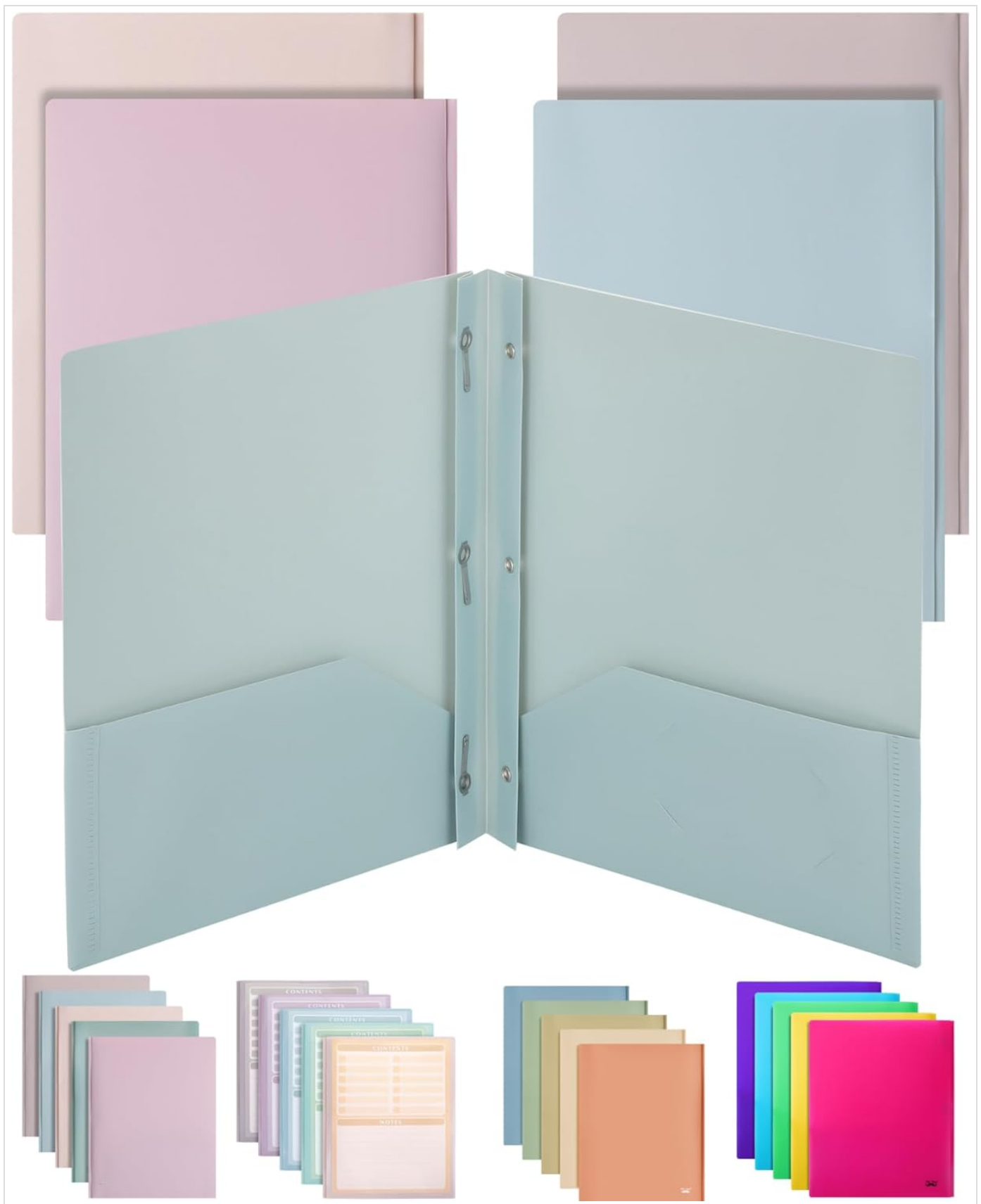
Image: A set of five Mr. Pen plastic folders in muted pastel colors, including pink, light blue, and beige. Some folders are shown open, revealing the internal pockets and three metal prongs designed to hold punched papers. Others are stacked neatly, showcasing the variety of colors in the pack.