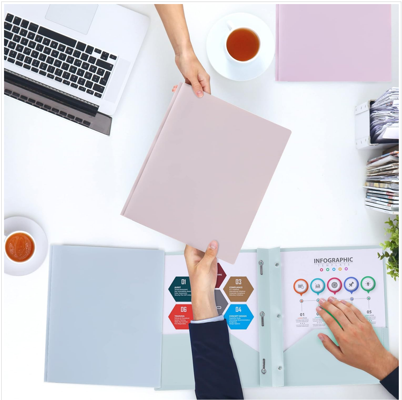
Image: A top-down view of a white desk where two individuals are exchanging a Mr. Pen folder. One person is handing a closed beige folder to another, who is holding an open light green folder with documents inside. This illustrates the practical use and ease of handling the folders in a collaborative or organizational setting.