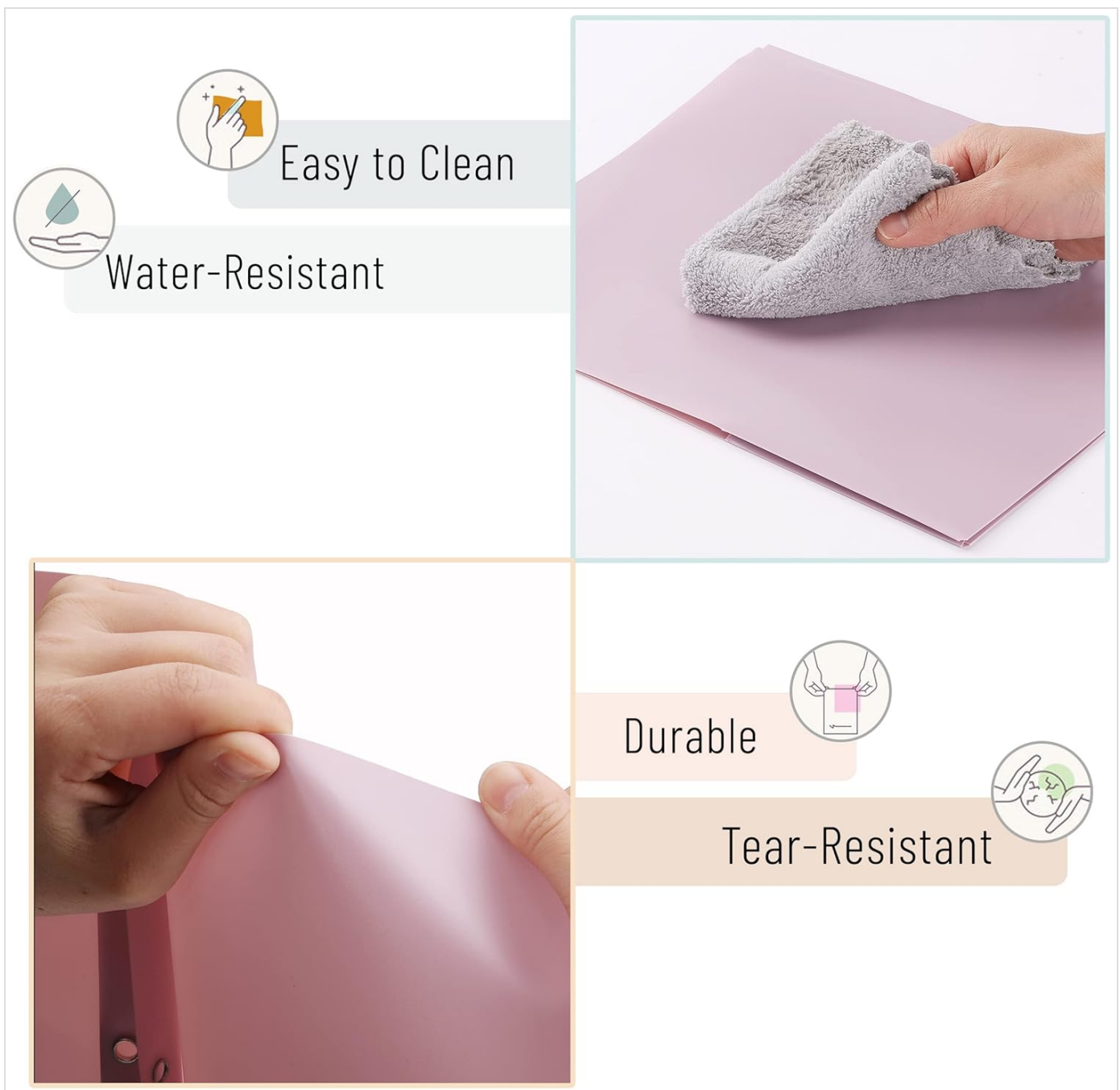
Image: A collage of four images highlighting the folder's material properties. One shows water beading on the surface (water-resistant), another shows a hand wiping the folder with a cloth (easy to clean), and two others demonstrate the flexibility and strength of the plastic (durable and tear-resistant).