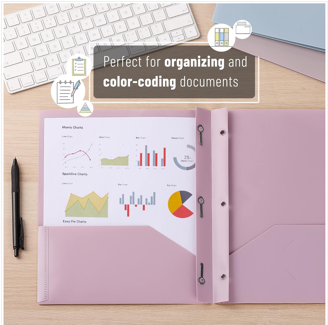
Image: An open pink Mr. Pen folder lying on a white desk next to a keyboard and pen. Various charts and documents are placed inside the folder, illustrating its utility for organizing and color-coding different types of paperwork.