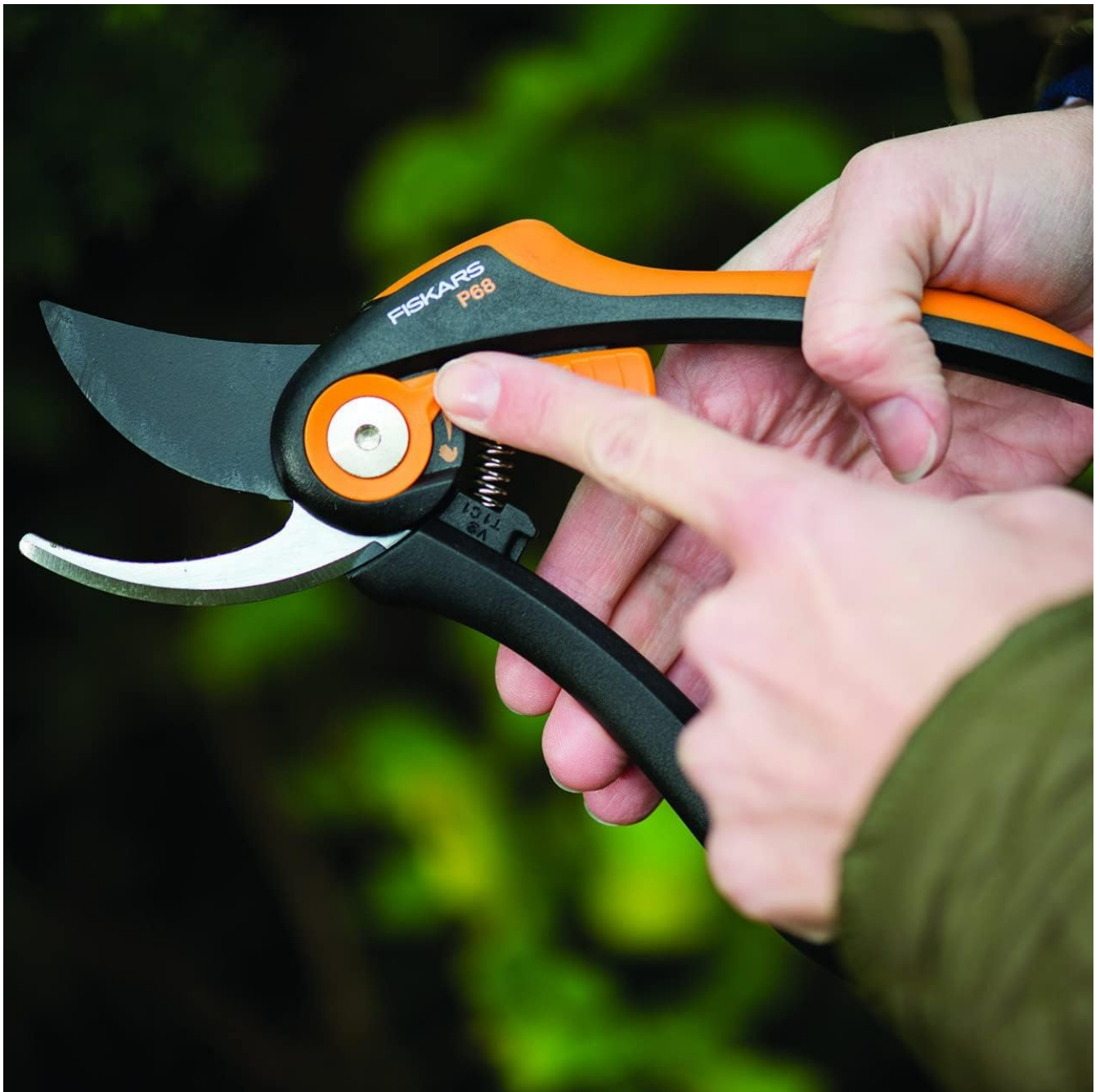
Image: A hand demonstrating the unlocking mechanism of the Fiskars SmartFit Pruner, showing the spring and orange lock.