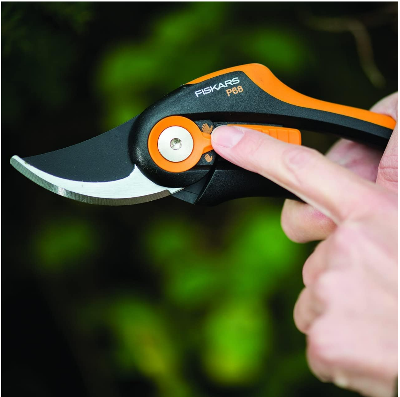
Image: A hand adjusting the orange dial on the Fiskars SmartFit Pruner to change the handle span and cutting width.