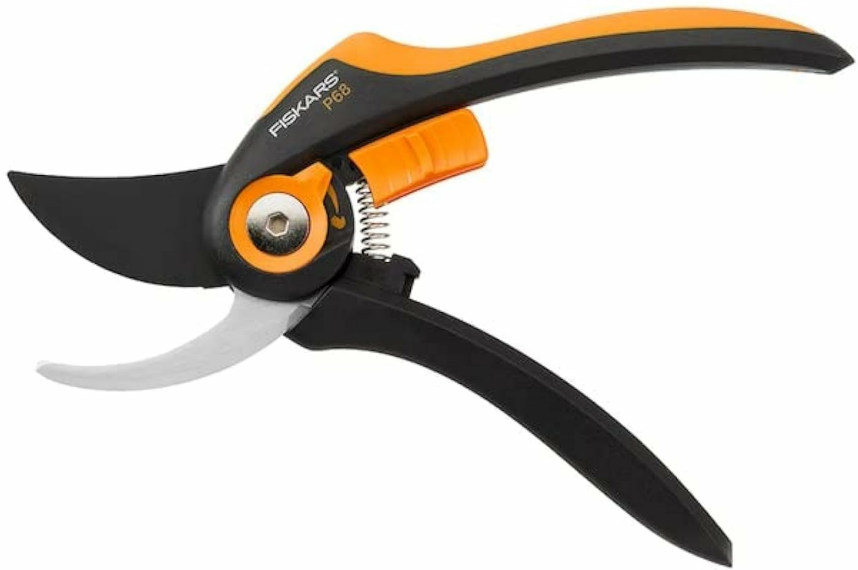
Image: The Fiskars SmartFit Pruner Bypass P68, showcasing its black and orange design with bypass blades.