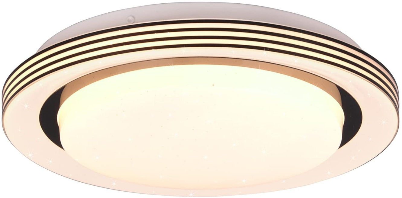
Image 1.1: Front view of the Reality Leuchten Atria R67042832 LED Ceiling Light.