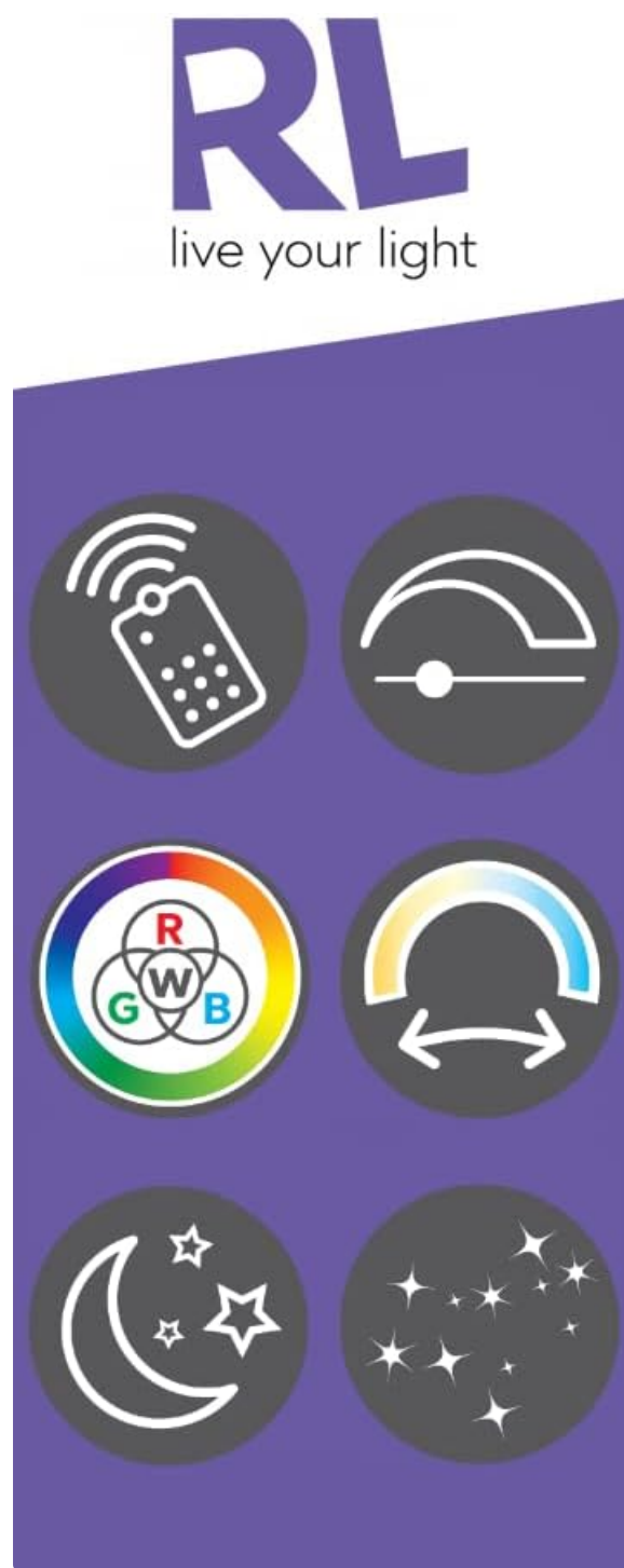
Image 5.1: Visual representation of key features: Remote control, dimming, color temperature adjustment, night light, and starlight effect.

Your Reality Leuchten Atria ceiling light comes with a remote control for convenient operation of its various functions.