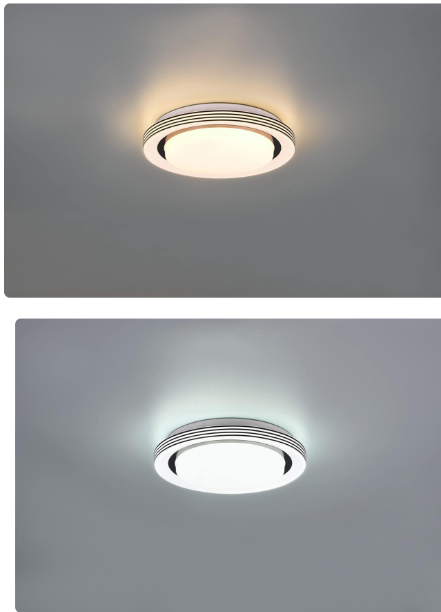
Image 5.2: The light can be adjusted from warm white (left) to cool white (right).