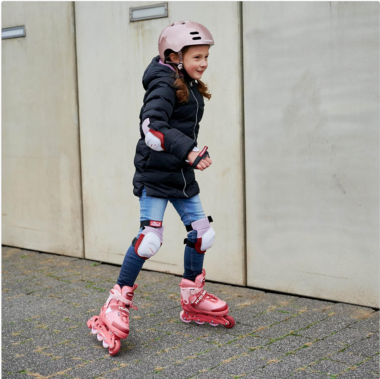
Image: A child actively skating with HUDORA Mia/Leon 2.0 Inline Skates, showcasing the product in motion.