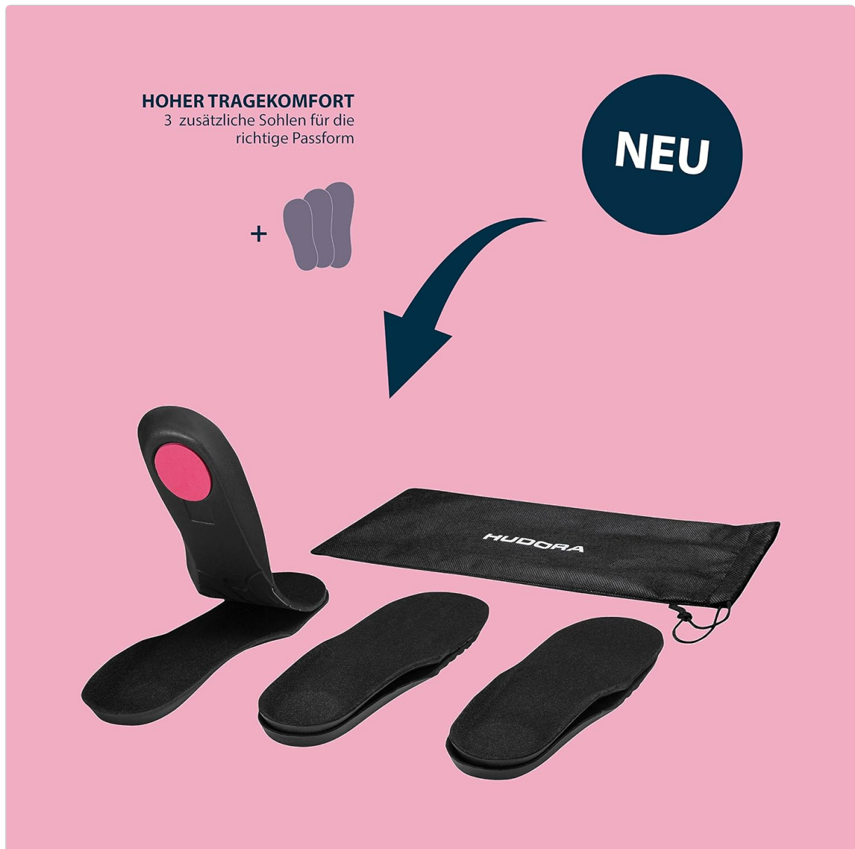
Image: Three additional insoles and a storage bag for the HUDORA Mia/Leon 2.0 Inline Skates. These insoles enhance comfort and ensure a precise fit.