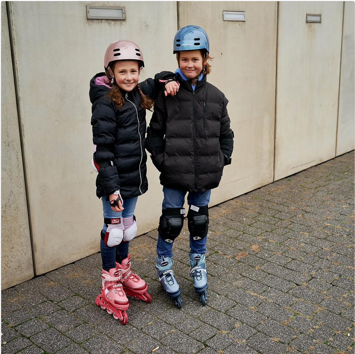
Image: Two children, one wearing pink HUDORA Mia/Leon 2.0 skates and the other blue, both equipped with helmets and protective pads, ready for skating.