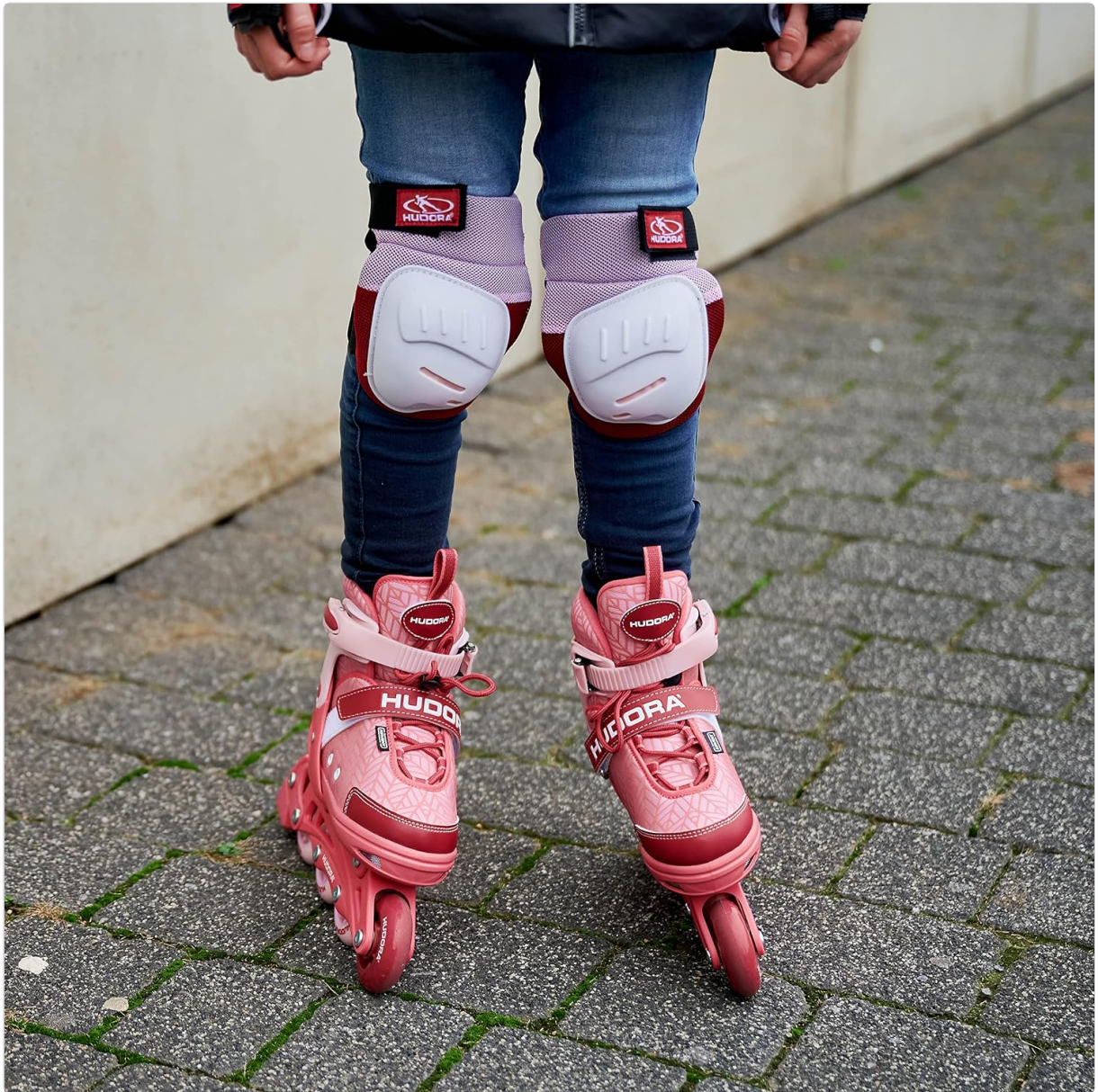
Image: A child wearing HUDORA Mia/Leon 2.0 Inline Skates and protective knee pads, demonstrating proper safety attire during use.