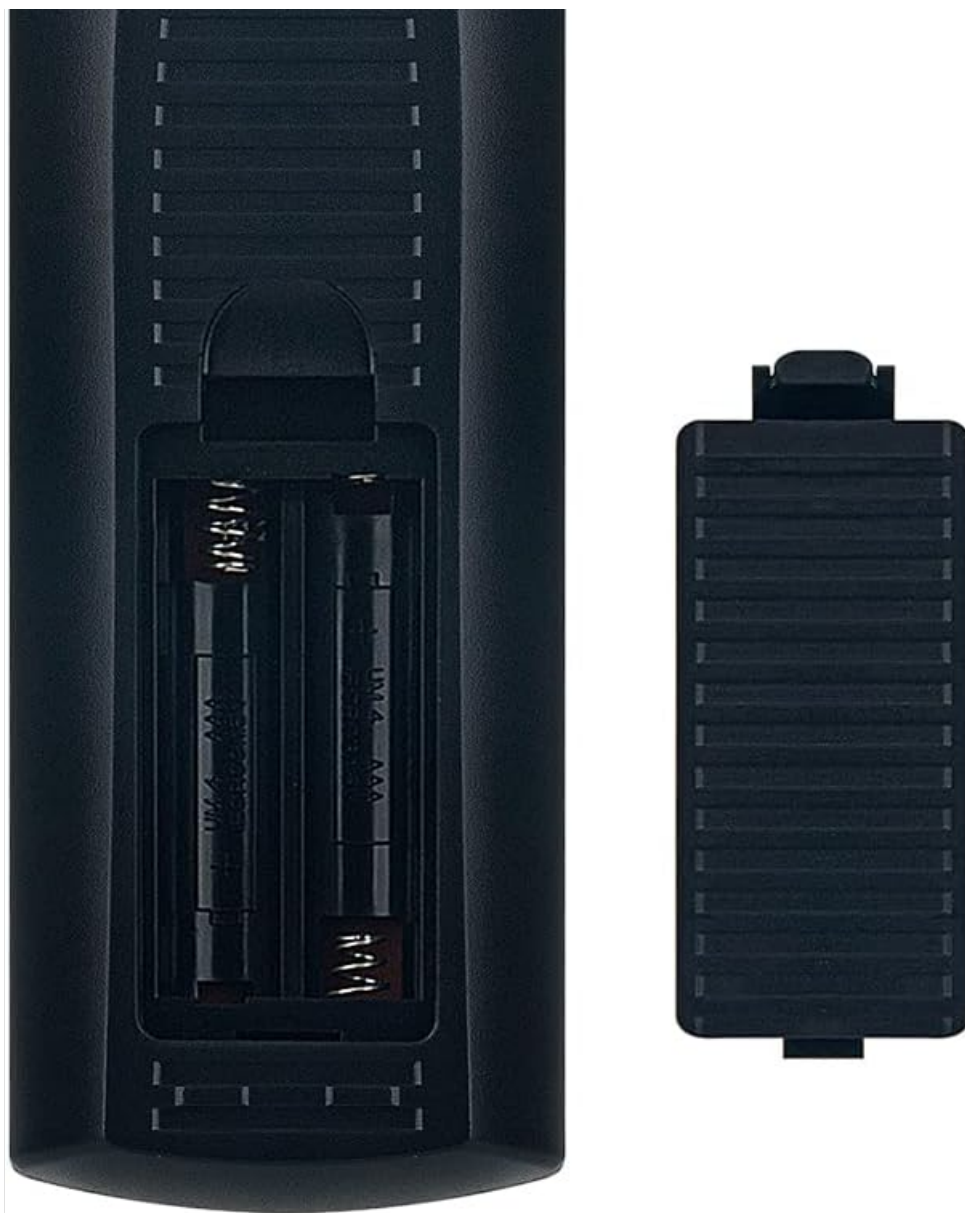
Image: Rear view of the remote control with the battery cover open, illustrating the correct placement for two AAA batteries.