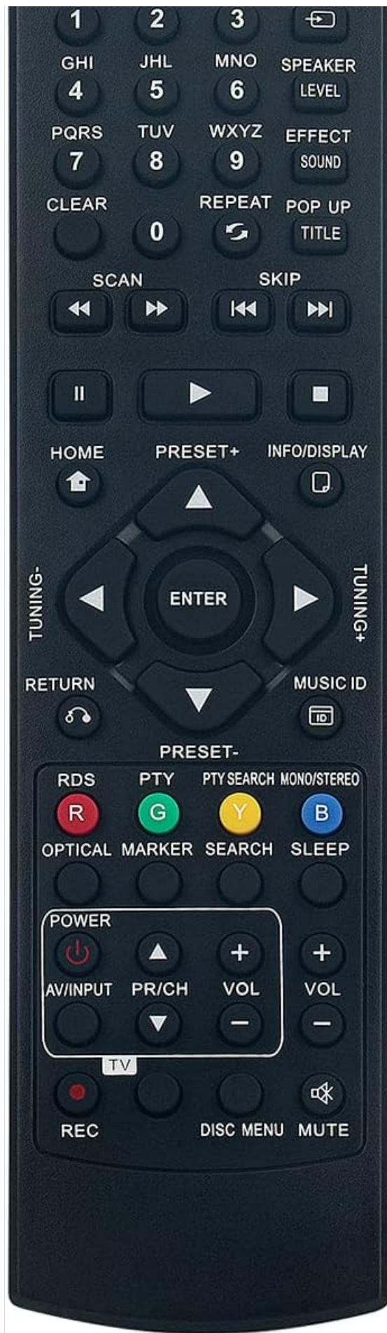
Image: Front view of the Allimity AKB72976003 remote control, displaying the layout of all buttons.

Below is a general guide to common button functions. Specific functionality may vary slightly depending on your LG Home Cinema System model.