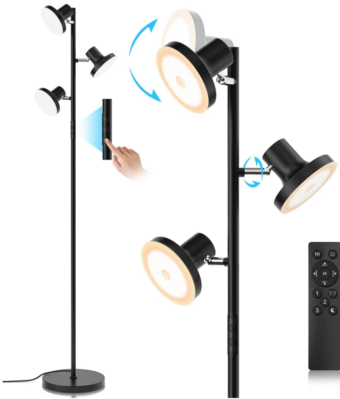
Image: The SIBRILLE 36W LED Tree Floor Lamp with its remote control, showcasing its three rotatable light heads and touch control area on the pole.