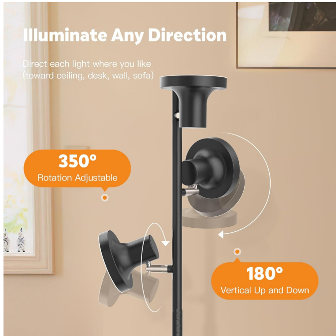
Image: Close-up view of the rotatable and vertically adjustable light heads on the SIBRILLE floor lamp, demonstrating their flexibility.

Each of the three light heads can be rotated 350° horizontally and adjusted 180° vertically. This allows you to direct light precisely where needed, whether for ambient room lighting, task lighting for reading, or highlighting specific areas.