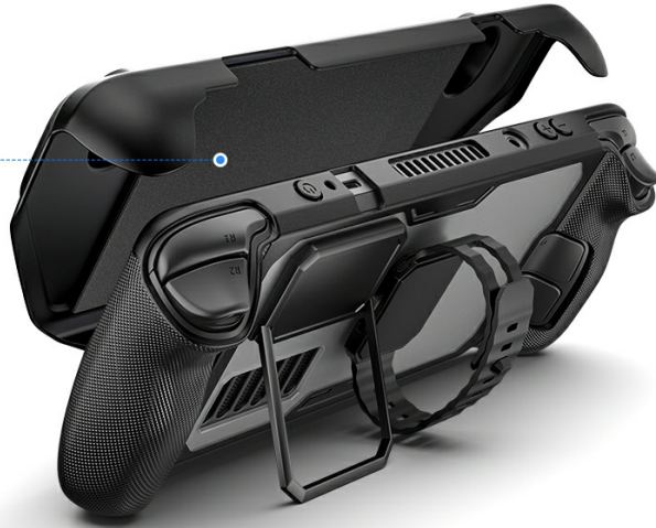
Image 5.4: The modular design supports accessories like a cooling fan for improved heat dissipation.