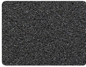
Internal Protection ( EVA Cotton )