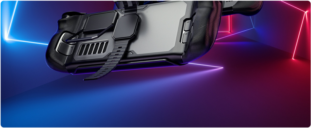
Image 5.1: Overview of the ModCase's 360-degree protection features.