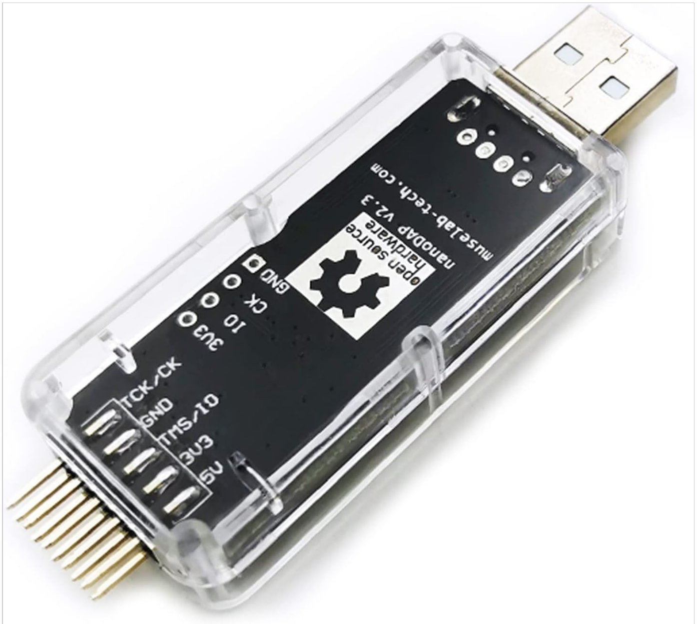
Figure 2: Angled view of the DAPLink Debug Probe, highlighting the debug pin header. Proper connection to the target board's debug interface is crucial for functionality.